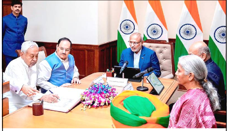
April 10, 2026 nü New Delhi nung linük tatong Tir aser Rajya Sabha Chairman, CP Radhakrishnan-i ketdangsüa Bihar Chief Minister, Nitish Kumar nem MP tenanzükba agidaksüadang tangokba noksa nung angur. Kasa noksa nung Union Minister ana- JP Nadda aser Nirmala Sitharaman nata angur.