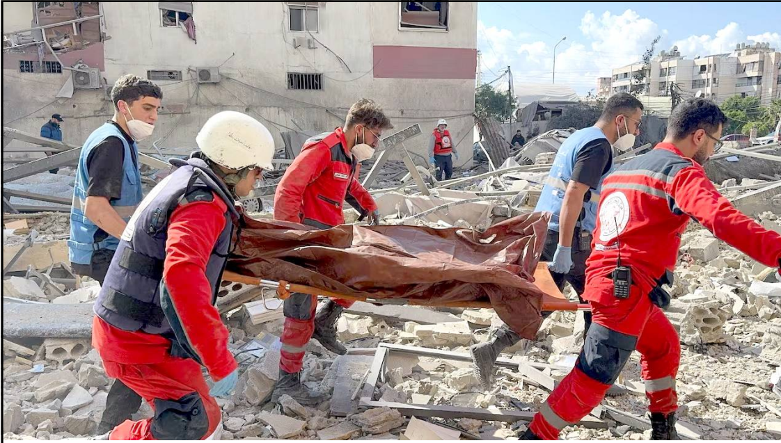
March 09, 2026 nü Israel-i Lebanon yimtiba, Beirut amakba sülen tangokba noksa nung angur.

April 10, 2026: Khristan organisation aikati, US aser Iran na tsünga ceasefire liaka Lebanon linük nung rara manener, anungji ceasefire nung Lebanon-a züngoktsüla, ta akhangar.