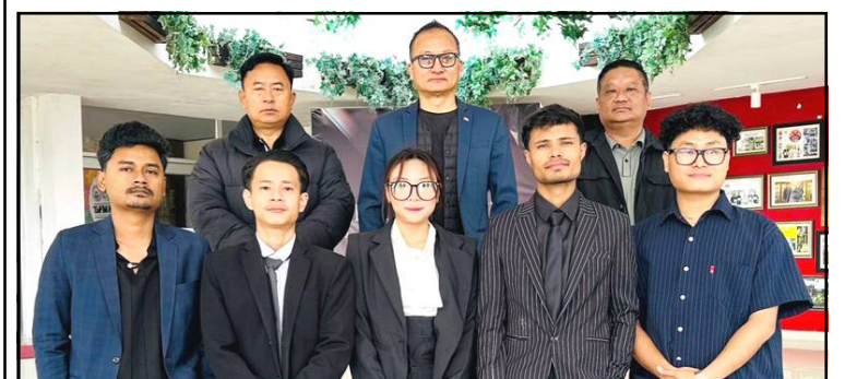
TaFMA ketdangsurtem aser kentener pongu tangokba noksa nung angur.

Kohima, Rongchii/April 10 (TYO): Espire Hospitality Group kübok Uttarakhand nung TaFMA partner resort tem nung adentsü atema shimba kentener pongu minoktsüba sentong ka Task Force for Music & Arts (TaFMA)-i ayongzükba agiogo.