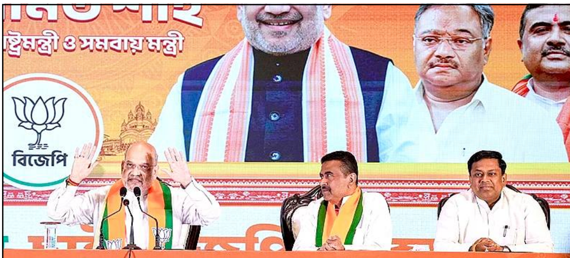
April 10, 2026 nü Kolkata nung BJP manifesto sayaba sentong nung Union Home Minister, Amit Shah-i osangbenertem den jembidang tangokba noksa nung angur. Kasa noksa nung Union Minister Sukanta Majumdar (ajichi) aser West Bengal state assembly nung Opposition lenir, Suvendu Adhikari nata angur.

Kolkata, Rongchii/April 10 (Agencies): Hokolbarnü Kolkata nung Union Home Minister, Amit Shah-i, West Bengal nung BJP-i sorkar kümra tetsürtem nem indangindanga bank account nung sen 3,000 inoktsütsü, ta metetdaksü.