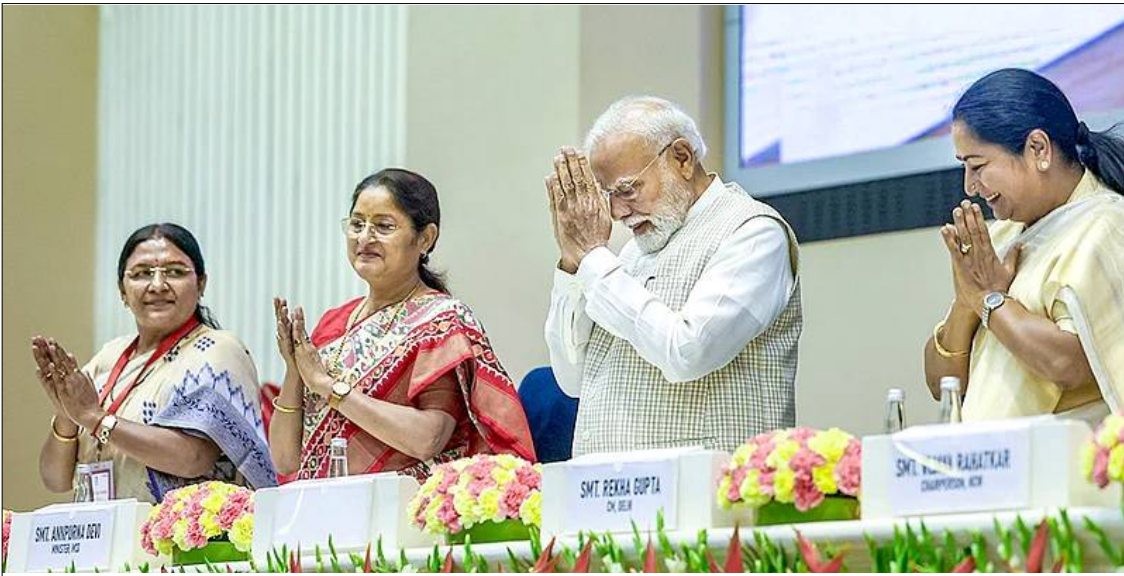
April 13, 2026 nü New Delhi nung Ato kilonser Narendra Modi 'Nari Shakti Vandan Sammelan' sentong nung adendang tangokba noksa nung angur. Kasa noksa nung Delhi Chief Minister Rekha Gupta aser Union Minister Annpurna Devi nata angur.