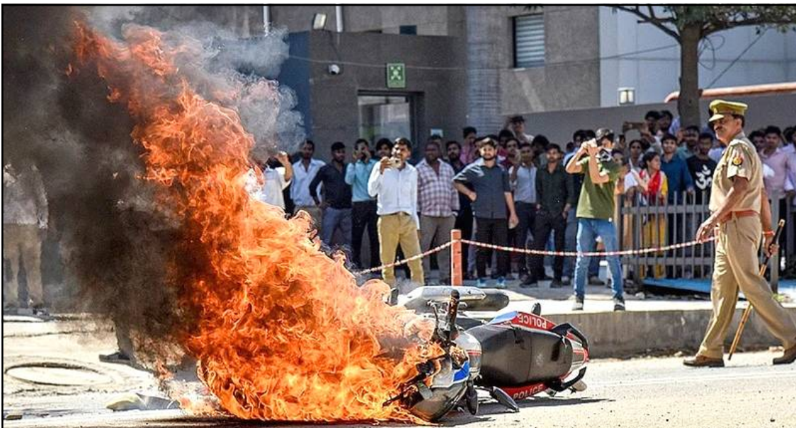
April 13, 2026 nü Uttar Pradesh kübok Gautam Buddh Nagar district nung factory nung inyakerteri taa tujang, ta longkak aitba mapang police bike ka rongdoktsüdang tangokba noksa nung angur.