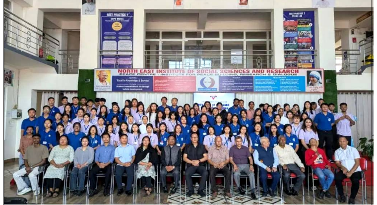
NEISSR, Chümoukedima nung April 18, 2026 nü YMCA unit tasen ka tenzükba mapang tangokba noksa nung angur.