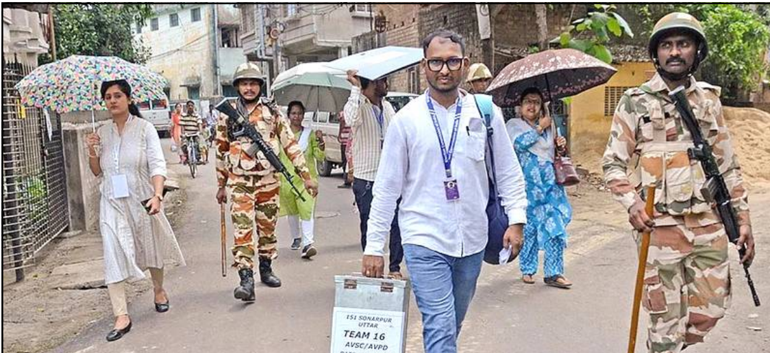
April 19, 2026 nü Kolkata kübok Sonarpur North Assembly constituency nung polling ketdangsertemi kibok sema kanga teintet sensotem nem vote agütsütsü atema election osettem bener aoba noksa nung angur.

2024 küm June 29 nüa Virudhunagar district nung aliba firecracker unit ka nung mi lendong ataloka nisung pezü asü aser ka yirua liasü.