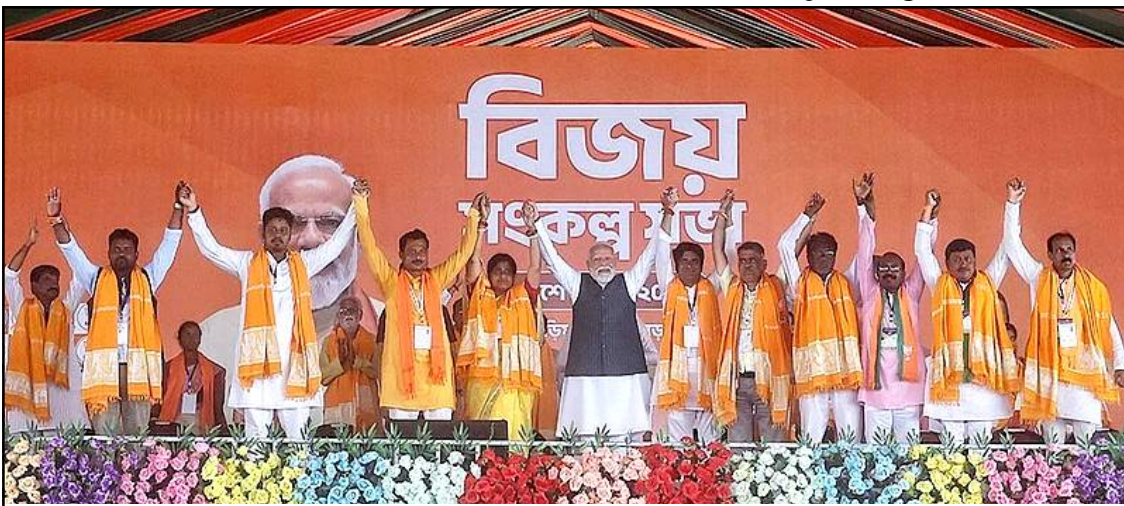
April 19, 2026 nü Bishnupur nung Ato kilonser, Narendra Modi election nüboyim sentong ka nung adenba noksa nung angur.

New Delhi, Rongchii/April 19 (Agencies): Amongnü Communist Party of India (Marxist) aser Communist Party of India (CPI) nati shidi ajanga Election Commission of India (ECI) dang, Ato kilonser Narendra Modi anema inyaktsüla, kechiyong pai assembly election mapang nung Women's Reservation Bill indang jembio, ta metetdaksü.