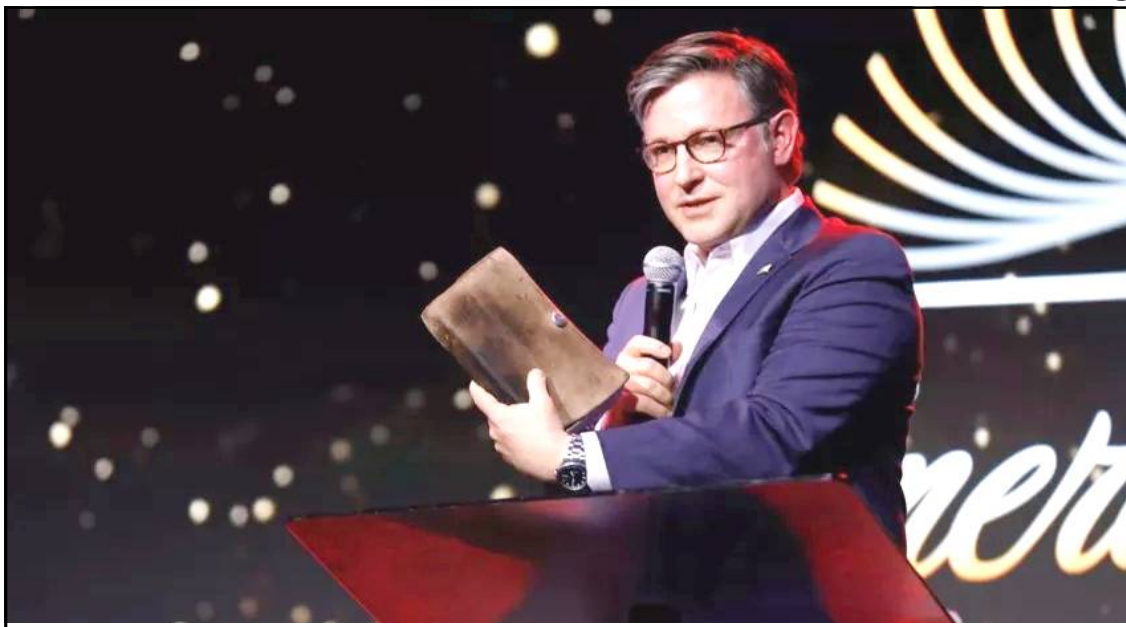
April 18, 2026 aonung Washington D.C nung 'America Reads The Bible' tetenzük sentong nung House Speaker Mike Johnson-i jembidang tangokba noksa nung angur.

Washington, Rongchii/April 19 (Agencies): Washington D.C nung hopta tepiyong Lai azüngba marathon Amongnü Museum of the Bible (MoTB) nung tenzüksüogo.