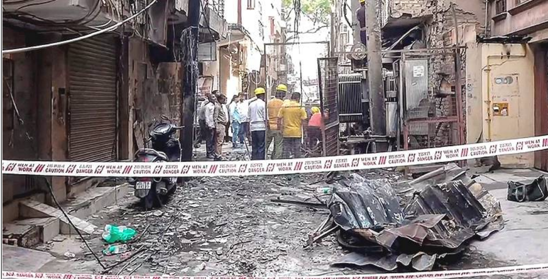
April 25, 2026: New Delhi kübok Laxmi Nagar tesem nung electric transformer ka nungi mi adoka iba temeket nung aliba kitem dak kongshiba sülen ketdangsurtemi iba tesem asadanga noksa nung angur. Iba lendong nung nisung 14 kümzüka liasü.

Arvind Kejriwal-i aniba pary asoshi takoksa tulu asütsü. "Rajya Sabha nung AAP züngsem 2/3rd-i Constitution of India nung agüja aliba provision amshia BJP nung adentsü telemtetba agiogo," ta Raghav Chadha-i ashi. Osangbenertem den sensakemba mapang Rajya Sabha MP yagi Kejriwal-i aniba party aitsü, shirnoki ochi mashi anema raratsü nangzükter Delhi nung sorkar kümteta liasü, parnok ochi mashi kümogo, ta ashi. Arishi küm 37 tain Chadha ya party tenzükba mapang nungi Kejriwal den inyaka aruogo. Pa ya chartered accountant ka aser pa mezüng India Against Corruption movement tatembangbuba shilem nung Kejriwal den sendaktep aser iba mapang political party ka tentettsü atema sensakema liasü. Iba sülen pa ya AAP nung tongtibang lenir ka aküm aser arishi küm 26 dang asüba mapang national otongdar aser national senyur aküm.