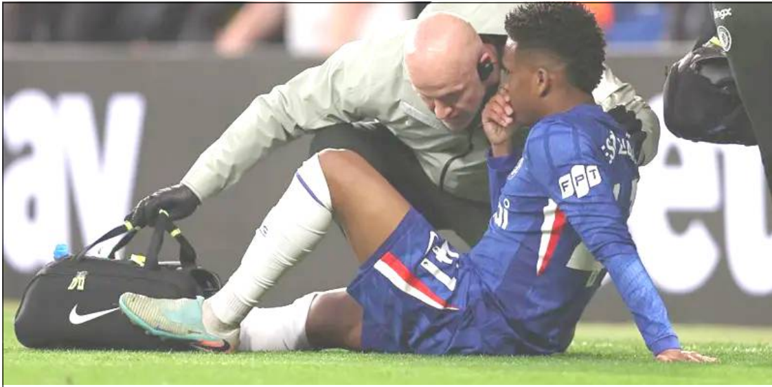
Taoba hopta Manchester United den goal 1-0 agi makokba asaya nung hamstring yiruba sülen Brazil nunger asayar Estevao World Cup asayatetsü masayatetsü mejangjai kümogo

Rongchii/April 25, 2026 (Agencies): Brazil aser Chelsea forward Estevao hamstring yiruba ajanga tang asaya aliba season nung tanungba asayatem masayatetsüsa akümbe sülen pa World Cup asayatetsü masayatetsü mejangja kümogo.