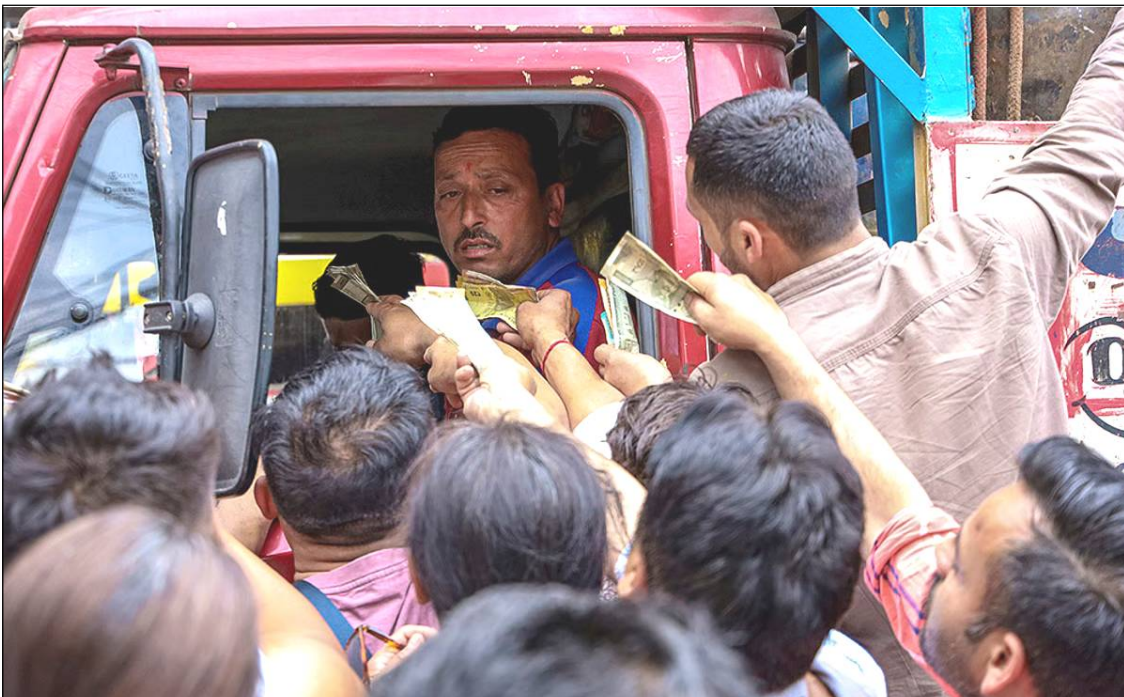
April 25, 2026 : Gas supply dak sendakba nung tetsükdaktsü adoker aliba mapang Dharamshala kübok McLeodganj Chowk nung cylinder bena aliba delivery truck ka nungi sen agütsür LPG cylinder agizüksü atema nürurtem aritepa aoba noksa nung angur.