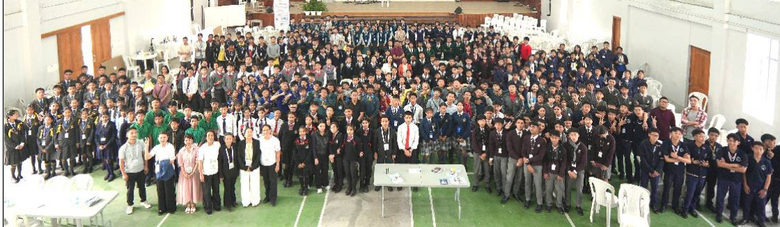
RMLCF Tobacco-Free Campaign Phase IV takok ngua April 24, 2026 nü Kevillhouü Rio Auditorium, G. Rio School nung agiogo. Iba sentong nung school 20 (government school ana aser private school 18) nungi kaketshir 369 aser tesayur 35 arua shilem agia liasü.

Iba ya ajanga kaketshirtem graduate asüdag parnoki janraba dangi mera ka anasa orr alitsü.