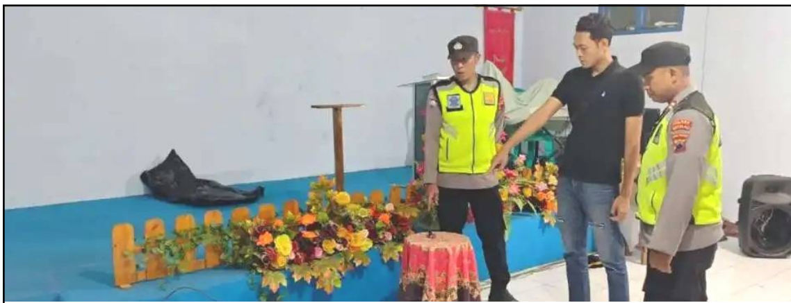
Mount Sinai Full Gospel Bethel Church, Tamansari District, Central Java nung aliba arogo ka nung inyaker kati police dang par tekülem kidang April 21 nü auyaba indang rasaa ashiba noksa nung angur.