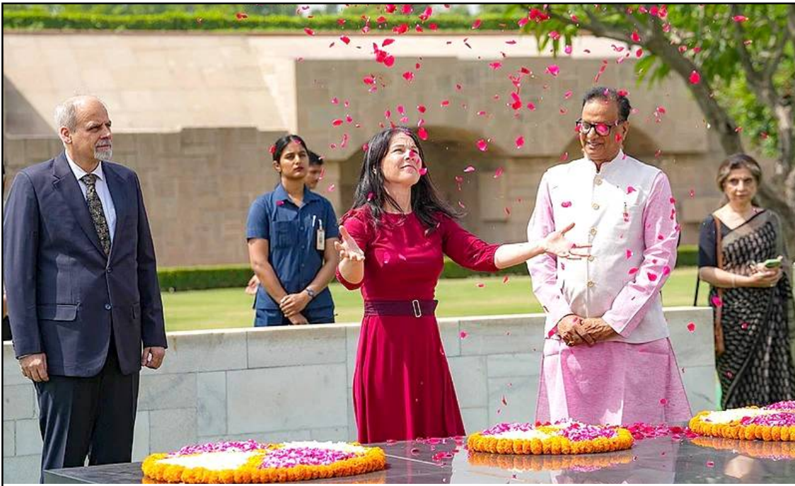
April 28, 2026 nung New Delhi nung United Nations General Assembly (UNGA) Tir, Annalena Baerbock-i Rajghat semdanga Mahatma Gandhi nem akhüm agütsüdang tangokba noksa nung angur.