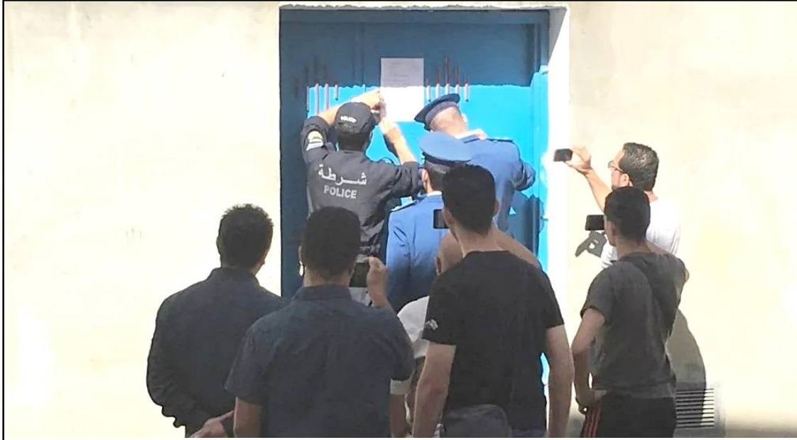
2017 küm Algeria nung aliba Tizi-Ouzou yimti nung ketdangsertemi Full Gospel Arogo Tenla ki shibangtsüdang tangokba noksa nung angur. Algeria nung Protestant Arogo tulutibaji iba Arogo ya liasü.

April 28, 2026: Algeria nung Protestant Arogo Tenla kitem ajak amai shibangdaksüdar, aser ibaji ajanga Khristan meyirjang aikati pei kidang dang tekülem sentong agitsüsa kümogo.