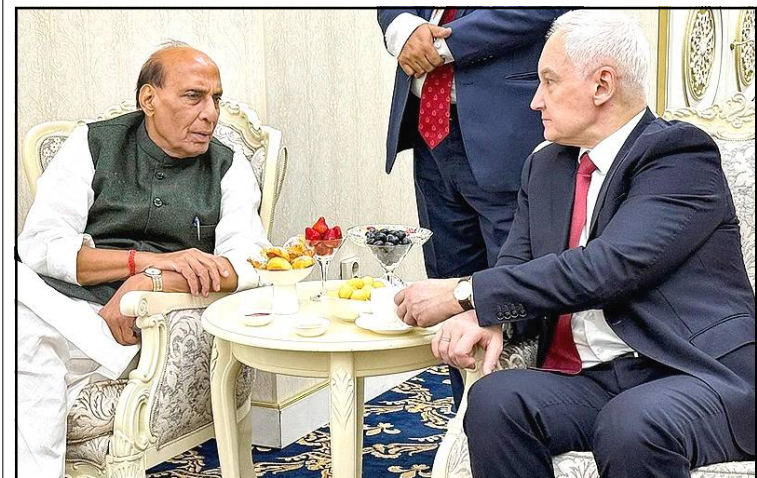
April 28, 2026 nü Bishkek, Kyrgyzstan nung SCO Defence Minister tem senden alidang India Defence Minister, Rajnath Singh aser Russia Defence Minister, Andrey Belousov na ajurua jembidang tangokba noksa nung angur.

Tangbo Rajya Sabha nung BJP MP 113 kümogo.