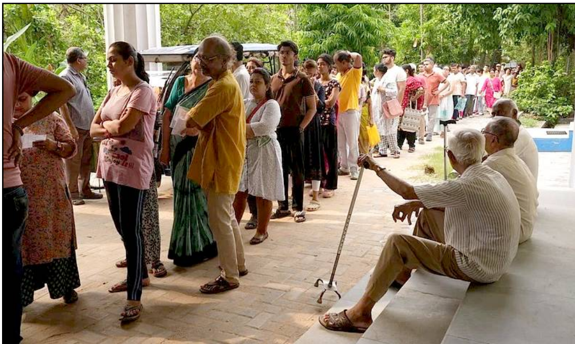
April 29, 2026 nü Kolkata nung aliba polling station ka nung vote agütsütsü atema nisung aika tarensena nokdaka aliba noksa nung angur. West Bengal nung Assembly elections tanabuba shilem tembangogo.

New Delhi, April 29 (Agencies): Bodhbarnü West Bengal assembly elections tanabuba shilem nung nikongdang 5:00 ako tashi nung voters shilem 89.99-i vote agütsü, ta Election Commission of India-i metetdaksü.