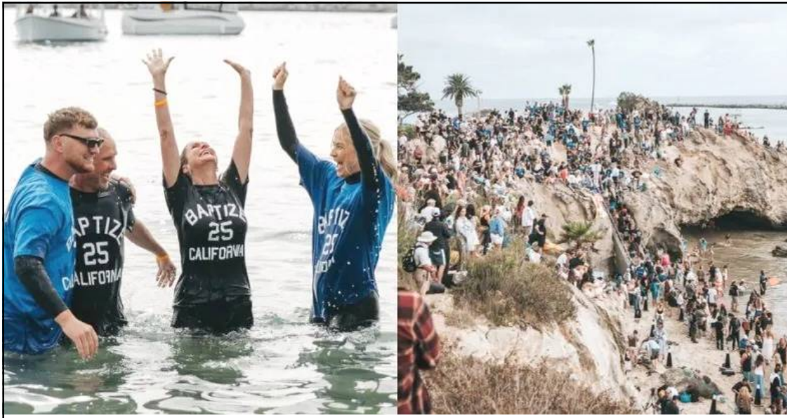
2025 küm May 3 anogo nung 'Baptize California' sentong nung tangokba noksa nung angur.

April 29, 2026: California nung aliba Arogo tuluka nung pastor kati tenzüka evangelism ministry kübok tesüiba küm ishika tsüngda nisung meyrjang aika baptitsüogo aser parnoki taruba ita nunga baptiba sentong tuluka ayongzüksü tebilemba lir.