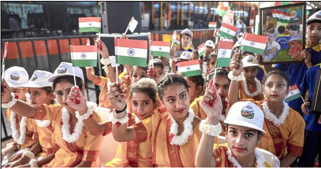
April 30, 2026 nü Jammu district nung Union Railways Minister, Ashwini Vaishnav-i Srinagar-Katra Vande Bharat train semzüksütsü lia tanurtemi linük wako amer aliba noksa nung angur.