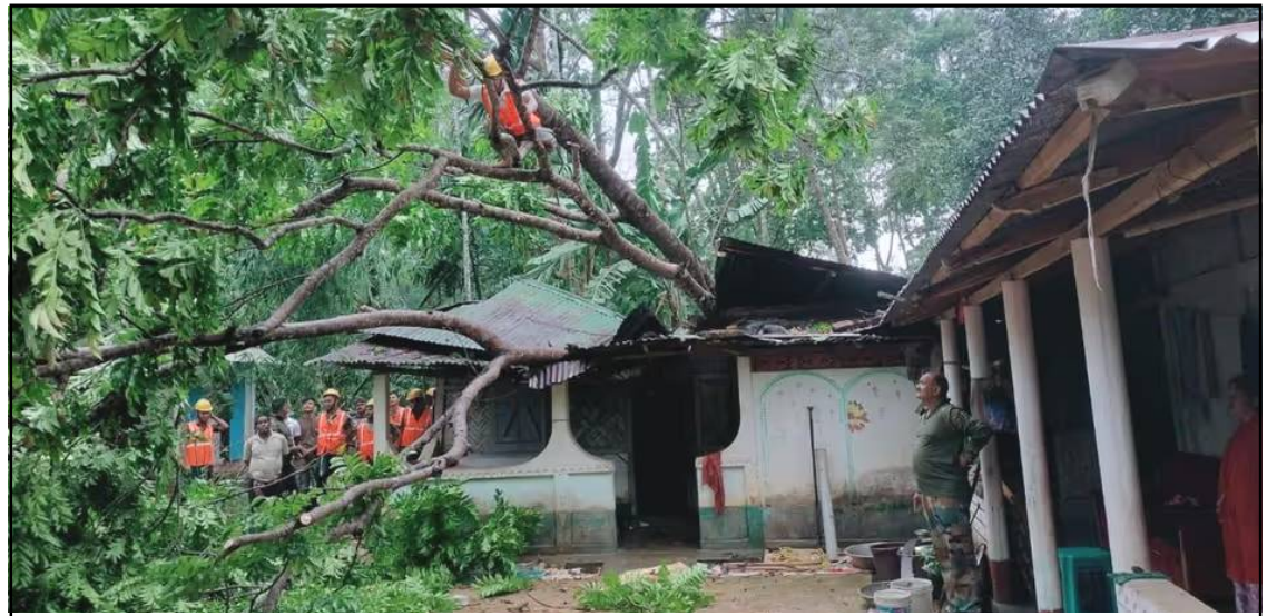
Tripura nung tzünglu aser yipru agi ki raksatsüba noksa nung angur.

Agartala, Rongchii/April 30 (Agencies): Anogo ana tashi tzünglu kanga sashia aruba den mopung tesashi ona yipru aitba sülen Tripura kübok tesem balala nung teraksatsüba tulu bener arutsüogo, aser yimdklir meyrejang aika dak kongshia parnok tang relief camp tem nung jenoka lir.