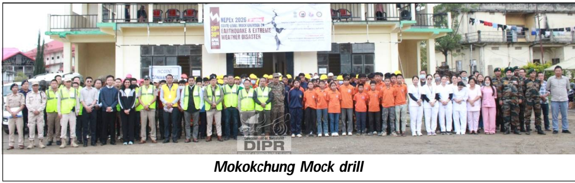
Mokokchung Mock drill

Dimapur, Rongchii/April 30 (TYO): Lendong balala atalokba mapang renema alitsü asoshi District Disaster Management Authority (DDMA) Mokokchung aser Nagaland State Disaster Management Authority (NSDMA) na longjemer April 30 nü 8buba Nagaland Emergency Preparedness Exercise (NEPEX) ayongzüka agiogo.