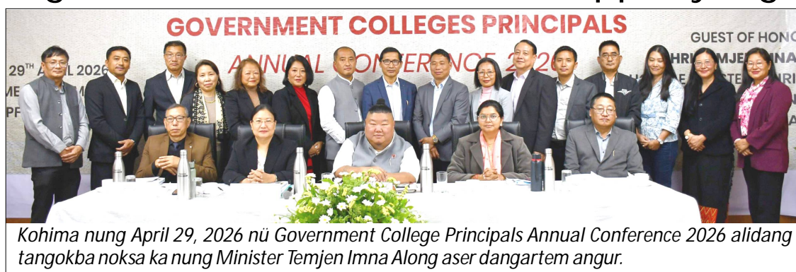
Kohima nung April 29, 2026 nü Government College Principals Annual Conference 2026 alidang tangokba noksa ka nung Minister Temjen Imna Along aser dangartem angur.

Kohima, Rongchii/April 30 (TYO): Bodhbarnü Directorate of Higher Education, Nagaland ajanga anogo ka Government College Principals Annual Conference ayongzükba nung Nagaland nung aliba Government Colleges 17 nungi Principals ajunga adenshia shilem agia liasü.