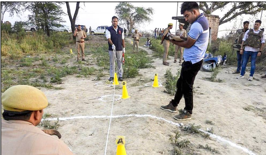
April 30, 2026 nü Uttar Pradesh kübok Bulandshahr nung nisung asem tepsetba tesem nung police-i kuli bushisüngdangba noksa nung angur.

senzürtemi iba wara proktsüa akok, ta metetdaksü. WHO-isa, Bangladesh kübok Jashore aser Chapainawabganj ama yimtitem yabo India arrtsülen lir, anungji senzüsempogertemi iba wara prokshitsüa akok, ta metetdaksü. Measles yagi tanur-tain ajak kongshir, ajisüaka talisa tanurtem kongshir. Iba wara atongba sülen anogo 10 sülen ang wara temaitsütem adoker, aser item temaitsütem rongnung neptzü ayangba, temang metaba, tenük nung tziü atzüngba aser tebang telung nung mesüng-mesünga atenba densema lir. Iba sülen anogo ishika lir tejak nungi tenzüka merem-merema küplen adoktsü aser ibaji temang ajak nung prokshir.