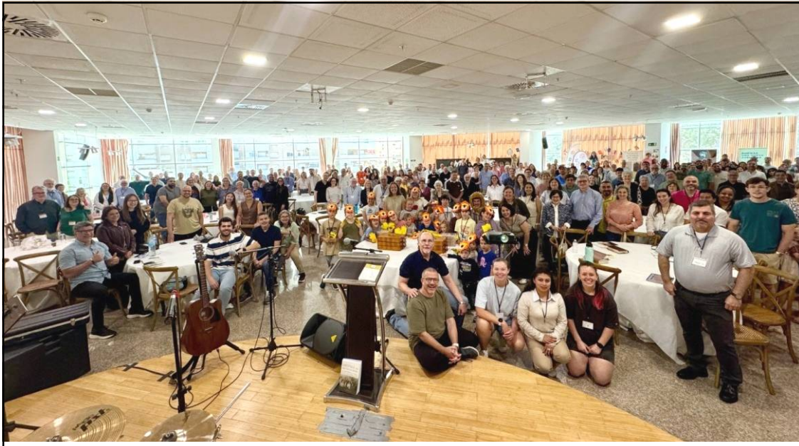
April 23-26 anogotem nung Spain kübok Cullera yimti nung Federation of Independent Evangelical Churches of Spain (FIEIDE) conference nung adener pastor tem, missionary tem aser Arogo nung lenirtem tangokba noksa nung angur.