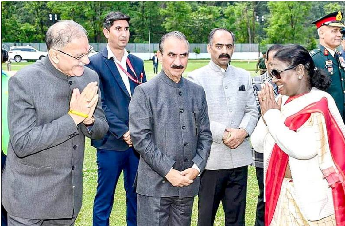
Shimla, May 01, 2026: Linük Tir, Droupadi Murmu-i Himachal Pradesh semdangba mapang state Angh Kavinder Gupta (abelen) aser Chief Minister, Sukhvinder Singh Sukhu (tiyong) nati la agizükdang tangokba noksa nung angur.