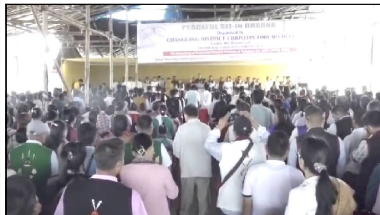
April 30, 2026 nü Changlang district nung Khristantemi longkak aйдang tangokba noksa nung angur.

May 01, 2026: April 30, 2026 nü Arunachal Pradesh nung Changlang district nung Arunachal Christian Forum kübok Changlang District Christian Forum (CDCF)-i ayongzüka Arunachal Pradesh Freedom of Religious Act (APFRA), 1978 agienang, ta takhangba agüja longkak aitogo.