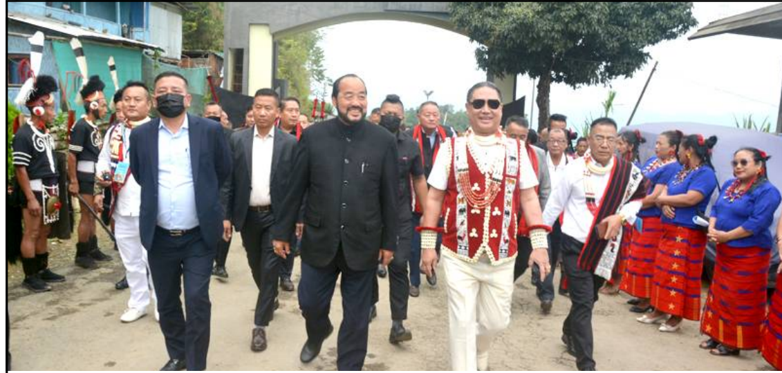
Tongti tesemdanger Nagaland Dy. Chief Minister, Y. Patton, Chuchuyimlang-i Moatsü benjong amungi arudang tangokba noksa nung angur. (Chuchuyimlang, May 1, 2026).