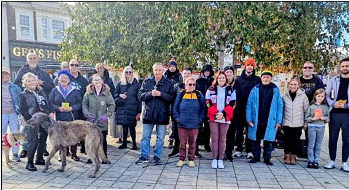
Life Community Church nungi züngsem kar noksa nung angur.

May 01, 2026: England nung ktdangsertemi yimti tiyong nung sayutsüngiba nokdangba anema May 1, 2026 nü Arogo kati temepishiba ken o ka agütsüogo.