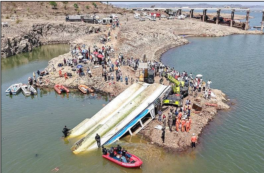
May 01, 2026 nü Jabalpur nung aliba Bargi Dam nung NDRF sepaitemi kümzükba maparen inyakba noksa nung angur. Ajungbena yipru tesashi aitba ajanga iba tesem nung rong meküpa lendong nung nisung 9 süogo.

semdangogo. Hombarnü Iranian Foreign Minister-i St. Petersburg nung Russia Tir Vladimir Putin ajuruba den külemi Russia Foreign Minister, Sergei Lavrov-a ajurua liasü. March 21 nü Ato kilonser Narendra Modi-ia Iran Tir Masoud Pezeshkian den West Asia tensa atema o lemtepa liasü. Iba mapang nungji Modi-i region nung tongtibang infrastructures amakba aitsü aser tzüym nung rong sadema senzüdaksütsüji tongtibang, ta shia liasü.