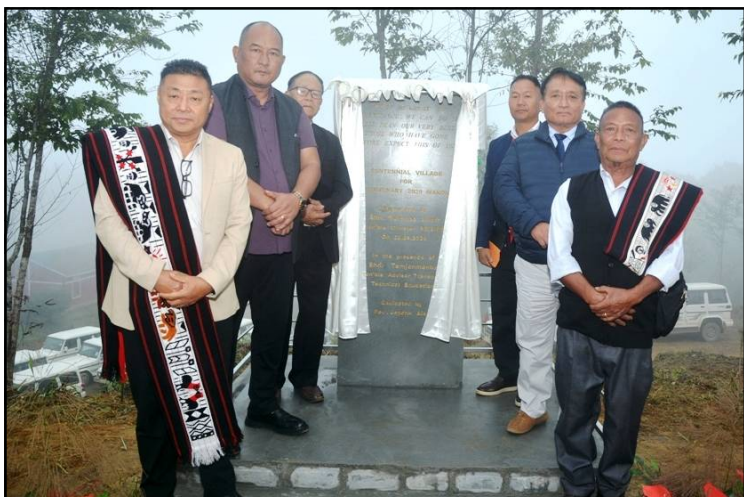
Waromung yimdak 2029 kum AKM centenary amungtsü aliba nungtem centennial yim ka yanglutsü atema Minister Metsübo Jamir-i April 30, 2029 nü longzüng ka azungtsüba mapang tangokba noksa nung angur.

Mokokchung, Monupii/May 1 (TYO): Tsürabur Nokdenlemba ya mangdang tulu abenba lenir ka liasü. Pa dak Ao kin aser Naga nung rangben bilemba shisa tajung alibaji pa mapa ajanga ajiteter, asenok pa nungi tangazüktsü aika lir, ta Nagaland RD & SIRD Minister, Metsübo Jamir-i Ao Kaketshir Mungdang Centenary koba 2029 kum Waromung nung amungtsü lir, iba dak rangloker renemshiba sentong ka 30th April, 2026 nü Waromung yimdak akadang pai mezüing AKM tir tenüing sanga metetdaksü.