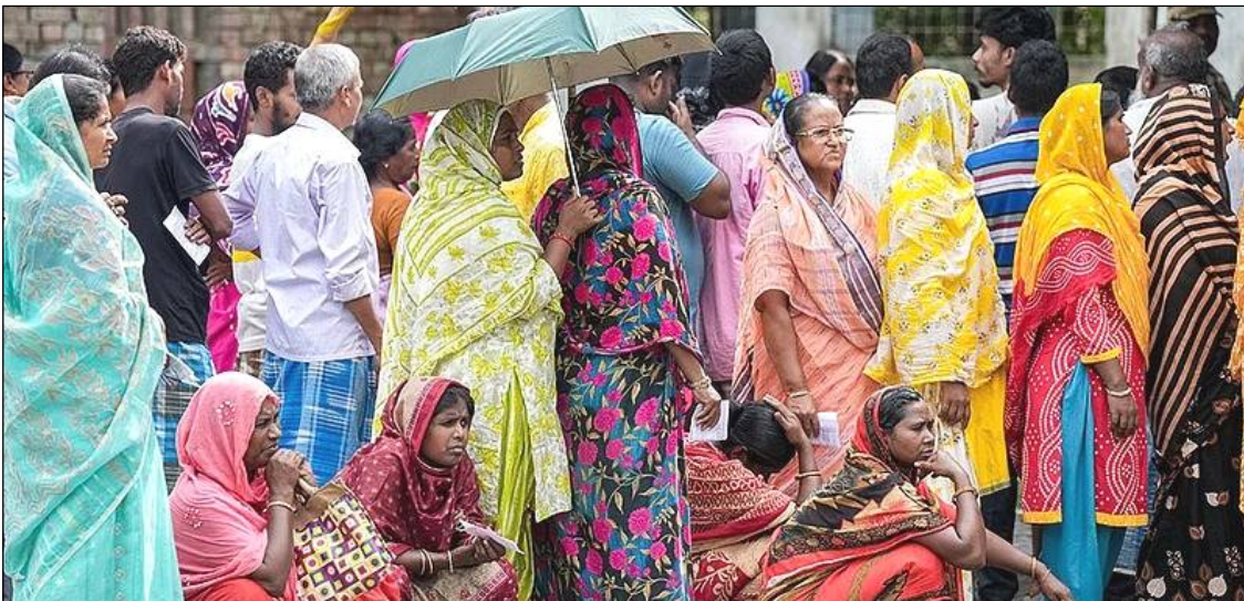
May 02, 2026 nü South 24 Parganas kübok Magrahat Paschim constituency nung aliba polling station ka nung vote agütsütsüpurtem tarensena nokdaka aliba noksa nung angur. Election Commission tetuyuba nung South 24 Parganas district nung election agishi.