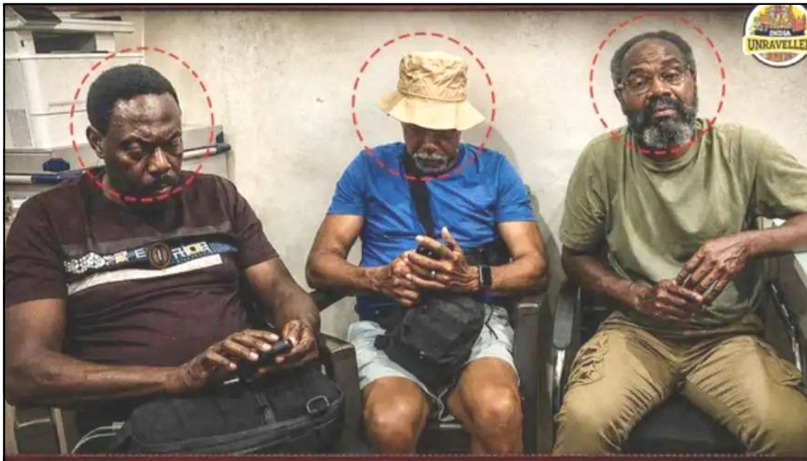
April 27, 2026 nü Pune yimti nung America nungur asem tangokba noksa nung angur. Parnoki Khristan yimsü dak sendakba kaketem lema agütsü, ta parnok aija sorkar ketdangsertemi parnok dang India toktsür oang, ta tuyu.

May 02, 2026: Maharashtra kübok Pune yimti nung America nungur asemi Khristan yimsü dak sendakba kaketem lema agütsü, ta parnok nem tai tonglokja sorkar ketdangsertemi 'parnok tourist visa telatbatem anema inyakogo' ta aija linük toktsür aotsü tuyu.