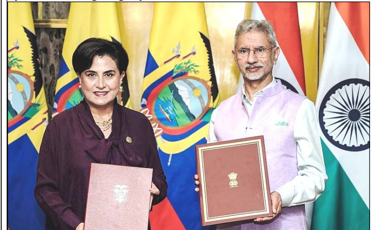
May 02, 2026 nü New Delhi nung External Affairs Minister, S Jaishankar (ajichilen) aser Ecuador Foreign Minister, Gabriela Sommerfeld Rosero na senden amenba sülen tangokba noksa nung angur.