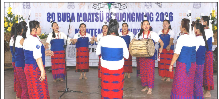
Guwahati nung May 01,2026 anogo nung Aotsür Aortem Moatsü amongba noksa kar yangi angur.