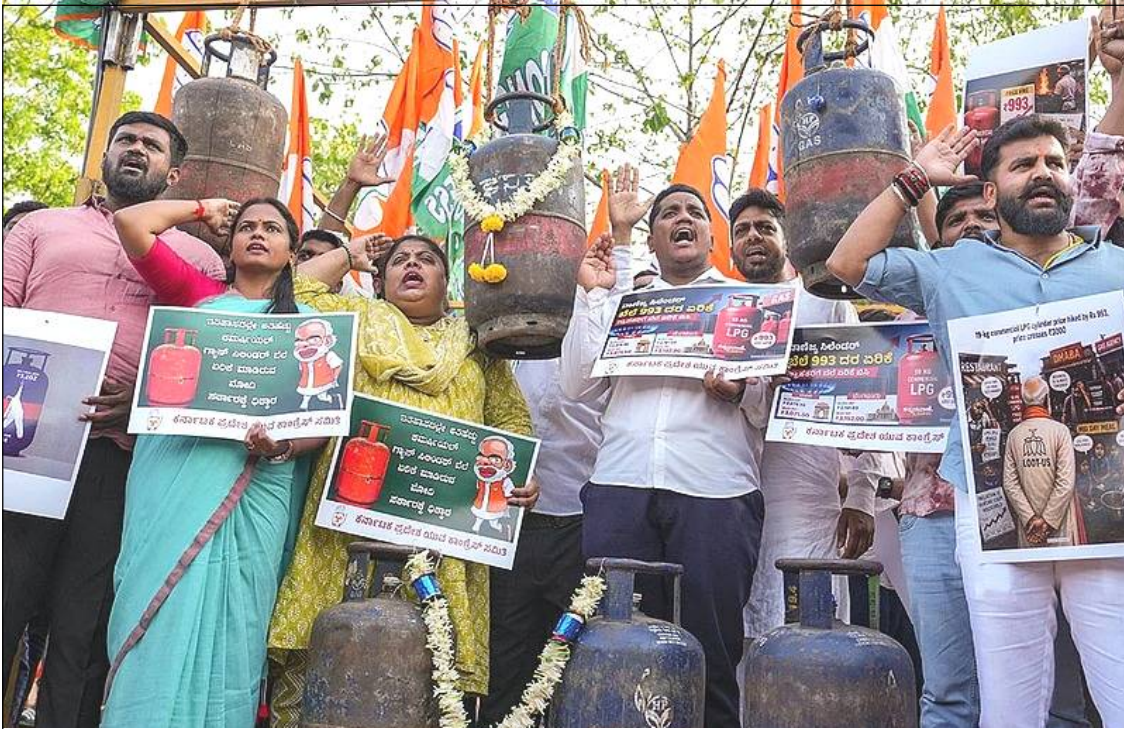
May 02, 2026 nü Bengaluru nung Youth Congress züngsemtemi commercial LPG gas cylinder jenjang atuba anema longkak aitba noksa nung angur.