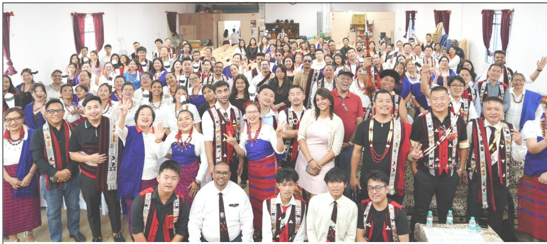
Bengaluru nung Aortem Moatsü benjongmung amungba mapang tangokba noksa angur.

Bengaluru, Monupii/May 03 (TYO): Bengaluru nung May 2, 2026 nü Aortem Moatsü benjongmung tebour junga aser telongjem nung City Revival Center, Hennur Bande nung amung.