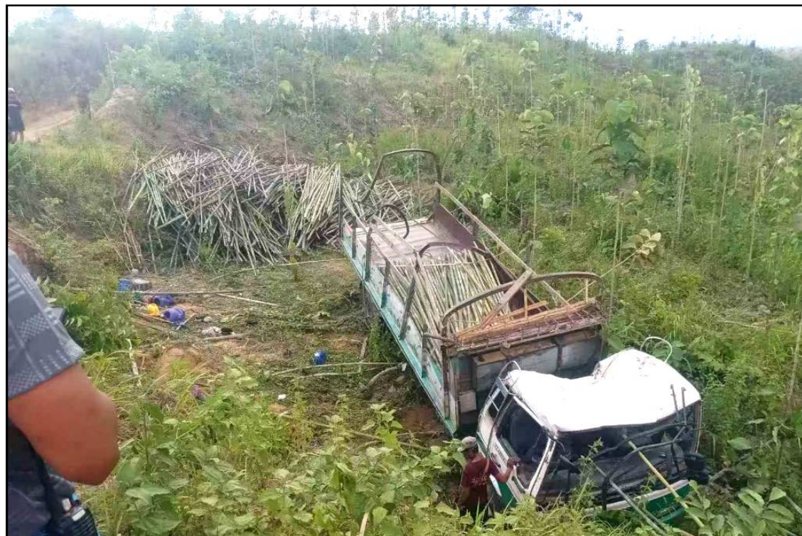
Yangon, May 3: Myanmar yimtiba Nay Pyi Taw nung gari lendong ka atalokdak tangokba noksa nung angur. Honibarnü süngkum bena aliba gari tuluka makepokba lendong nung nisung 16 asü aser 21 yiru, ta Myanmar Fire Services Department ajanga ashi.

"Iran-i dang onok dangi yokba sentong ni yakta reprangshitsü, saka tesüiba küm 47 dak tema parnoki nisung meimchir aser alima dang inyakba taa teperi magütsü yur aji agizüktsü nibo meimlar," ta Trump-i Truth Social nung ashi.