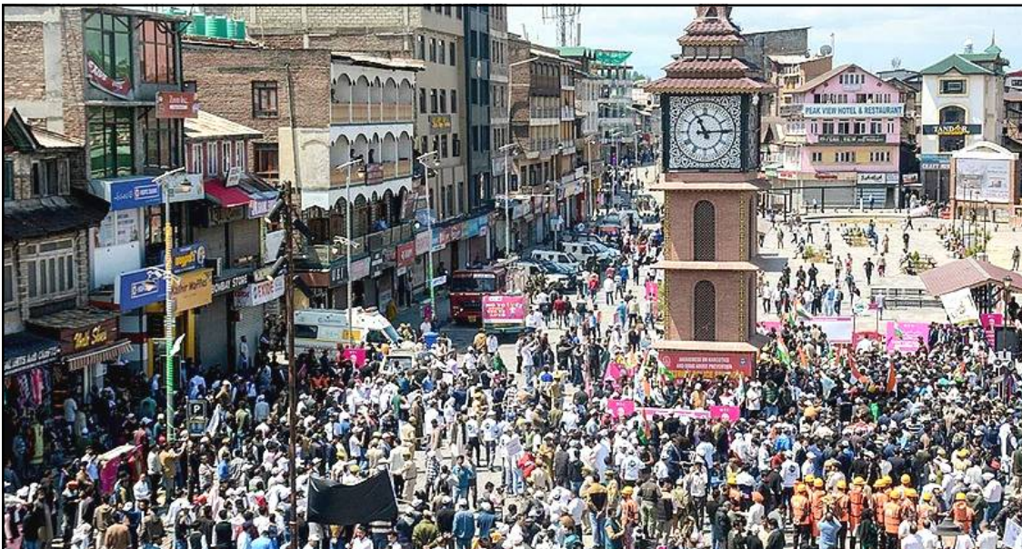
May 03, 2026 nü Srinagar nung temesepba mozü achiba ajanga temang raksatsüba awareness campaign 'Nasha Mukt Abhiyan' nung shilem agirtem noksa nung angur.

INDIA teloktep senden nungjisa lenirtemi tawa election agiba osangtem asadangtsüa akok, party tem tsüngda taliba amalitepa inyaktsü atema jembitsü aser yimtenren dak sendakba asalentong balala yanglutsü, ta kasa osang ajangasa metetdaksü.