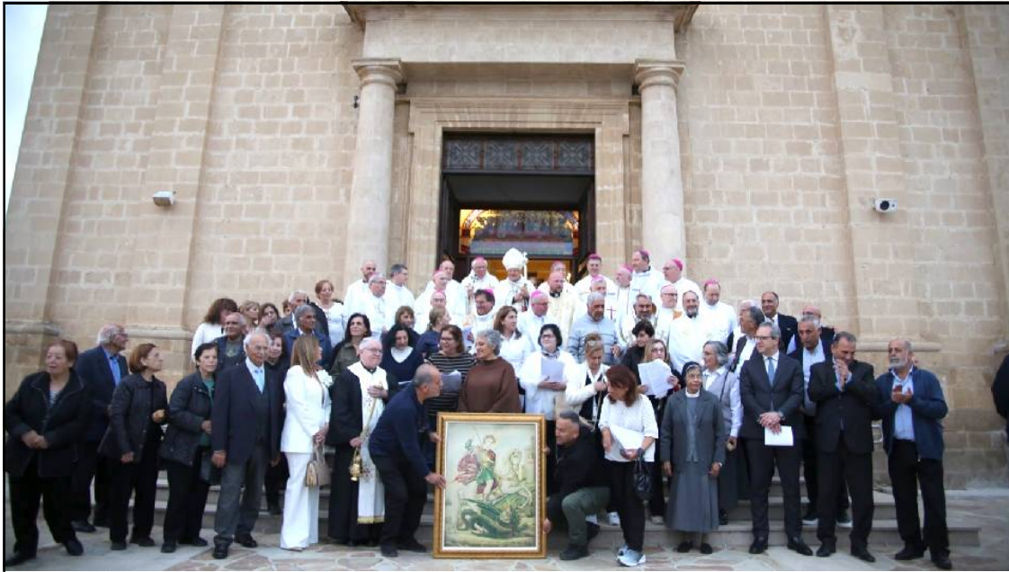
Nicosia, Cyprus nung ayongzükba Bishops' Conferences of European Union (COMECE) senden nung tangokba noksa nung angur.

May 03, 2026: European Union nung Catholic Arogo nung putirtemi alima nung lenirtem dang yimjung lenmang bushitsüla, aser alima tesem balala nung rara ajak anentsü atema inyaksüla, ta tayongzükba agütsü.