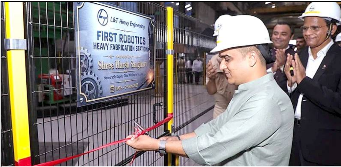
May 03, 2026 nü L&T Hazira nung Gujarat Deputy Chief Minister, Harsh Sanghavi-i Kaiga Unit 5 & 6 Nuclear Reactor Enshield semzüksüdang tangokba noksa nung angur.