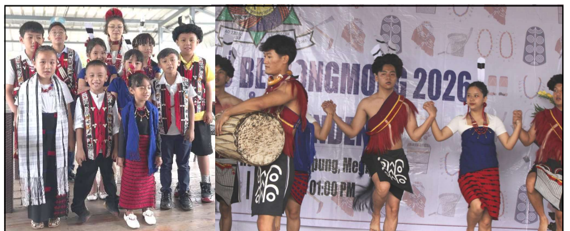
Guwahati nung May 01,2026 anogo nung Aotsür Aortem Moatsü amungba noksa kar yangi angur.

May 4, 2026 nü Assam Assembly election results sangdongba sülen taruba sorkari Longtong Sema Naga Village nung infrastructure development aser heritage conservation nung temulung agütsütsü imlar.