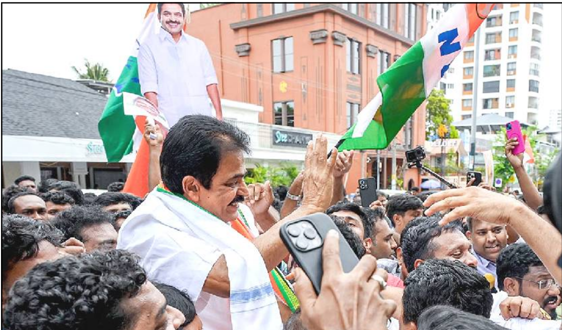
May 04, 2026 nü assembly election agiba osang sangdongba anogo nung Kerala yimtiba, Thiruvananthapuram nung Congress MP, KC Venugopal-i party nung inyakterem den benjungtepba noksa nung angur.

Ano külen opposition lenirtemia, state pezü nung assembly election tembangba sülenbo sorkari totzü jenjang atutsü, ta jembir.