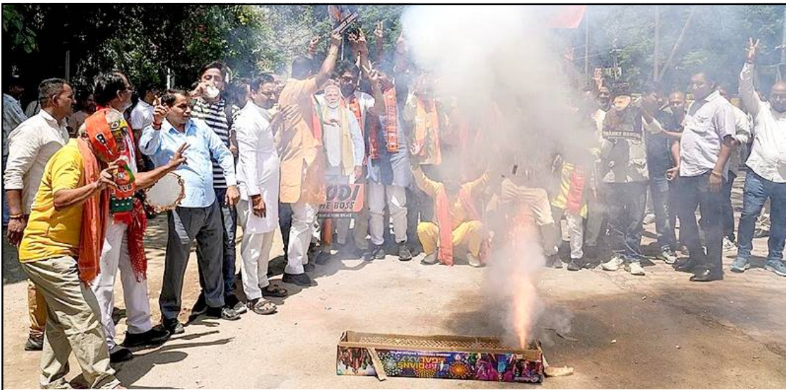
New Delhi, May 04, 2026: State pezü aser Union Territory ka nung assembly elections agiba votes zünga osang sangdongba anogo nung New Delhi nung BJP headquarters kima BJP pusemertem benjungtepba noksa nung angur.