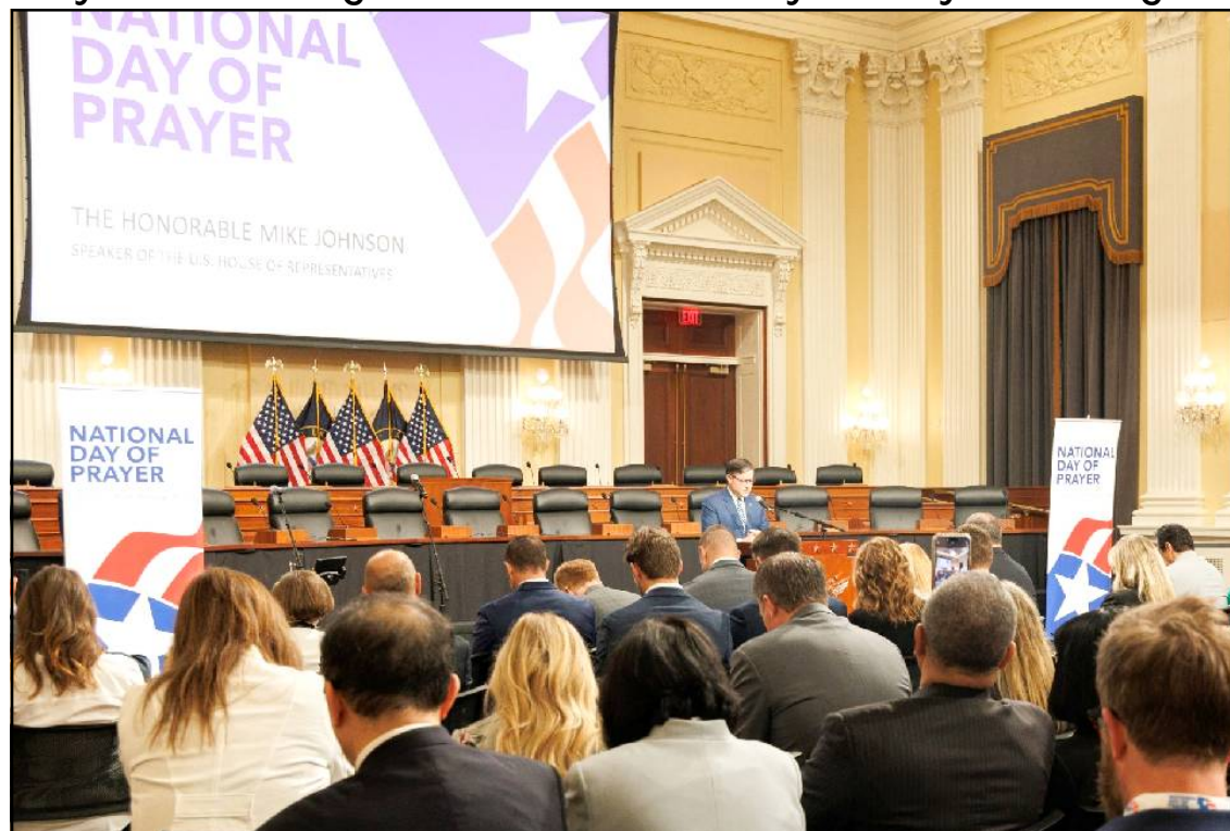
Yaküm May 1 anogo nung National Day of Prayer sentong nung tangokba noksa nung angur.

May 04, 2026: Tan hopta America nung Khristantemi 75buba National Day of Prayer amongtsü; America linük küm 250 ajungba mapang nung iba sentong agitsü.