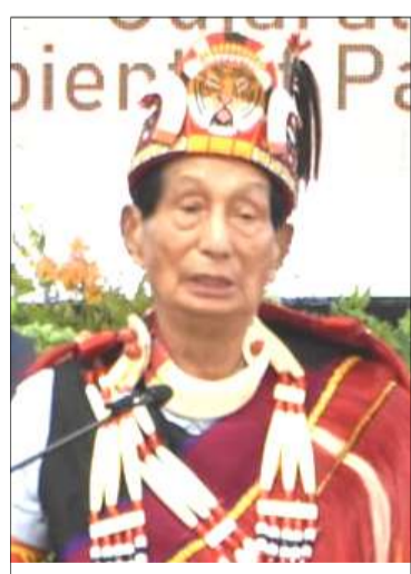
Dr. S.C Jamir

Iba aksü tenzüka mapang sorkar nung ni tokolakba aser Neiphui Rio kü den tatong liasü. Nagaland nung Ao aser Angami naji kin tulu ana lir aser kin ana tsünga tembar yimtepba kin telungjem asoshi tatishitsu ka ama bilem, aser Naga nungertemi chilongchilonga aser telungjem kibong ka asütsü yongya aser Rio küna mission ji ibaji liasü. Naga nungjeri lungjema, tepela kibong