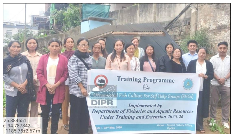
District Fishery Officer, Kiphire ajanga May 2, 2026 nü Kiphire nung Training and Extension 2026-2027 kübok ornamental fish culture training agütsüba nung shilem agir aser ketdangsurtem noksa nung angur. Iba training nung adener nisung 25 liasü.