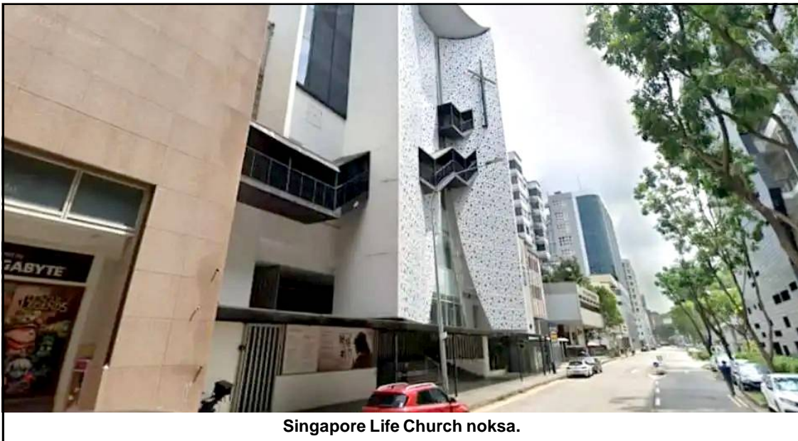
Singapore Life Church noksa.