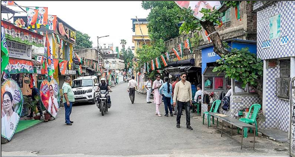
TMC tir Mamata Banerjee'er kima lenmang nokdangba agütsür aliba agintsüba sülen nüburttem sadem sadema senzü tenzükogo.