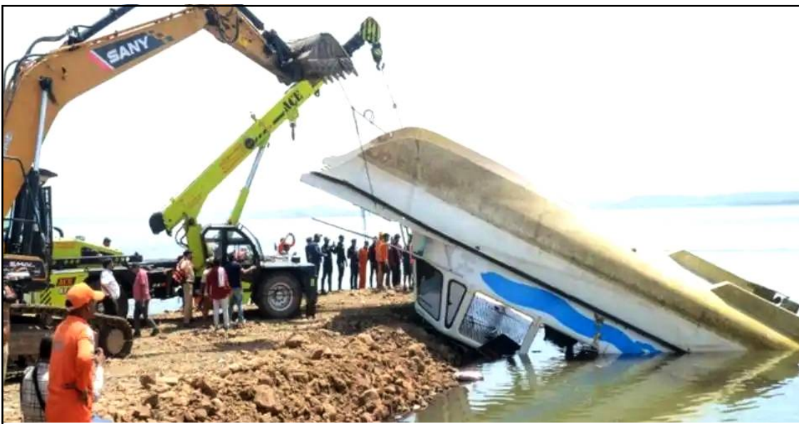
Madhya Pradesh Tourism Department meyong rong ka tzü nungi atsütetba noksa nung angur. Iba rong ya April 30 nü Jabalpur district kübok Narmada ayong nung Bargi tzü nokdang nung makepoka tetsür aser tanurtem densema nisung 13 asü.