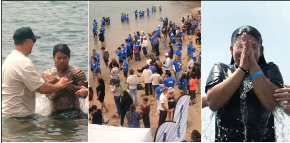
May 02, 2026 nü Corona Del nung aliba Pirate's Cove nung 'Baptize California' sentong nung nisung aika baptidang tangokba noksa nung angur.

May 05, 2026: May 02, 2026 anogo nung Corona Del, California nung aliba Pirate's Cove nung nisung meyirjang aika adenshia Baptize California sentong nung aden aser nisung noklang aikati Yisu Khrista agizüka baptiogo.