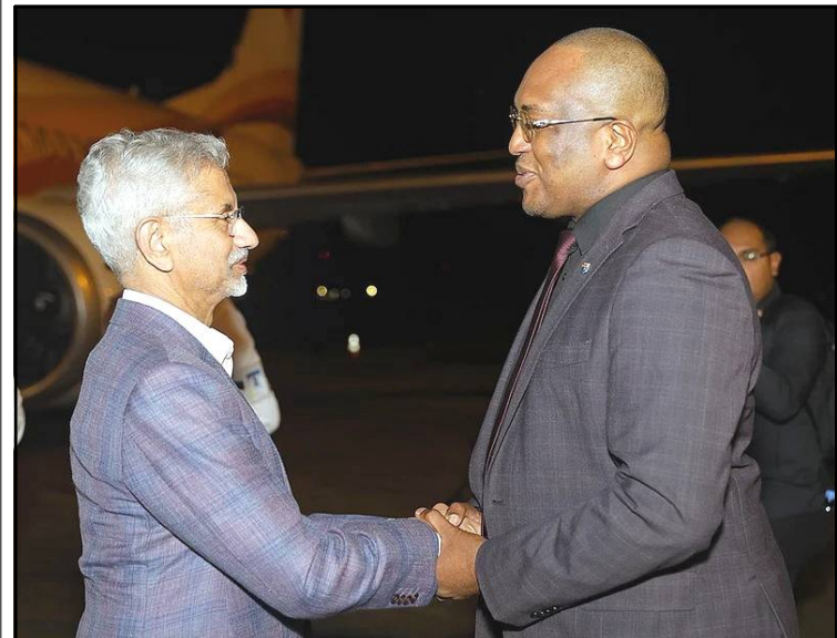
May 06, 2026 nü Paramaribo, Suriname nung Suriname Foreign Minister, Melvin Bouva-i India External Affairs Minister, S Jaishankar agizükdang tangokba noksa nung angur.

nung pai agiba shilemji paidoktsü makok. Pai pa kija tashi amshia assembly nung aser assembly adener-a chief minister Pinarayi Vijayan anema nokdaka liasü," ta metetdaksü. Ano külen Chennithala-ia pa tambuti, anungji pa nem chief minister menden agütsütsüla, ta ashir. 2021 küm assembly elections sülen pai opposition lenir menden aginüa liasü, saka Satheesan ang shimba atema pai bangdak lenirtem dang mepelai liasü. Venugopal nem CM menden magütsütsü atema Satheesan aser Chennithala na longjemer ama reprangteter, ajisüaka CM menden atema telemtetba agitsüji Rahul Gandhi dak tuluka keta lir.