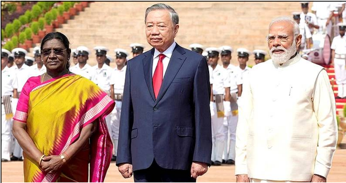
May 06, 2026 nü New Delhi nung Tir, Droupadi Murmu aser Ato kilonser Narendra Modi nati Vietnam Tir, To Lam agizükba sülen tangokba noksa nung angur.