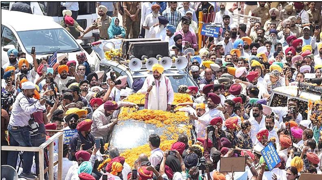
May 06, 2026 nü Rupnagar district nung Punjab Chief Minister, Bhagwant Mann-i 'Shukrana Yatra' sentong nung lokti ka den jembidang tangokba noksa nung angur.

Ground nung tenangzükba agitsü," ta metetdaksü. BJP-i tang tashi chief minister mesangdong, ajisüaka bangdak lenirtemi assembly nung Opposition lenir, Suvendu Adhikari shimtsüa akok ta aikati bilemer. Suvendu Adhikari ya mapang ka nungbo Trinamool Congress tongti, Mamata Banerjee den kanga atongtepa inyaker ka liasü, ajisüaka 2021 küm Bengal assembly election mapang nung pai TMC toktsür BJP nung aden. Tawa agiba assembly election nung Bhabanipur menden nung pai Mamata Banerjee madak votes tali 15,000 agi takok nguogo. Election atema nüboyimba mapang nung Union Home Minister Amit Shah-i, Bengal nung chief minister ji Bengali nung asütsü, ta aiben jembia aruogo. Tawa election nung BJP-i menden 207 tashi nung takok anguba ajanga Trinamool Congress sorkar atüngdokogo.