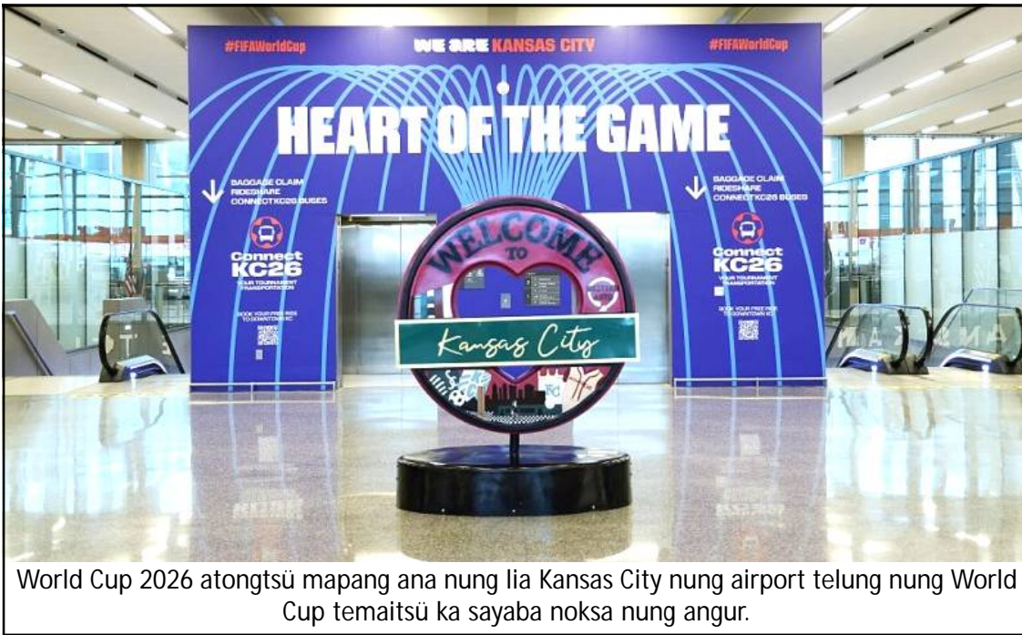
World Cup 2026 atongtsü mapang ana nung lia Kansas City nung airport telung nung World Cup temaitsü ka sayaba noksa nung angur.

Kansas City, Monupii/May 07 (Agencies): 2026 FIFA World Cup dak sendakba nung Cru-i outreach campaign ka tenzükogo; iba campaign kübok US nung 'host watch parties' ayongzüksü aser World Cup asaya reprangba mapang nung Khristan yimsü dak sendakba nung sensaksemsü atema Khristan 100,000 aser Arogo 10,000 nem training agütsütsü.