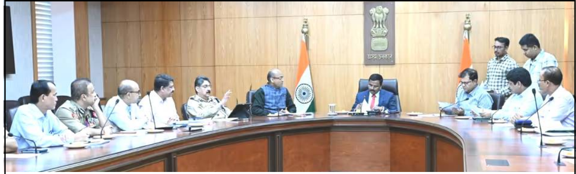
Assam Chief Secretary-i sorkar tenang-züktepba agitsü atema renemshiba asadang sentong nung tangokba noksa angur.