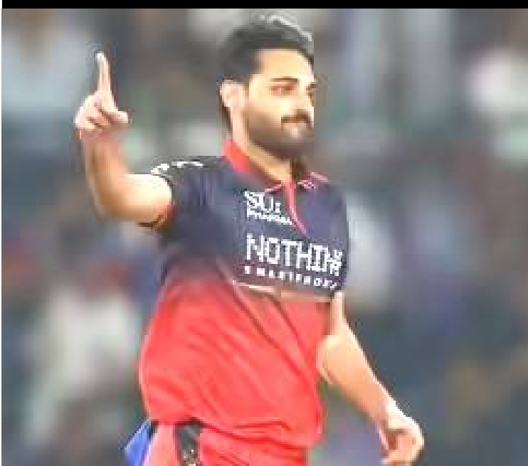
Bhuvneshwar Kumar-i alizüing tasen ka tongteta pa ya Indian Premier League nung asaya 200 asayaba mezüngbuba fast bowler kümogo.