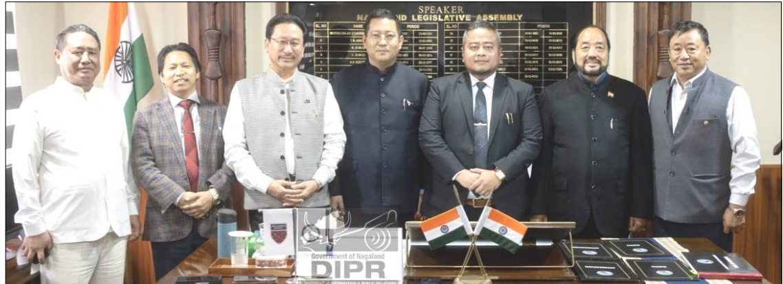
14th Nagaland Legislative Assembly nung züngsem ka ama May 7, 2026 nü Doachier I. Imchen tenangzüktep agiba mapang tangokba noksa nung Speaker, NLA, Sharingain Longkumer den Dy. CM Y. Patton aser dangartem angur.

Dimapur, Monupii/May 07 (TYO): 14th Nagaland Legislative Assembly nung züngsem ka ama Doachier I. Imchen den tenangzüktep sentong ka Speaker's Chamber, Nagaland Legislative Assembly,