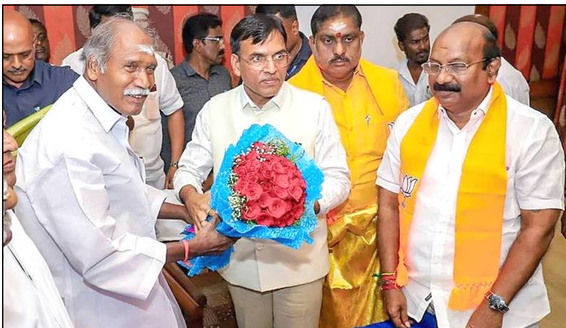
May 08, 2026 nü Puducherry nung Chief Minister N Rangaswamy-i Union Minister, Mansukh Mandviya (tiyong) agizükdang tangokba noksa nung angur.

Tamil Nadu nung NOTA votes shilem 0.4 dang liasü, Assam nung NOTA votes shilem 1.23 liasü, West Bengal nung NOTA votes shilem 0.78 liasü, Kerala nung NOTA votes shilem 0.57 aser Puducherry nung NOTA votes shilem 0.77 liasü.