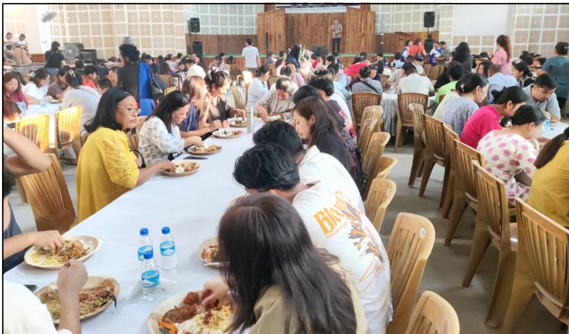
Dimapur Govt College Auditorium nung May 08 nü Dimapur Langpangkong Watsü Telungjemi Tetsütem Anogo nungtem nung ayongzükba lokti chiyong sentong nung nisungtem chiyongtepba noksa nung angur. Iba sentong nung aruba sen agi Langpangkongtsürtemi nübortem asoshi mapa tajung inyaksü tebilemba lir ta DLWT lenirtemi metetdaksü. Tanü iba sentong nung nisung meyirijang pezü dak tali arua chiyonga liasü.