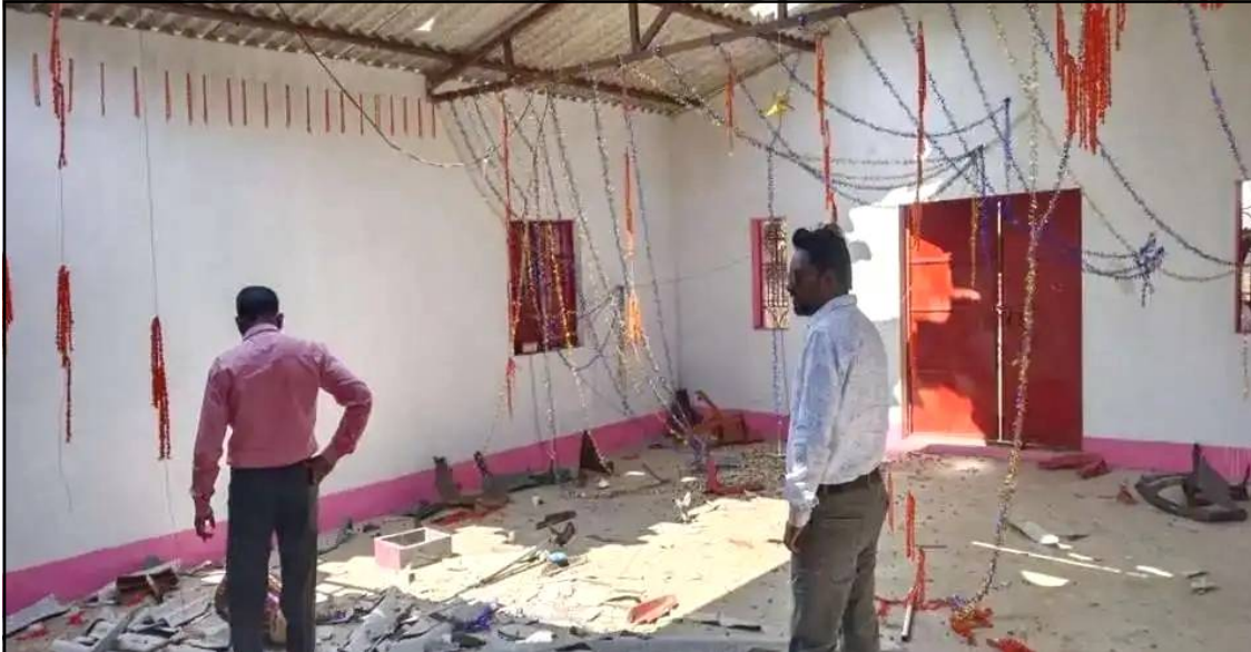
Taküm March 3 nü Odisha nung raksatsüba Pentecost Arogo Tenla ki ka Khristan temeden atema inyakertemi semdangba mapang tangokba noksa nung angur.

May 08, 2026: Odisha state nung mapang shia Khristantem anema inyaker aser asalentong yanglur Khristantem bendangshidanga züngshir, ta meimchir temeden atema inyakertem aser journalist temi tentetba team kati metetdaksü.