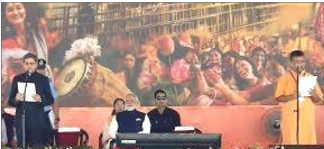
May 09, 2026 nü Kolkata nung aliba Brigade Parade Grounds nung West Bengal Angh, R. N Ravi-i ketdangsüa Suwendu Adhikari nem Chief Minister tenangzükba agidaksüdüng tangokba noksa nung angur.

Kolkata, Monupii/May 09 (Agencies): Honibarnü Suwendu Adhikari-i West Bengal nung Chief Minister tenangzükba agiogo; Bengal nung BJP nungi mezüing chief minister ji pa asütsü.