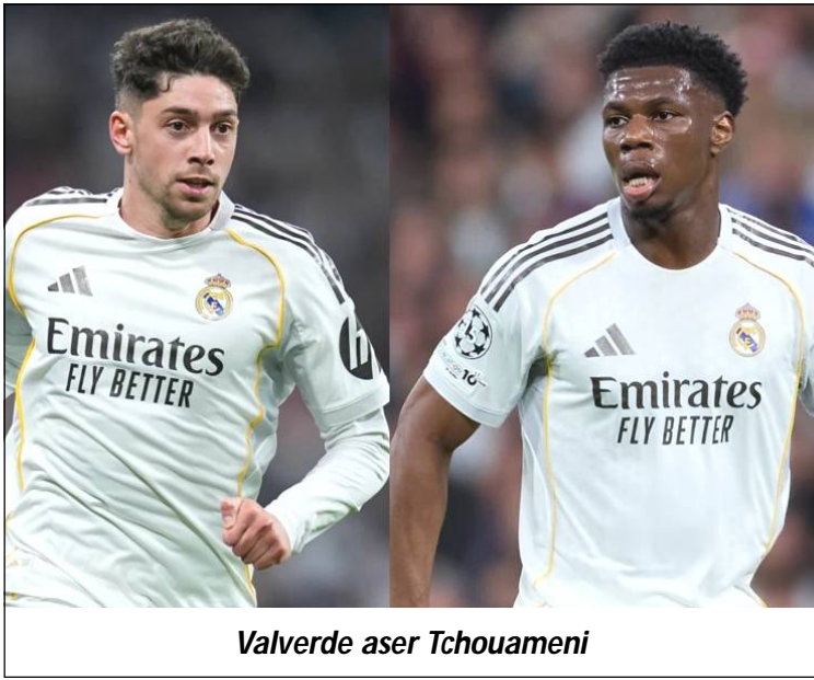
Valverde aser Tchouameni

Monupii/May 9, 2026 (Agencies): Training ground nung mangatettep adoka Valverde mozüki anir aotsüsa akümbe sülen Real Madrid-i club nungi asayar Aurelien Tchouameni aser Federico Valverde na dang senchi euro 500,000 chiogo.