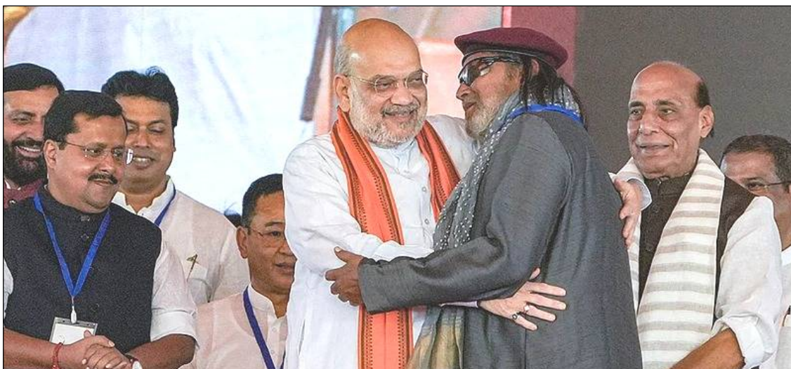
May 09, 2026 nü Kolkata nung BJP sorkar tenangzükba agiba sentong nung Union Minister, Amit Shah-i taoba mapang actor aser BJP lenir, Mithun Chakraborty ajurua jembidang tangokba noksa nung angur. Kasa noksa nung Defence Minister Rajnath Singh aser BJP National Tir, Nitin Nabin nata angur.