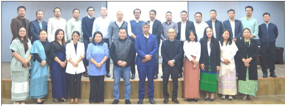
NSS Officers tem Mid - Career Training agiba mapang tangokba noksa angur.