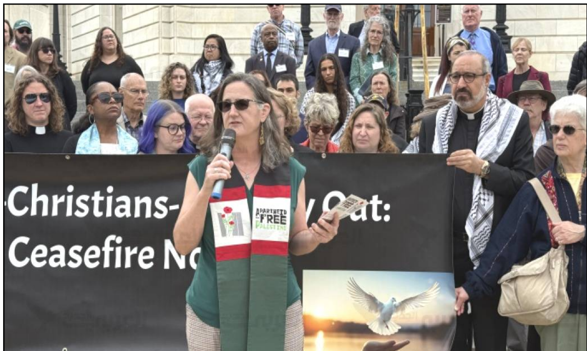
May 07, 2026 nü Khristan organisations balala nungi lenirtem Washington D C nung aliba Capitol Hill nung adenshia joko Israel meyaritsü atema takhangba agütsüdang tangokba noksa nung angur.

May 09, 2026: US nung Khristan lenir 300 dak temai US Congress dang Israel yariba anenang aser Gaza nung timtemertem nem teyari agütsütsü atema melaang, ta takhangba agütsü.