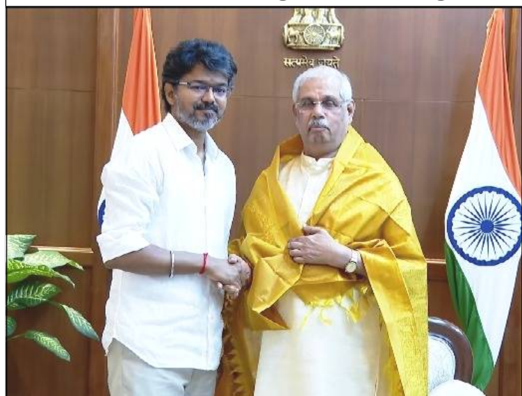
May 09, 2026 nü Chennai nung TVK tongti lenir, Vijay-i Tamil Nadu Angh, RV Arlekar ajurudang tangokba noksa nung angur.

Chennai, May 09 (Agencies): Honibarnüa TVK tongti lenir Vijay-i Tamil Nadu Angh, RV Arlekar ajuruogo; tetsüiba anogo ishika tsüingda Vijay-i tang agi pezübenbuba Angh ajuru.