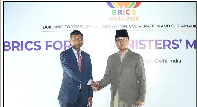
May 13, 2026 nü Indonesia Minister for Foreign Affairs, Sugiono (ajichi) BRICS Foreign Minister tem senden nung adentsü atema New Delhi tonga aruba sülen India nunger ketdangser kati pa agizükdang tangokba noksa nung angur.

May 3 nü iba tatidang agi, saka iba taitdang tamagila kümdaktüsü sülen candidate tem kanga jashia longkak aitar.