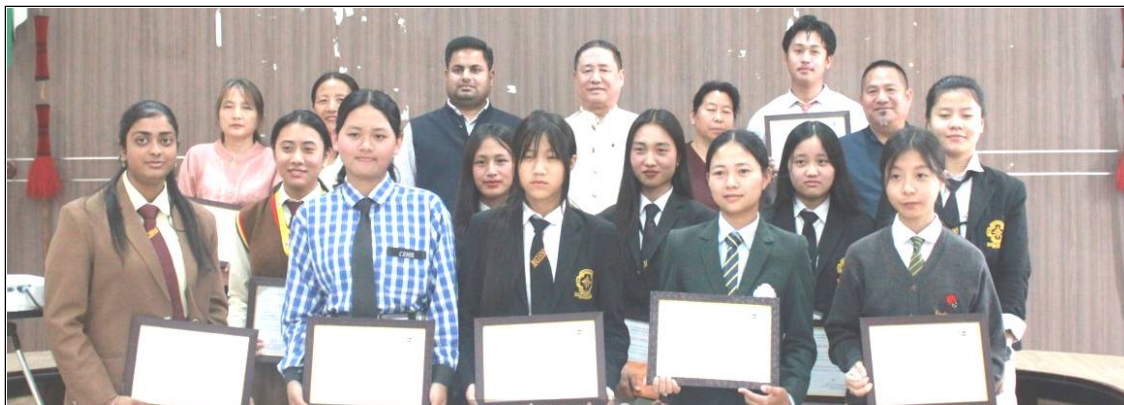
Mokokchung district nungi class 10 & 12 tatidang nung alakteta takok angurtem nem Mokokchung DPDB-i tetushi agütsüba sentong ka Mokokchung DC conference hall nung ayongzük akadang tangokba noksa nung angur. Mokokchung, 13th May, 2026

Iba den külemi Mokokchung district kübok town council balala nung temerükta ward-tem shima senpettsü. Mokokchung Municipal Council kübok temerükta ward-ji Alempang, tanabubaji Salangtem aser tasembubaji Kichutip liasü. Changtongya Town Council kübok mezüingbuba jenjangji PWD ward aser tanabubaji Church ward liasü. Tuli Town Council kübok Longpong ward-