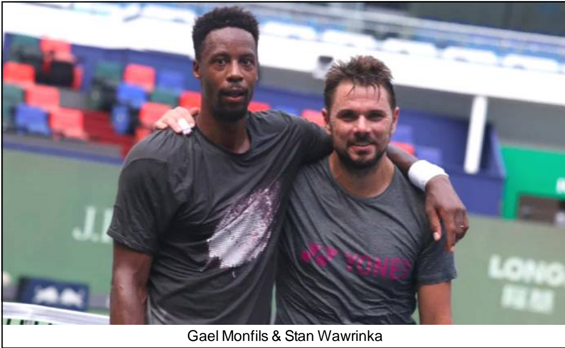
Gael Monfils & Stan Wawrinka

Monupii/May 13, 2026 (Agencies): Stan Wawrinka aser Gael Monfils na taküm tatabangbuba French Open nung asayatsü jangjaogo.