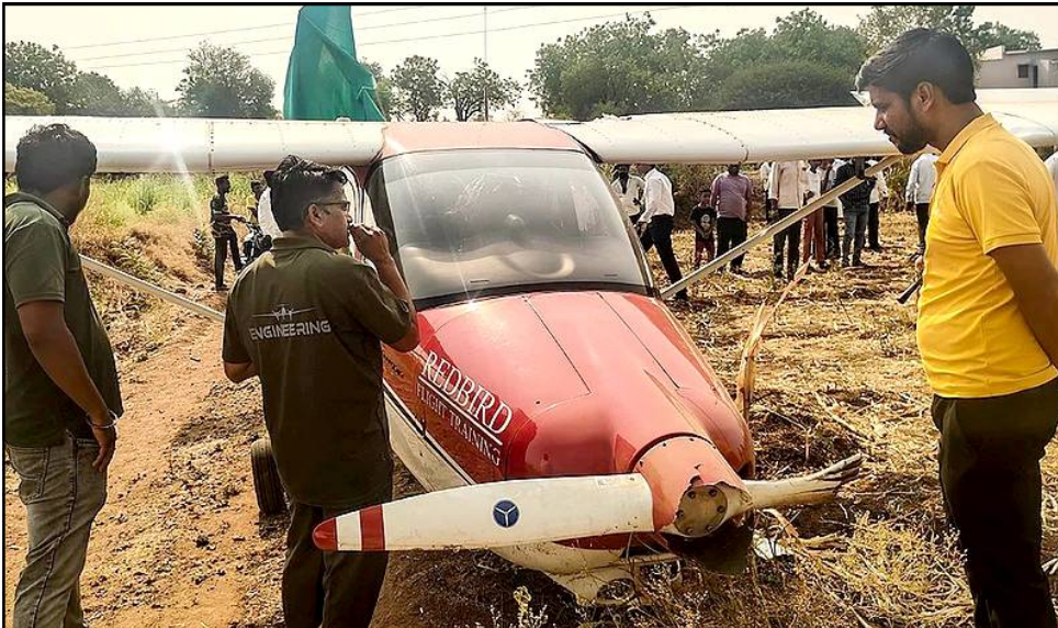
May 13, 2026 nü Pune district kübok Baramati nung nija company ka indang training agiba tayimtsü tilaka tsükokba sülen tangokba noksa nung angur.