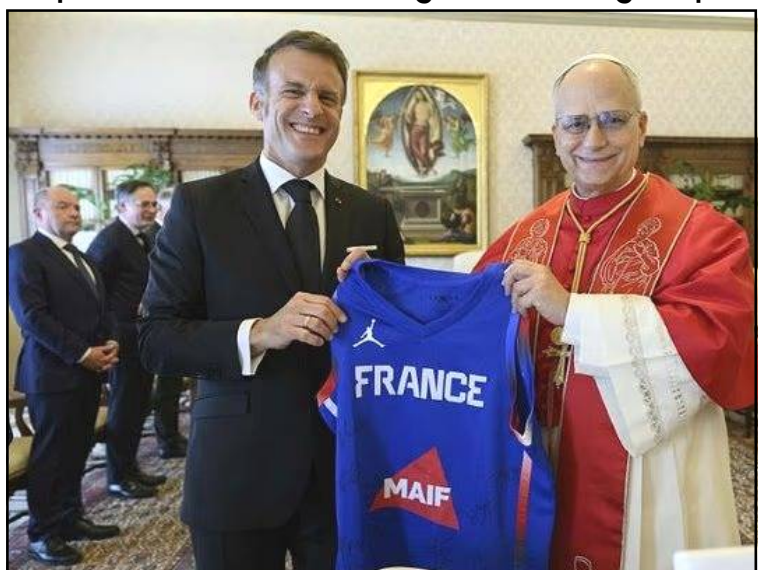
April ita nung France Tir, Emmanuel Macron-i Vatican semdangba mapang Pope Leo ajurudang tangokba noksa nung angur.

May 16, 2026: Taküm September 25-28 anogotem nung Pope Leo XIV-i France semdangtsü, aser ibaji tesüiba küm 18 tsüngda tang mezüng Pope kati official süa France semdang asütsü, ta Honibarnü Vatican-i sangdong ka ajanga metetdaksü.