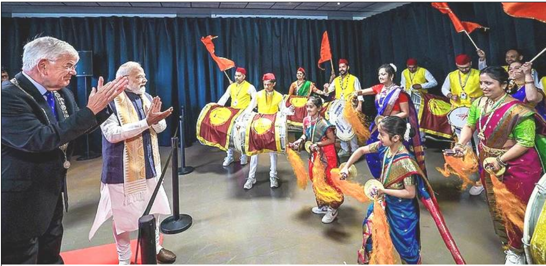
May 16, 2026 nü Hague, Netherlands nung Ato kilonser, Narendra Modi-i India nunger telok kati shilem agiba reprangdang tangokba noksa nung angur.