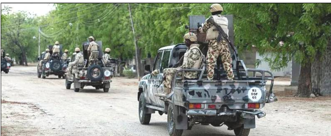
Nigeria aser United States na longjemer meita aoba mapang Islamic State (IS) lenir Abu-Bilal al-Minuki tepsetogo. US tir Donald Trump-i ashiba agi, Minuki ya alima ajunga nung ISIS indang second in command aser alima nung kiralongrartem rongnung kanga yakyaka inyaker ka liasü. Nigeria tir Bola Tinubu-i, linük ana senteper iba meita aoba sentong benoka inyakba sülen IS pur akoksadaksüogo, ta ashi.

Linük ana ya military allies bo masü saka yimden yimsüsüba aser rongsenketzüng nungbo kanga junga sendaktepa lir, aser anüolen aliba linüktemi Russia den tesendaktep meyui akümba mapang China-i jenjang talila agishia Russia indang totzü aser osettsütem alia arudar.