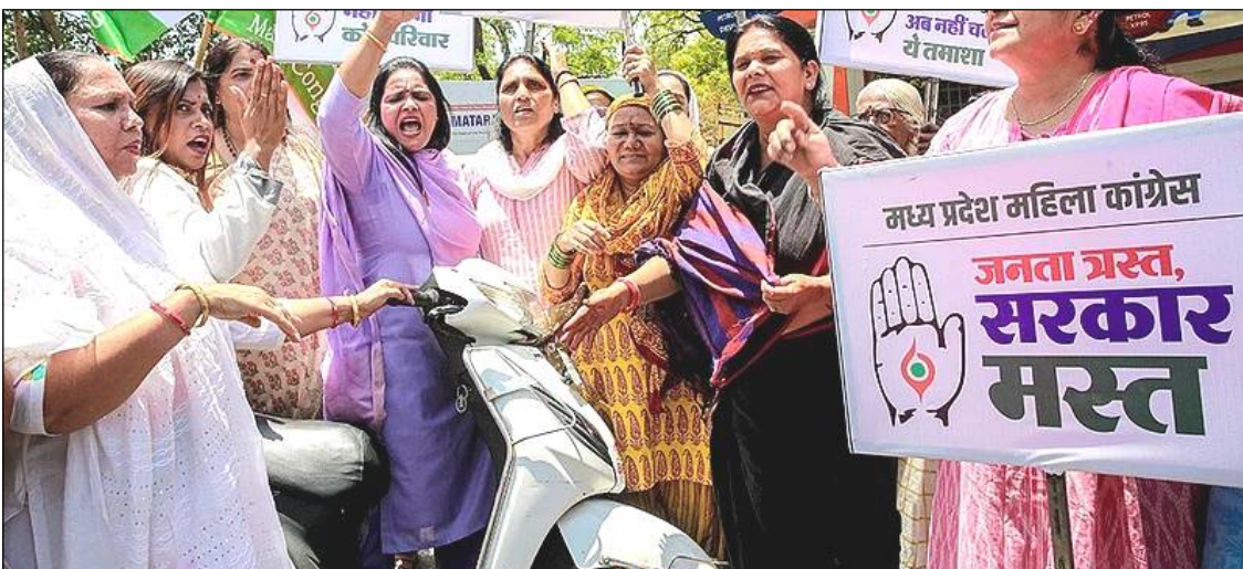
Bhopal, May 16, 2026: Petrol aser diesel totzü jenjang atuba anema Honibarnü Bhopal nung Madhya Pradesh Mahila Congress Tir, Reena Borasi Setia leniba nung party nung inyakertemi longkak aitba noksa nung angur.

April 11 nü LG Manoj Sinha-i temesepba mozü anema anogo 100 mita aotsü sangdongba sülen lokti tentet aikati yi-a nokdangtsü atema takhangba agütsür.