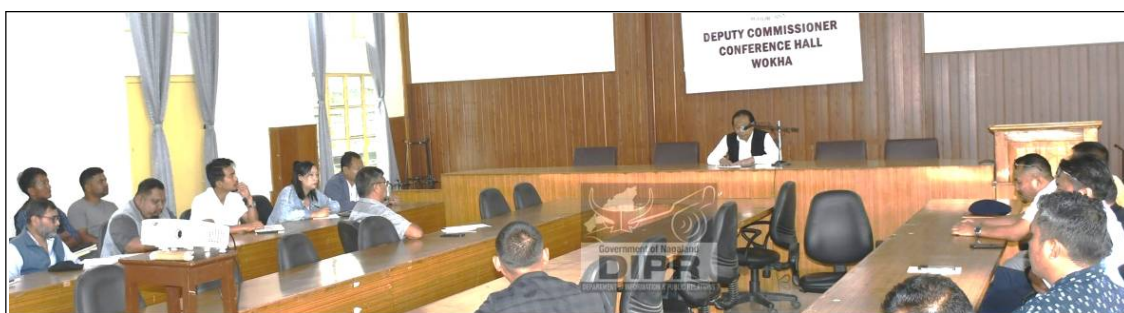
DDMA Wokha meyiwa asoshi renemshia senden amenba noksa nung angur.

Dimapur, Monupii/May 19 (TYO): District Disaster Management Authority (DDMA), Wokha meyiwa asoshi terenemshiba senden ka Deputy Commissioner, Wokha indang Conference Hall nung May 19, 2026 nü mena liasü.