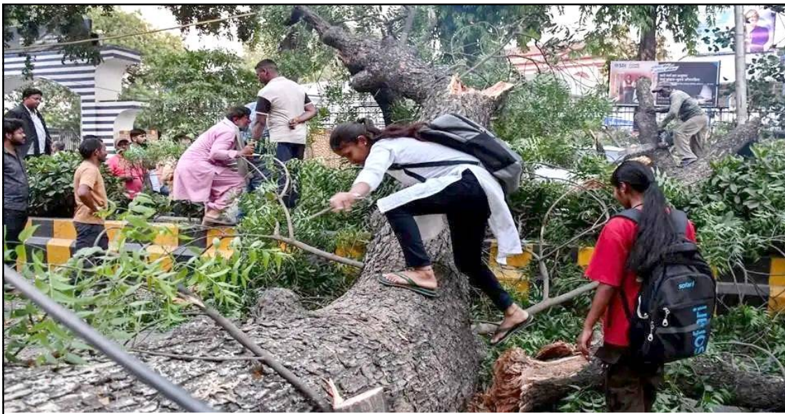
Prayagraj nung May 13 nü yipru tesashi süyiba sülen süngdong tera makepa laor aliba ketdangsür temi mürekba ajanga nisung senzüba noksa nung angur. Iba yipru tesashi yagi Uttar Pradesh nung kanga mejungi kongshia nisung 111 asü ta sorkar ketdangsür temi ashir.

Lucknow, Monupii/May 19 (Agencies): Tawa Uttar Pradesh nung yimpru mopung tesashi den rer tsüka tsüngi aiba ajanga nisung 111 dak tema takum samatsür ano nisung 200 dak tema yirutsüba sülen Catholic arogo ka aser India nung Catholic bishops tem indang social service arm, Caritas India ajanga teyari agütsütsü renemba mapang lir.