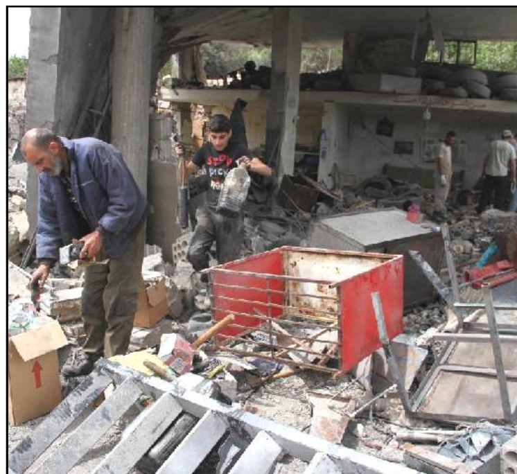
Israel-i May 19, 2026 nü Lebanon south tsütsü Nabateih yimti nung tayimtsü amshia amakdang raksatsür aliba ki ka nung nisungtemi tanaben amshitetsüba osettem bushiba noksa nung angur. Israel aser Lebanon na ceasefire hopta asem atsülangtsü April 23 nü mulungtep aser ano Hokulbarnü anogo 45 atema ceasefire atsülangtsü mulungtepogo.

Ozüng alema inyaksanshiba teloktemi nisung puer aoba ya küm tem tsünga Nigeria atema security dak sendakba nung tetsükdaktsü ka kümogo. Item teloktem yagi sen atema sen z ü s e n p o n g e r t e m , kaketshirtem aser yimdak yimtsüng nung alirtem pua bener aoer. Parnoki school tem dak rangloker inyaker, saka linük southwest lenbo iba ya kanga buluabo mataloker.