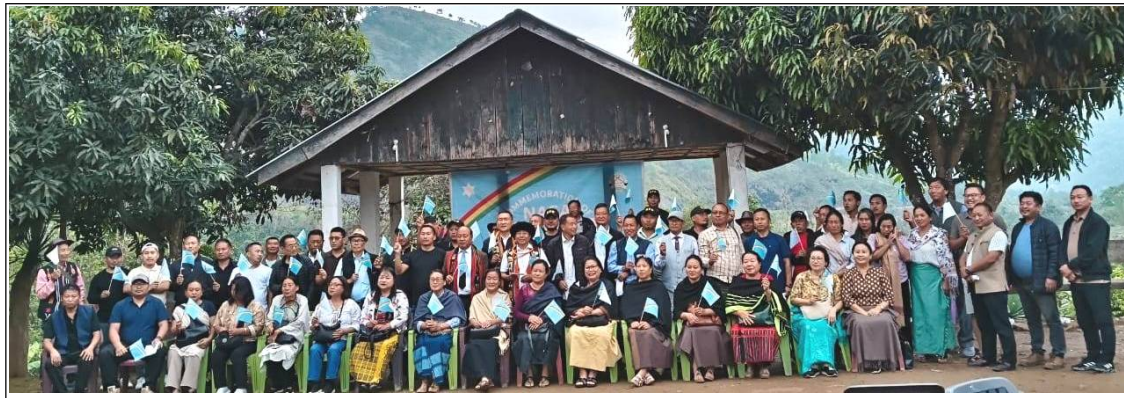
Tenyimi Union Nagaland-i May 16, 2026 nü Shilloi Lake nung Naga Plebiscite Day bilemteta amungdang tangokba noksa ka yangi angur.

Kohima, Monupii/May 19 (TYO): Tenyimi Union Nagaland (TUN) executive council aser frontal organizations lungjemer May 15, 2026 nü Meluri district kübok Shilloi Lake nung Naga Plebiscite Day munga liasü.