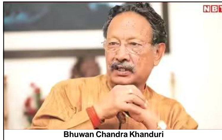
Bhuwan Chandra Khanduri

New Delhi, Monupii/May 19 (Agencies): Taoba Uttarakhand chief minister aser Union minister Bhuwan Chandra Khanduri, Mongolbarnü arishi küm 91buba nung süogo.