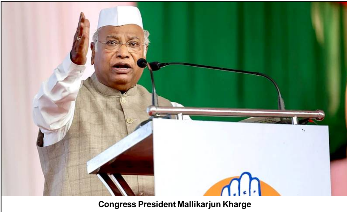
Congress President Mallikarjun Kharge

New Delhi, Monupii/MAY 19 (Agencies): Petrol aser diesel jenjang liter nung paise 90 shi ajungketba sülen Congress-i manenei Ato Kilonser Narendra Modi-i aniba Centre sorkar aitsüogo. Hopta ka majung tsüingda tang agi tanabenbuba totzü nung jenjang ajungketogo.