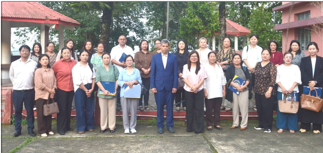
ATI-i government school tesayur atema training ayongzük agiba sentong nung tangokba noksa angur. (Kohima, May 23, 2026)

Dimapur, Monupii/May 23 (TYO): Administrative Training Institute (ATI), Government of Nagaland, Kohima ajanga Kohima District nung aliba Government school tesayurtem asoshi anogo ana "Awareness on Child Mental Health" training sentong May 21-22, 2026 anogotem ATI, Kohima nung ayongzükä liasü.