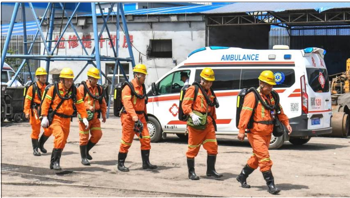
China indang Shanxi Province kübok Tongzhou Group-i inyakba Liushenyu Coal Mine nung lendong atalokba sülen rescue workers tem ambulance ka ajanga aoba noksa nung angur.