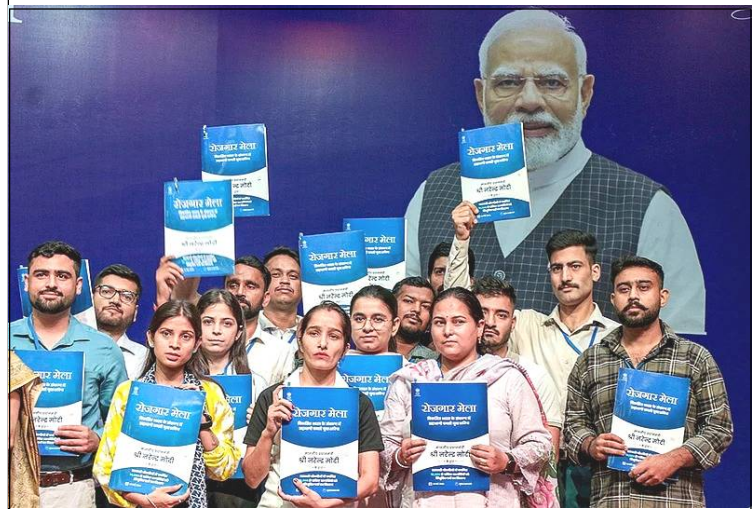
May 23, 2026 nü Jammu yimti nung 19buba Rozgar Mela kübok sorkar department balala nung mapa angurtemi 'appointment letters' amer tangokba noksa nung angur.

New Delhi, May 23 (Agencies): May 23 anogo nung 19buba Rozgar Mela kübok Ato kilonser Narendra Modi-i nisung 51,000 mapa nung shimba 'appointment letters' agütsüogo.