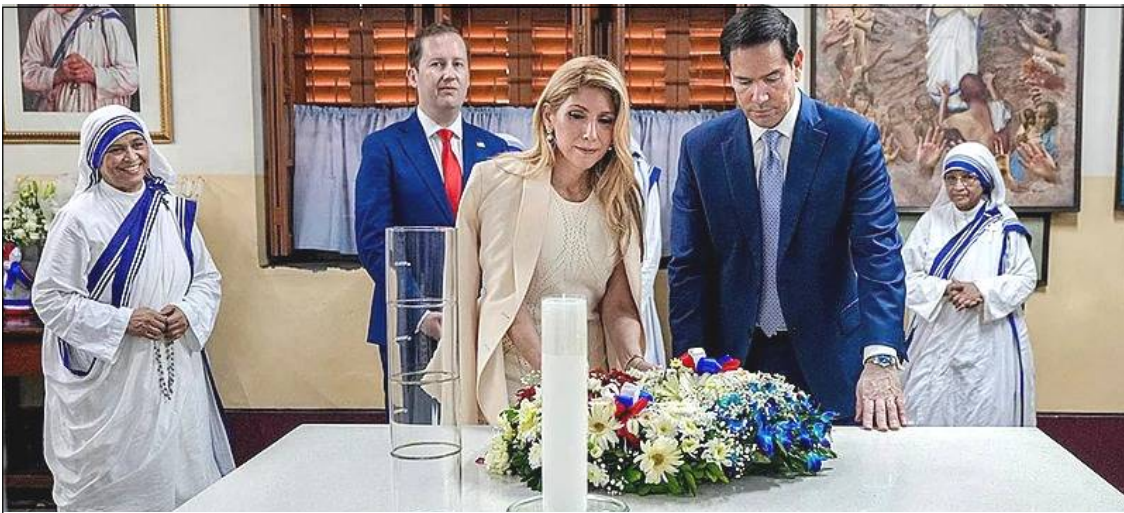
Kolkata, May 23, 2026: Honibarnü US Ambassador to India, Sergio Gor aser US Secretary of State, Marco Rubio nati Kolkata nung Missionaries of Charity indang headquarters, Mother House semdangba mapang tangokba noksa nung angur.