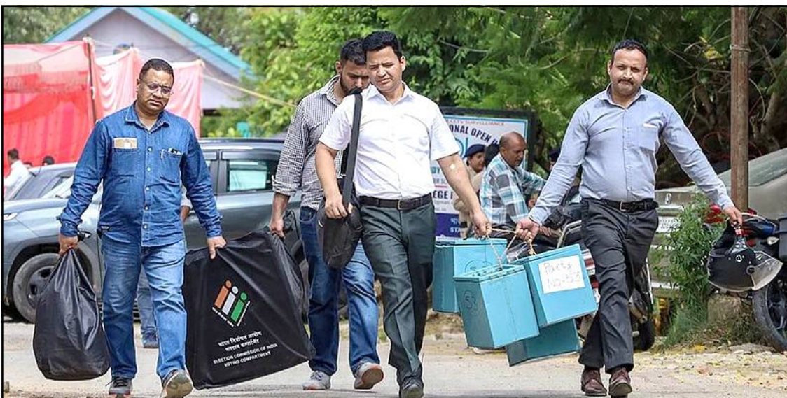
Dharamsala, May 24, 2026: Local body elections agitsü anogo ka jakdang Dharamsala nung election ketdangsertem polling stations-i apusoa aodang tangokba noksa nung angur.