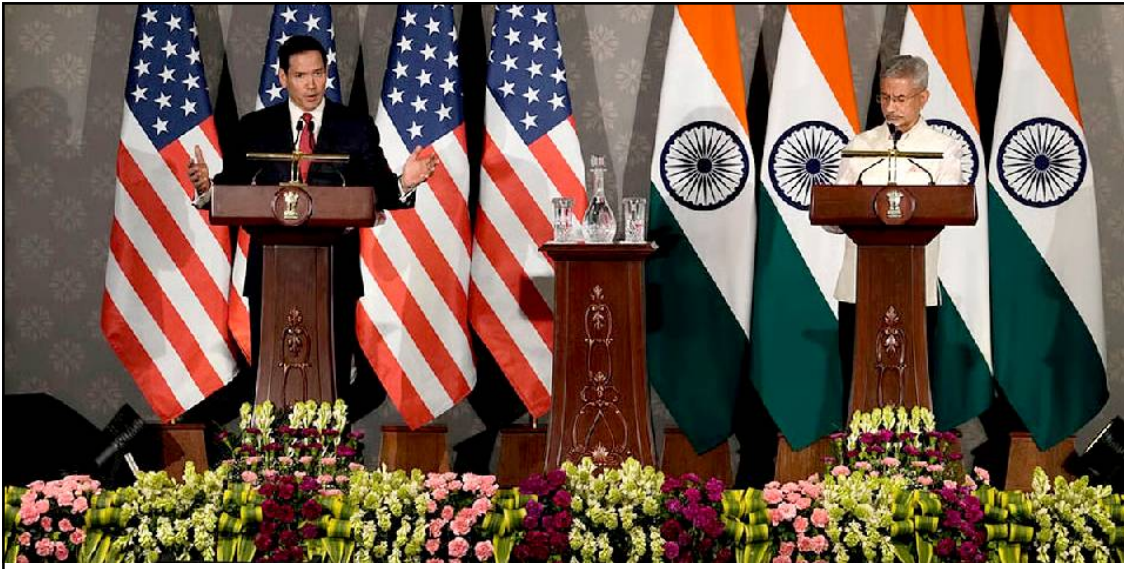
May 24, 2026 nü New Delhi nung India Minister of External Affairs S. Jaishankar (ajichi) aser United States Secretary of State, Marco Rubio nati osangbenertem den jembidang tangokba noksa nung angur.