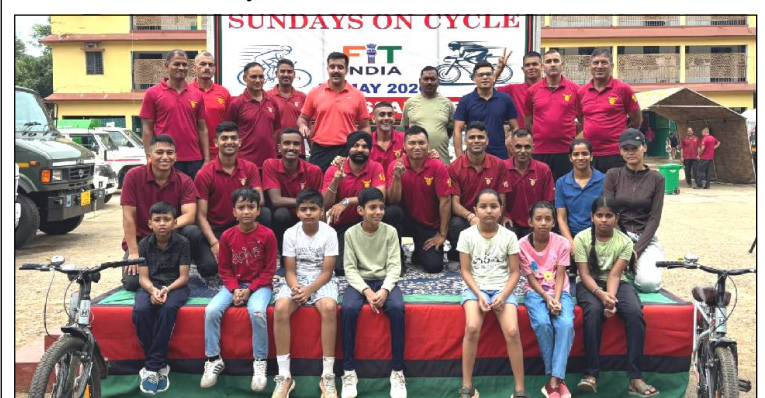
Dimapur, Monupii/May 24 (TYO): Temang anema alitsü aser libajen indang awareness sepaitem, lanur aser nüburtem nem agütsütsü atema Fit India campaign kübok Assam Rifles-i "Sunday on Cycle" sentong ayongzüka liasü.