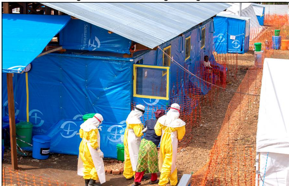
Democratic Republic of Congo (DRC) nung Samaritan's Purse indang disaster response team ka noksa nung angur.

May 24, 2026: Khristan melungtet telok aikati tang Ebola tashidak agi kongshia aliba Democratic Republic of Congo (DRC) nung iba tashidak anema rarar aser teyari balala agütsüsa atema renemdar.