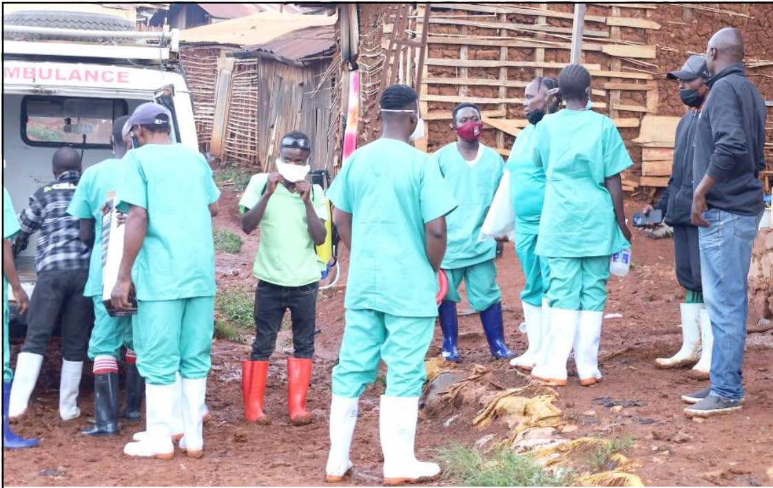
Kinshasa, May 24 : Democratic Republic of Congo nung Ituri Province kübok Mongbwalu tesem nung May 23, 2026 nü health workers tem temang nung mesen südaktsüba mapang tangokba noksa nung angur. DR Congo sorkari Ituri Province yimtiba Bunia nungi aruba aser aoba passenger tayimtsü ajunga khen asoshi soita lir, koba tang Ebola tashidak poktetba tesem tiyongtsü lir, ta Ministry of Transport ajanga Honibarnü ashi.