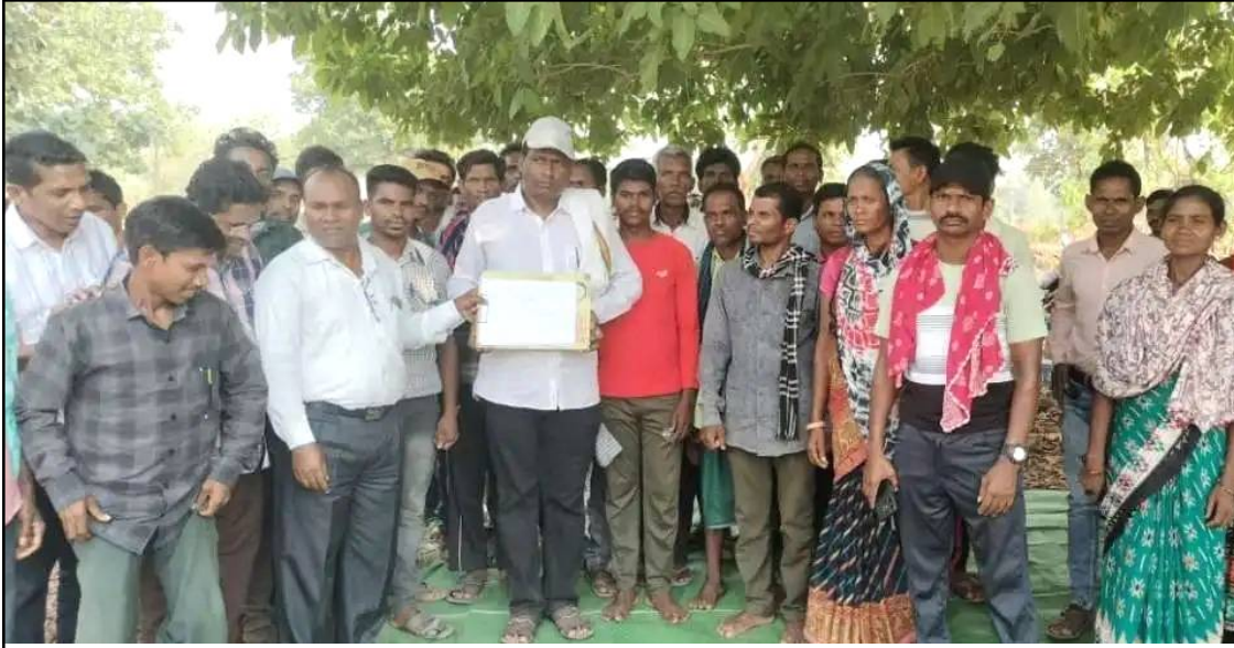
Tribal Khristan temi May 16, 2026 nü Chhattisgarh state nung Kankaer district kübok Antagarh area nung fact-finding team indang züngsem ka nem parnoki timtem ajangshibatem tezüluba nung agütsüba noksa nung angur.

Raipur, Monupii/May 26 (Agencies): Chhattisgarh state nung tribal Khristanpuri, April ita tetenzüklen nungi parnok yimtsüngtem nung tamangba yimsü mechi tajemtsü tzü aser tanga nüngdakba maongka magütsüba asoshi timtemba lemsatepba ketdangsür temi mereprangi senzüka yutsür ta ashir.