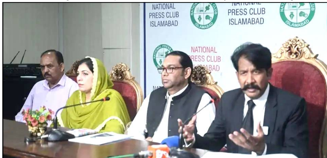
Minority Alliance Pakistan (MAP) ketdangsür temi May 21 nü Islamabad nung aliba National Press Club nung osangbener den jembidang tangokba noksa ka yangi angur.

Islamabad, Monupii/May 26 (Agencies): Pakistan nung Khristanpur lenirtemi tanga minority telok den lungjemer linük nung federal structure melenshitsü asoshi constitution yanglushitsü aliba nung tamangba yimsü tsütsü kin tila tem, tetsür aser tanurtem kumzüka ayutsü aser yimdenren nung shilem agitsü asoshi ozüng tashi taitba akhanger.