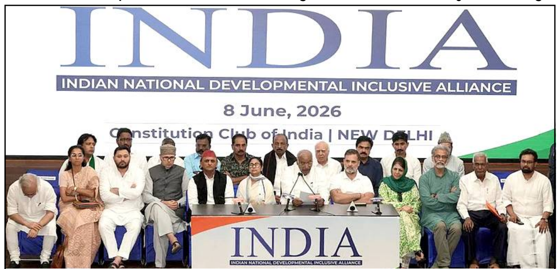
June 08, 2026 nü New Delhi nung opposition INDIA teloktepi senden nung Congress Tir, Mallikarjun Kharge, Lok Sabha nung opposition lenir Rahul Gandhi, TMC tongti Mamata Banerjee, National Conference lenir Omar Abdullah aser Samajwadi Party lenir, Akhilesh Yadav nung noksa nung angur.

New Delhi, Aami/June 08 (Agencies): Hombarnü New Delhi nung opposition INDIA teloktepi senden ka ayongzüka amenogo; iba senden nung Congress Tir Mallikarjun Kharge, TMC tongti Mamata Banerjee, National Conference lenir Omar Abdullah, Samajwadi Party lenir Akhilesh Yadav aser RJD lenir Tejashwi Yadav nung densema opposition party 25 nungi lenirtem aika aden.