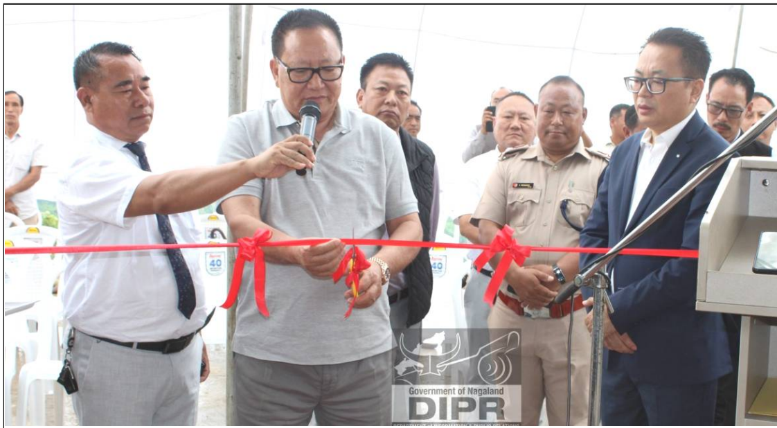
Deputy Chief Minister, Planning & Transformation and National Highways, T.R. Zeliang-i Hombarnü District Planning Office, Peren semzüksü dang tangokba noksa nung angur.

Dimapur, Aami/June 08 (TYO): Deputy Chief Minister, Planning & Transformation and National Highways, T.R. Zeliang-i June 8, 2026 nü District Planning Office, Peren semzüksüo.