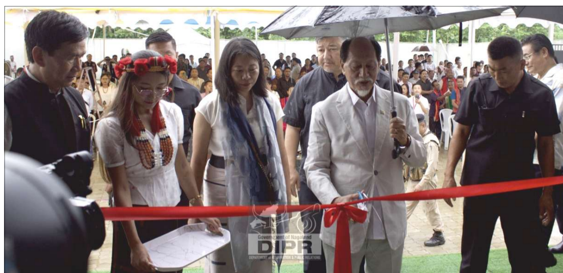
Nagaland Chief Minister Neiphu Rio-i June 8, 2026 nü State industrial area, Toluvi, Dimapur nung Food Processing unit ka lapoktsüdang agiba noksa angur.

Dimapur, June 8, 2026 (TYO): Nagaland Chief Minister Dr. Neiphu Rio-i district pezü nung incubation aser food processing centres pezü lapoktsüogo.