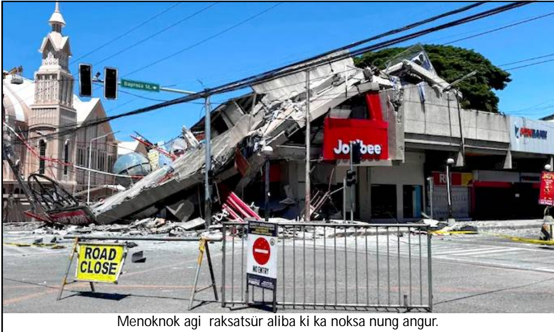
Menoknok agi raksatsür aliba ki ka noksa nung angur.

Manila, Aami/June 08 (Agencies): Hombarnü Philippines south tsütsü Mindanao asetkong nung menoknok magnitude 7.8 anokba ajanga nisung asüba 32 jungogo aser aika yiru, ta ketdangsür temi ashir aser Manila nung search and rescue operations mera tali agiba mapang lir.