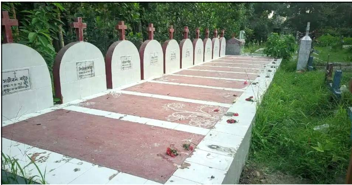
2001 kum June 3 anogo nung Bangladesh nung kiralongrartemi bomb amshia Most Holy Redeemer Tenla ki amakdang asüba Khristantem leper noksa nung angur.

June 08, 2026: Bangladesh nung bomb amshia Tenla ki amakdang Khristan aika asüba sülen kum 25 ajungbamong nung Khristantemi iba lendong nung asürtem bilemteta akhüm agütsüba den külemi sorkar dang asentenshir iba ken o dak sendakba nung Khristantem nem ochi temeden agüjang, ta takhangba agütsü.