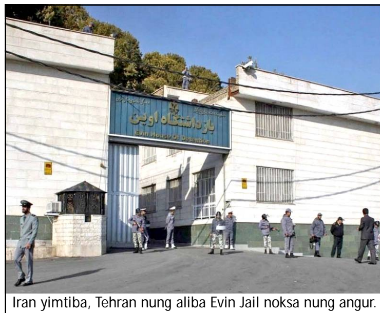
Iran yimtiba, Tehran nung aliba Evin Jail noksa nung angur.