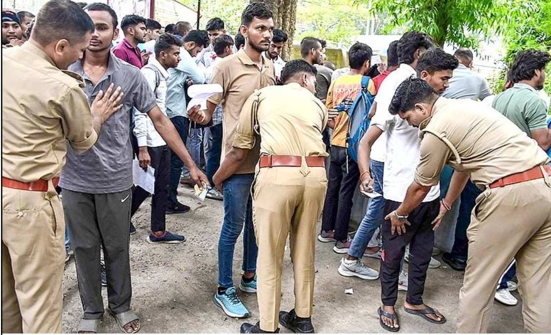
Prayagraj, Uttar Pradesh nung Uttar Pradesh Police constable recruitment tatidang nung shilem magi tsüingda candidate tem security check asüba noksa nung angur. Mapa 32,679 atema candidate lakh 7.32 tema tatidang agütsüogo. Kasa mapang nung ochi mashi inyakyim benshitsü merangba atema ken o pongu benokogo.

JAAC-i anir legislative menden mekazüka aliba aser rongsenketzüing dak sendakba nung ken o balala anema longkak aita arudar.