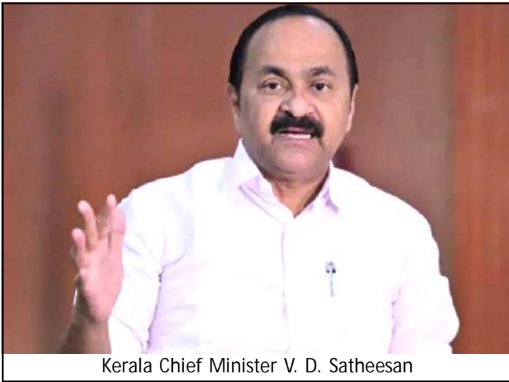
Kerala Chief Minister V. D. Satheesan

Thiruvananthapuram, Aami/ June 09 (Agencies): Kerala state nung tawa shimtetba chief minister-i state panel kati recommendations agüja aliba mapa kuma inyaka loktiliba aser rongsenketzüng tsütsü jenjang tamajungba nung aliba Khristanpur yaritsü ta shiogo.