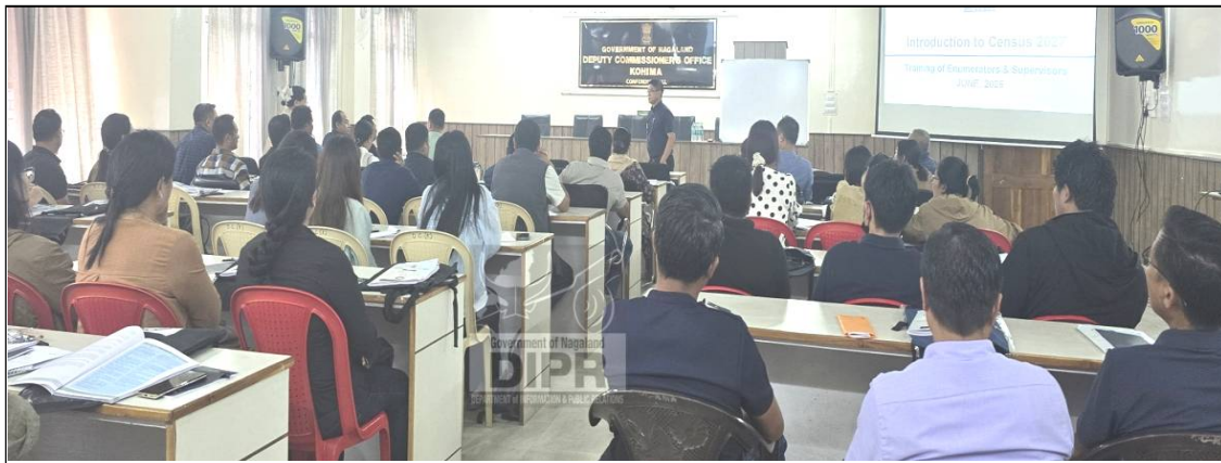
Kohima district Enumerator aser Supervisor training agiba mapang tangokba noksa angur.

Dimapur, Aami/June 09 (TYO): Census of India 2027 indang Phase-I kübok Enumerators aser Supervisors asoshi training sentong Kohima district ajunga nung June 9, 2026 nü tenzükogo aser June 11, 2026 tashi alitsü.