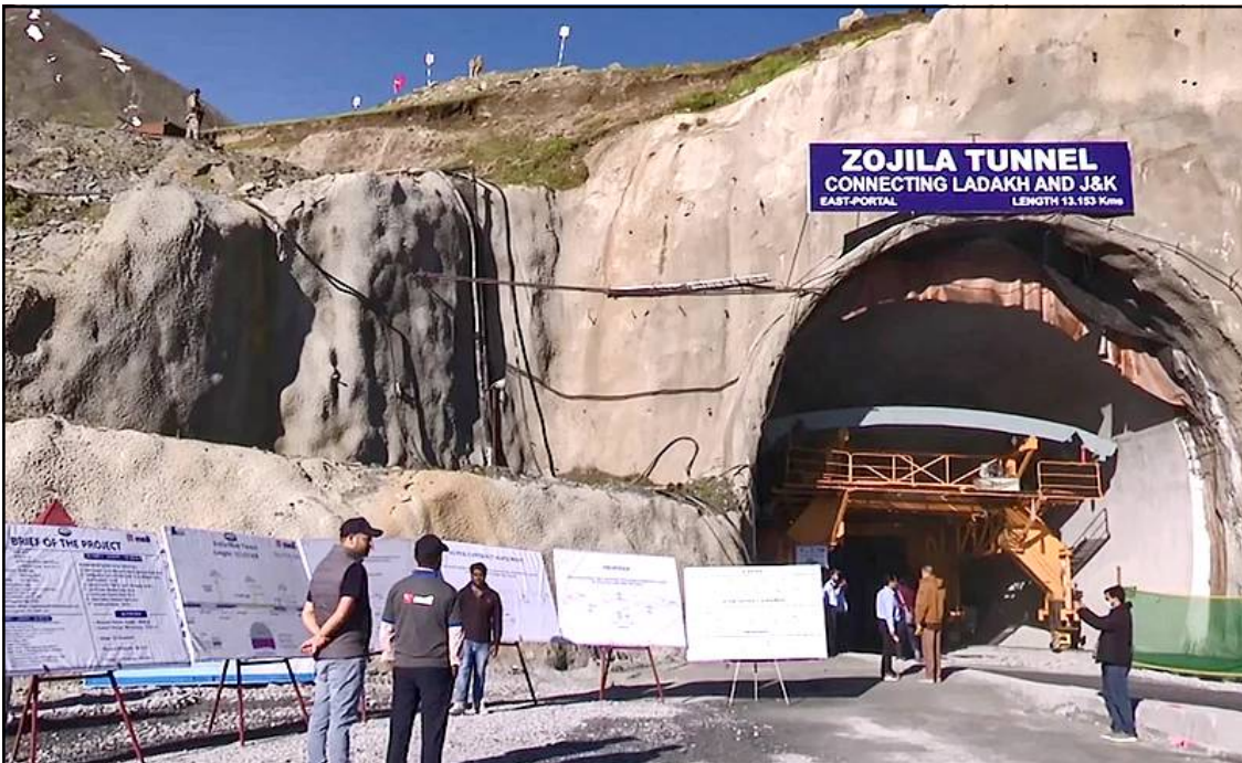
Union Minister Nitin Gadkari-i Minimarag anasa Zojila Tunnel tupoka otetba temaitsü tatembangbuba blast sütsüba noksa nung angur. Iba ajanga Kashmir aser Ladak na sendakteptsütsü.