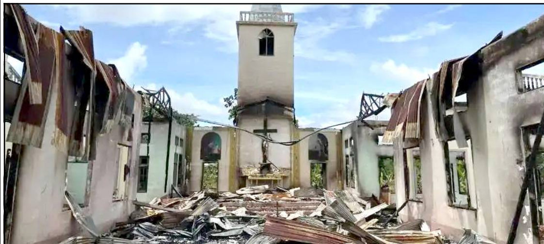
Amnesty International ajanga July 20, 2022 küm sayuba noksa ka nung Myanmar mitkari tekülem ki ka poksaja mi agi rongdoktsür aliba angur.

Vatican, Aami/June 09 (Agencies): Myanmar nungi Catholic bishop ka Pope Leo XIV den ajuruteptsü asoshi Vatican semdangba mapang, bishops tem pei arogo nung melitetsüsa akumba densema linük nung humanitarian crisis tamajungba akumba indang lemsatepa liasü.