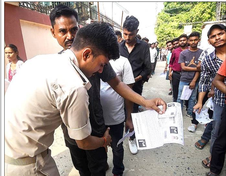
June 17, 2026 nü Patna nung CSBC Bihar Prohibition Constable tatidang agütsütsüpurtem sepaitemi mita reprangba noksa nung angur.

JMM nungi Shibu Soren süadokba ajanga Rajya Sabha nung menden ka tazüng aküm aser BJP züngsem kümsük Deepak Prakash kümsük June 21 nü abensaba ajanga menden ka azüngteter.