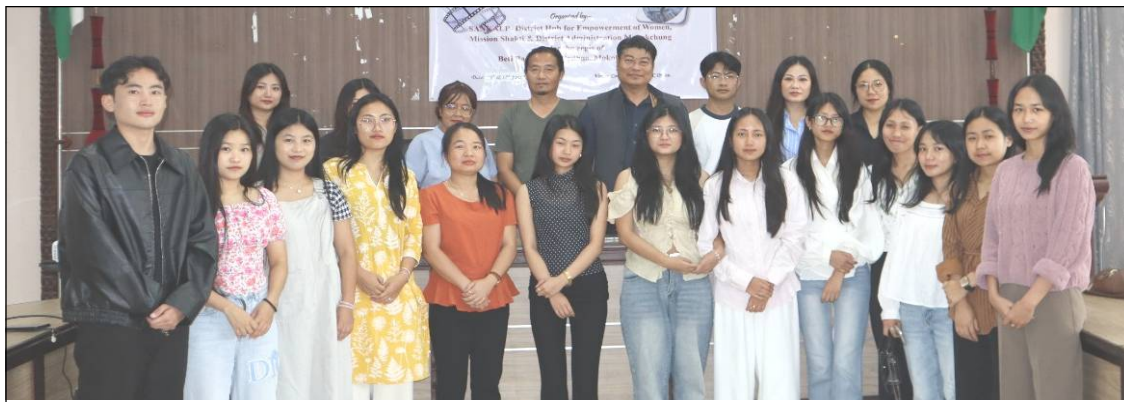
June 16 & 17 anogo ana Mokokchung DC Office Conference Hall nung videography, video editing aser social media marketing indang workshop ka agiba mapang tangokba noksa nung angur. Iba sentong ya DHEW kübok SANKALP DHEW aser District Administration, Mokokchung nadi digital tsütsü shisatsü balala angazükdaktsütsü aser tajungba kumdaktsütsü nükjidong yur ayongzuka liasü. Mokokchung, 17th June, 2026