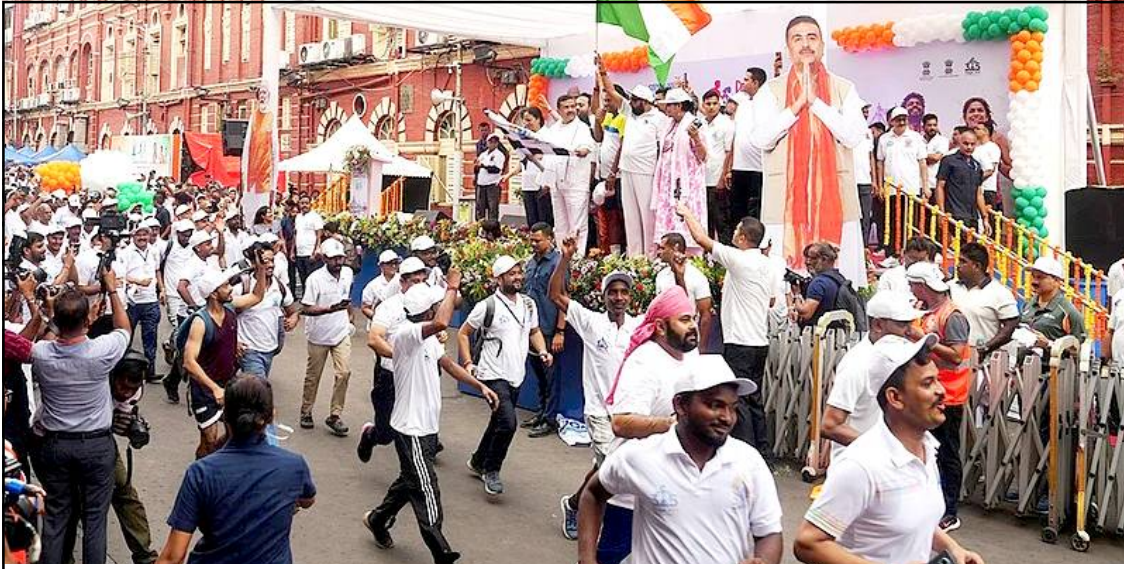
June 19, 2026 nù Kolkata nung West Bengal Chief Minister Suwendu Adhikari-i 'Daud Se Dhyan' sentong tenzüksüba noksa nung angur. Kasa noksa nung Union MoS Prataprao Jadhav aser state Cabinet Minister tem- Agnimitra Paul aser Indranil Khan nungera angur.