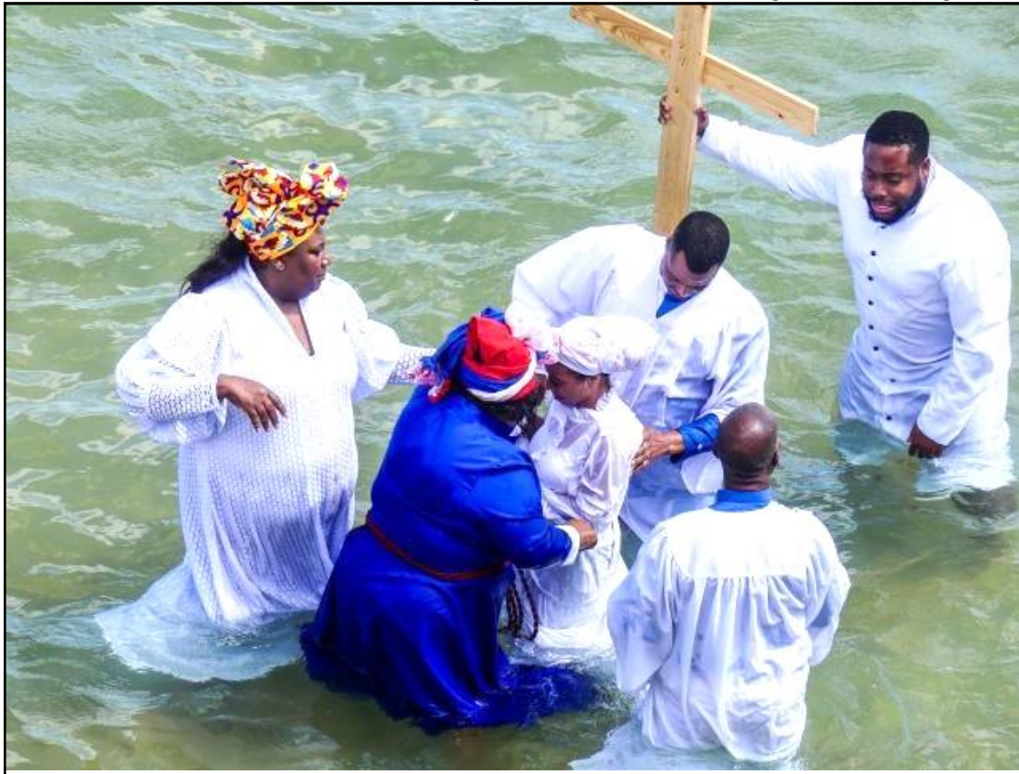
Yaküm Bournemouth tzüymkümlen baptiba mapang tangokba noksa nung angur.

June 19, 2026: Tan hopta tatembanglen Bournemouth tzüküm nung Arogo aikati longjemer baptiba sentong tuluka ayongzüka agitsü.