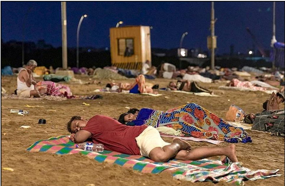
Mumbai, June 19, 2026: Mumbai nung tesüiba anogo ishika light junga maruba agi tatsük marem nisungtem Versova tzüyimkümlen moapu nung mejangba noksa nung angur.