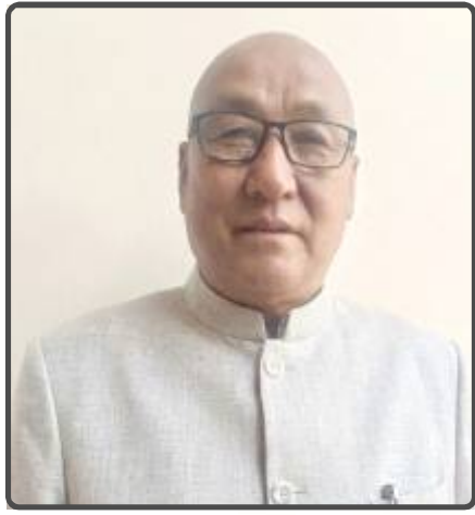
Wb. IMKONGMEREN AO

"Ni rara tajungji raraogo, ni alizüng tonga asemogo, ni tamangji yuogo." - 2 Timoti 4 : 7 - 8