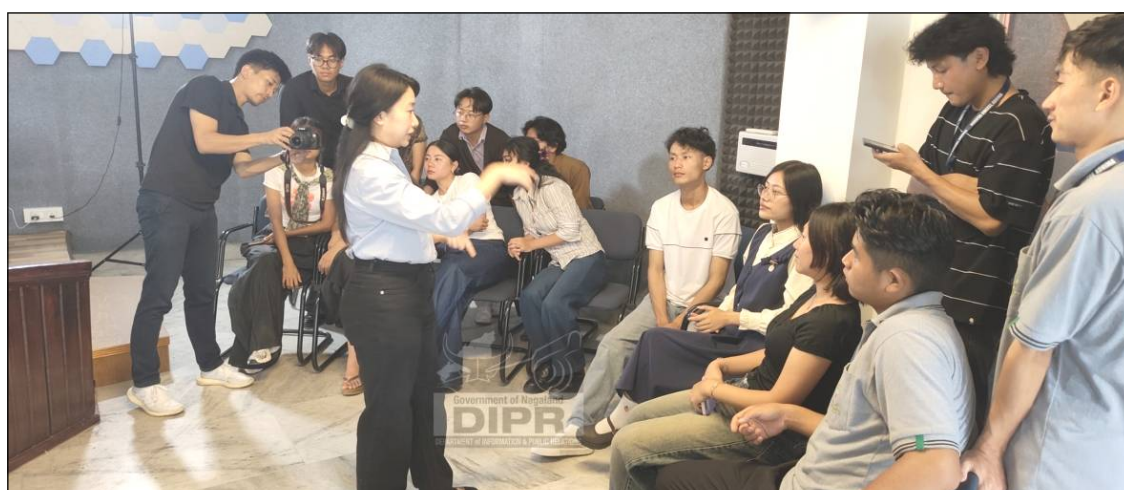
DIPR nung photography aser videography training agiba mapang ttangokba noksa angur.

Dimapur, Aami/June 22 (TYO): Department of Information & Public Relations (DIPR) ajanga yangji interns tem asoshi anogo asem Photography and Videography Training Programme ka Directorate Conference Hall nung June 22, 2026 nü tenzükogo.