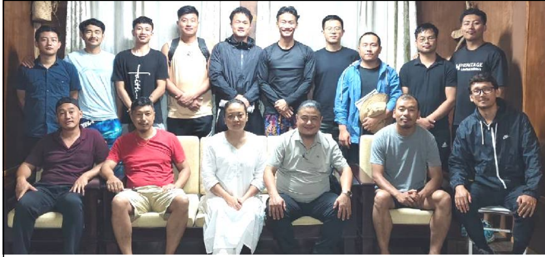
BAMD pur Mokokchung nung High School & Higher Secondary School Basketball Tournament akatsü asoshi June 19 anogo BAMD senden mener kelen tangokba noksa.

Mokokchung, Aami /June 22 (TYO) : Basketball Association Mokokchung District-i (BAMD) ayongzüka 2buba Inter School & Higher Secondary School Basketball Tournament 2026, August 5 nungi 7 tashi BAMD Basketball Court, Imkongmeren Sports Complex nung akatsü ta Organising Committee ajanga June 19 anogo BAMD senden nung lemtetba BAMD