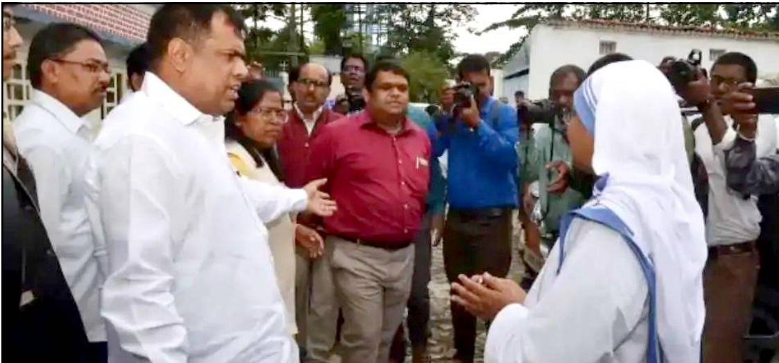
2018 küm July ita nung tanur shibelenba ken o ka bushisüngdangba mapang Ranchi nung Missionaries of Charity nungi nun kati National Commission for Protection of Child Rights nungi team ka agizükdang tangokba noksa nung angur.

June 22, 2026: Jharkhand state nung Missionaries of Charity nungi nun kati ozüng alema tanur shibelen, ta tai tonglokja la anema ken o benoka liasü, ajisiüaka küm 8 lir sülen iba ken o nung lai maitsüi obendang agütsüogo.