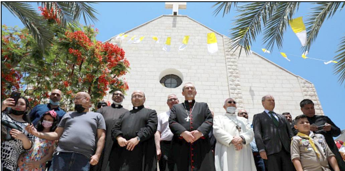
Jerusalem nung Latin Patriarch Cardinal Pierbattista Pizzaballa aser Patriarch Theophilos III na Gaza tonga aruba sülen tangokba noksa nung angur.

June 22, 2026: Hombarnü Jerusalem Latin Patriarch Cardinal Pierbattista Pizzaballa-i Gaza nung Palestine nunger Khristantem mesendoktsü, ta metetdaksü.