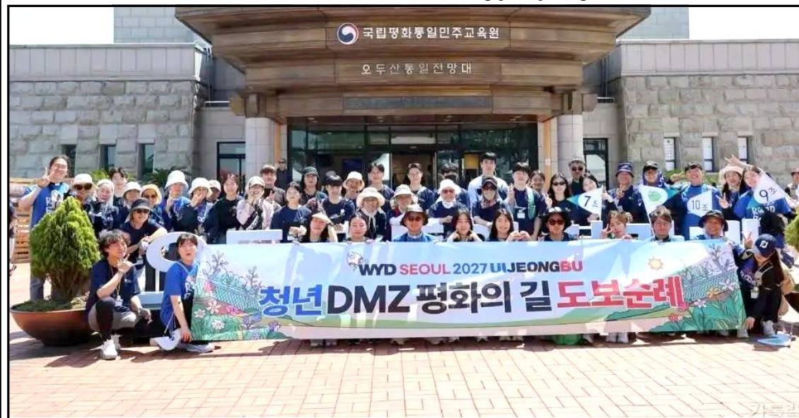
South Korea nunger Catholic lanurtem May 22 nü Paju city nung aliba Odusan Unification Observatory jakdang yimjung, jungtepa alitsü aser libajen wazüka ayutsü asoshi sarasademtsü adenshia aliba noksa nung angur.