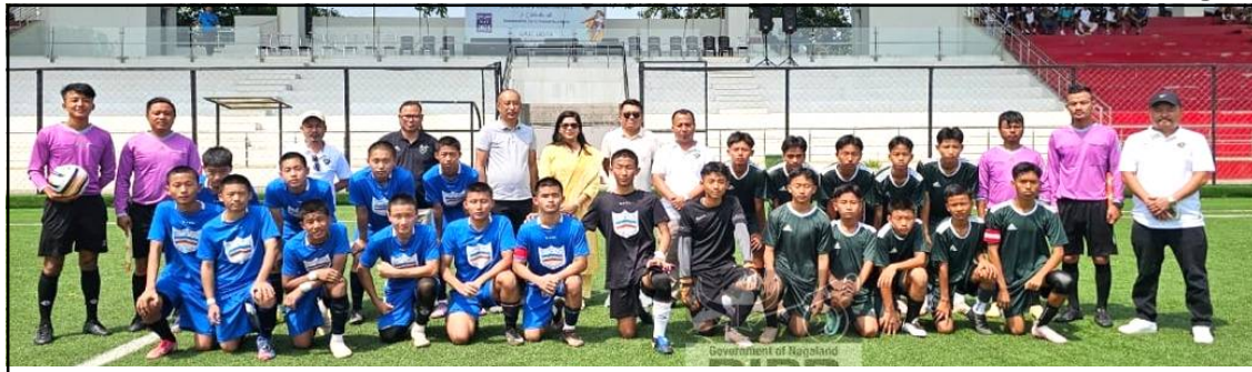
Inter School Pre-Subroto Cup nung mezüngbuba asaya nung asayaba team aser ketdangsürtem tangokba noksa nung angur.

Dimapur, Monupii/May 27 (TYO): U-17 tebur aser tetsür atema Zone-2 Inter School Pre-Subroto Cup International Football Tournament May 27 nü Chümoukedima Football Stadium nung tenzükogo.