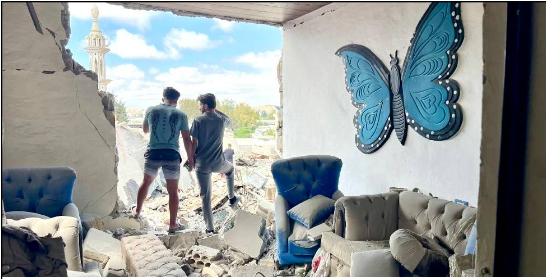
Beirut, May 27: Israel-i Tyre, Lebanon nung tayimtsü amshia amakdang raksatsür aliba ki ka nung nisung nokdaka aliba noksa nung angur. Mongulbarnü Israel-i Lebanon southern aser eastern tsütsü amakdang nisung 18 asü aser 20 dak yema yiru, ta Lebanon ketdangsür temi ashi.