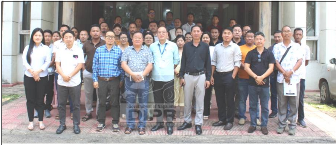
Dimapur nung Field Trainers training agiba mapang tangokba noksa angur.

Dimapur, Monupii/May 27 (TYO): Census of India 2027 indang First Phase asoshi renemshia Dimapur, Niuland, Chümoukedima, Peren aser Mon districts nungi ketdangsür atema asemnü Field Trainers Training sentong Circuit House, Dimapur nung May 27, 2026 nü tenzükogo.