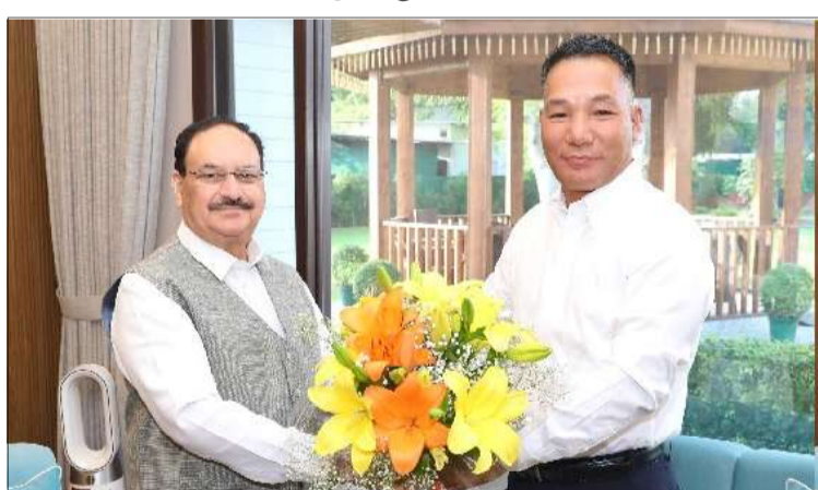
Union Minister J.P. Nadda aser Minister P. Paiwang Konyak na New Delhi nung ajurutepdang agiba noksa ka angur.

Dimapur, May 27, 2026 (TYO): Union Minister for Health & Family Welfare, Jagat Prakash Nadda-i Nagaland Institute of Medical Sciences and Research (NIMSR), Kohima ya super-specialty institute ka akümtsü aser Naga Ki City, Chumukedima nung Green Field Medical College lapoktsü nangzükogo.