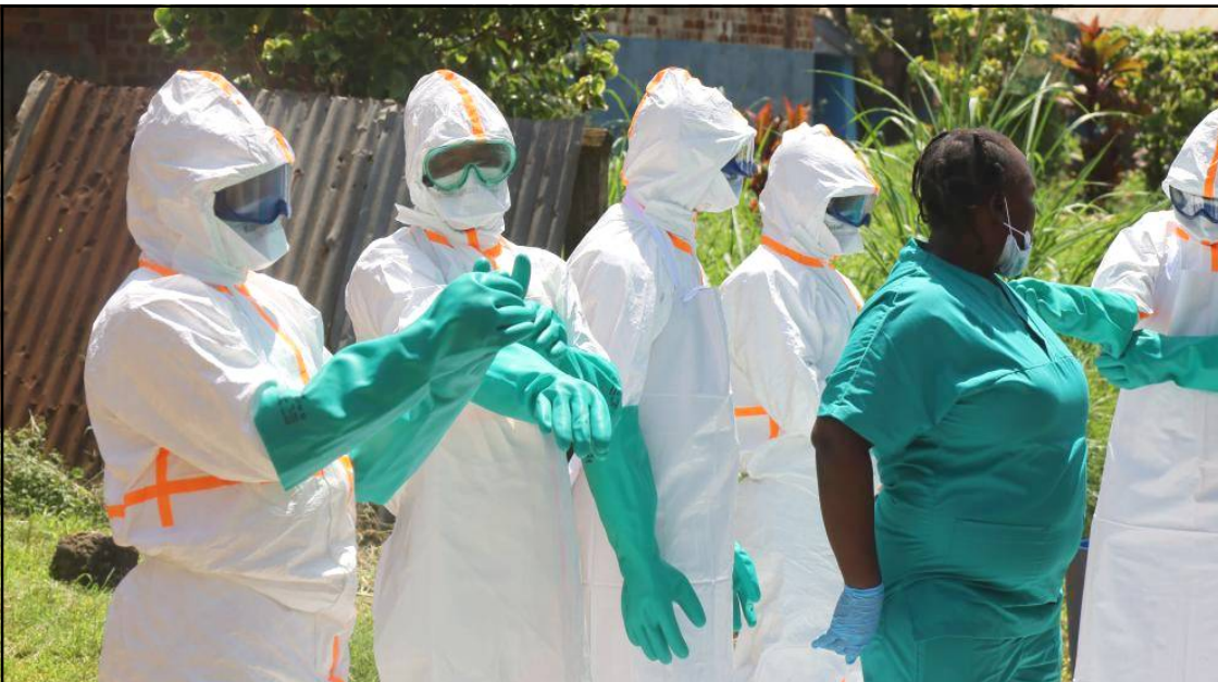
Kinshasa, May 27: DR Congo nung Ituri province kübok Mongbwalu tesem nung medical workers tem protective suits agir mapai aotsü renemdang tangokba noksa nung angur. DR Congo nung Ebola wara pokteter mapang talangka masü, saka iba wara agi menepba aser asüba maneni tali akumer, ta Health Minister Roger Kamba-i Mongulbarnü ashi. Health ketdangsür temi suspected cases 1,000 shi jangjateta lir, kong nisung 101 dak iba wara jangjatetogo, ta Kamba-i osangbener dang ashi.

nü apok. Ano Honibarnüa Latvia telungi drone ka meputeti aita awatsüng ka nung apok, ta angopuer kati ashi. May 20 nü drone ka aruba ajanga Lithuania yimtiba Vilnius nung ozüng yanglurtem ali telung nung atsük aser May 19 nü NATO military jet kati drone ka Estonia anünglen nungi khazüka yok. (Maneni tapak 8 nung...)