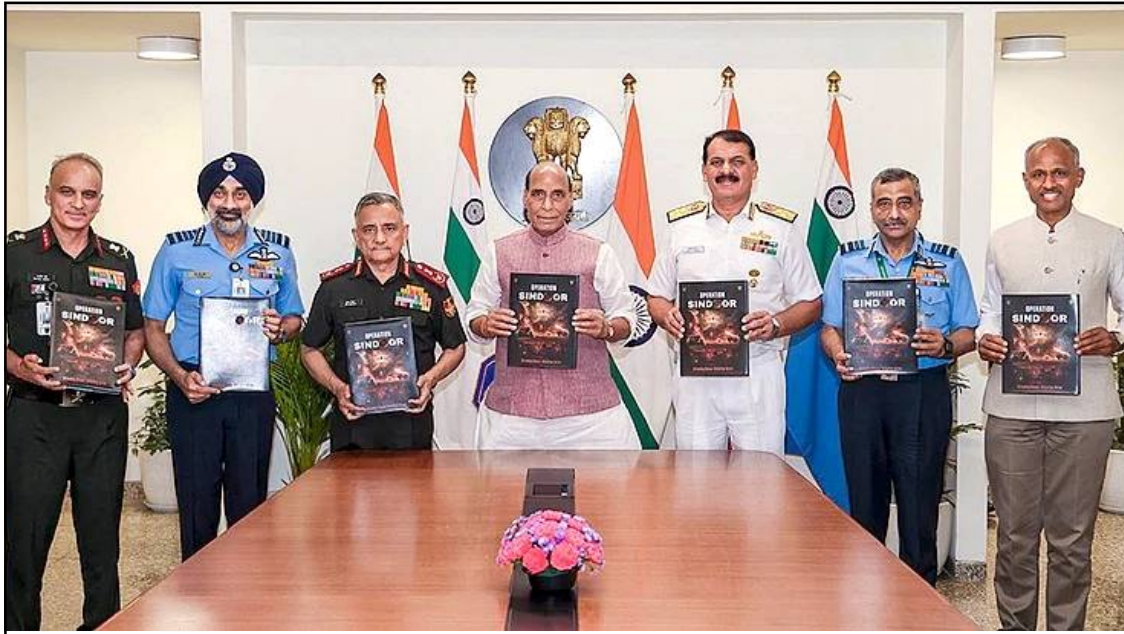
May 29, 2026 nü New Delhi nung 'Operation Sindoor' indang kaket ka sayaba sentong nung Union Defence Minister Rajnath Singh, Chief of Defence Staff General Anil Chauhan, Chief of the Air Staff, Air Chief Marshal AP Singh, Chief of the Naval Staff Admiral Dinesh K Tripathi aser tangartem angur.