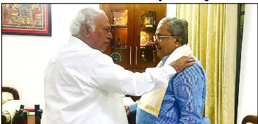
May 29, 2026 nü New Delhi nung Congress Tir aser Rajya Sabha nung opposition lenir, Mallikarjun Kharge-i party lenir Siddaramaiah ajurudang tangokba noksa nung angur. Siddaramaiah-i Karnataka Chief Minister menden toktsüogo.

New Delhi, May 29 (Agencies): Siddaramaiah-i Karnataka nung Chief Minister menden toktsüba sülen anogo ka lir Delhi nung Congress lenir Sonia Gandhi aser Rahul Gandhi na ajuru. Pai Congress Tir, Mallikarjun Kharge-a ajuru.