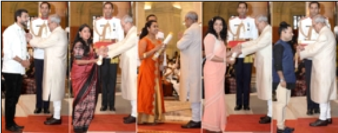
New Delhi, April 13, 2017: Brihostibarnü New Delhi, Rashtrapati Bhavan nung Tir, Pranab Mukherjee-i (abelen nungi ajichilen) Chef, Sanjeev Surendra Kapoor, Odissi tsüngsanger Aruna Mohanty, Olympic gymnast, Dipa Karmakar, Olympic Wrestler, Sakshi Malik aser kentener, Kailash Kher nung nem Padma Shri awards agütsüba noksa nung angur.

New Delhi, April 13 (Agencies): Tir Pranab Mukherjee-i Brehostibarnü Padma awards nisung 44 nem agütsü. Item rongnung 'celebrity' tem aser lokti atema teyari balala agütsüba nisungtem densema liasü.