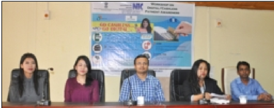
April 13, 2017 nü Mon Deputy Commissioner Conference Hall nung Digital Cashless Payment Awareness Workshop agidang tangokba noksa nung angur.

Dimapur, April 13 (TYO): Brihostibarnü Mon Deputy Commissioner Conference Hall nung Digital/Cashless Payment Awareness indang workshop ka ayongzüka agiogo; iba sentong ya District Administration den National Informatics Centre, Mon-i senteper ayongzüka liasü.