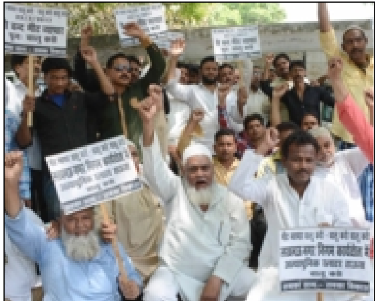
Lucknow, April 13, 2017: Nashi tepsetba kitem nokdangba anema Brihostibarnü Lucknow nung Qurashi züngsemtemi mener longkak aitba noksa nung angur.

Aadhar ajanga payments sütetsü. Ato kilonserisa BHIM atema incentive schemes ana- Cashback aser Referral bonus tenzüksütsü aser iba nungji ita trok tsüngda sen crore 495 intoktsü. Referral bonus scheme kübok BHIM amshirtem aser tang tasen amshirtemi pei account nung cash bonus angutsü. Cashback scheme kübok shishilembartem BHIM ajanga sen transact asüba shia cashback angutsü. Schemes anaprong ya MEITY aser NPCI-i ketdangsa inyaktsü. BHIM App ajanga alima nung otsü tasen ka yanglutetogo; Yaküm December ita nung iba app tenzüka sülen ita pezü tsüngda nisung crore 1.9-i iba app download süa liasü. Tan financial year nung digital transactions crore 2500 nükjidong yur Ato kilonserisa sen kanga ajema amshiba jila 75 sangdongtsü. Item jilatem nung anogoshia digital transactions lakh 1.5 asütsü imlar aser ibaji ajanga küm nungbo transaction crore 5.5 shi ajungtsü.