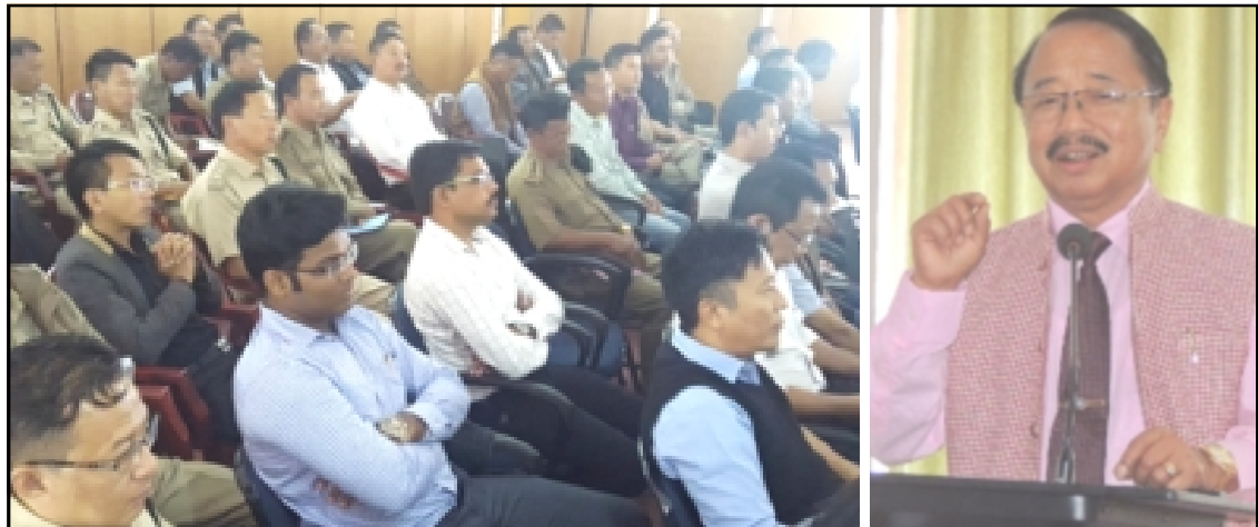
Nagaland Environment, Forest & Climate Change department nung inyaker ketdangsertem den parnok minister Wb. Imkong L. Imchen-i jembiba noksa nung angur. Kohima, April 13, 2017.

Kohima, Apr 13 (TYO) : Nagaland ya süngdonglidong agi sünga aliba lima 'green field' ka kümdaktsütsüsa asenoki meranga inyakdi ta Environment, Forests aser Climate Change minister, Wb. Imkong L. Imcheni tanü par department nung inyakerkem den jembidang metetdaksü.