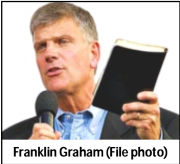
Franklin Graham (File photo)

April 13, 2017: Palm Sunday nü Egypt nung kiralongrar telok IS-i tenla ki ana poksatsüba sülen Hombarnü Daily Mail editor, Piers Morgan-i, kiralongrara telok, Islamic State-i Khristan tem anema inyaker ta jembia liasü aser iba oji metenja Evangelist, Billy Graham'er jabaso, Franklin Graham-i, ISIS-i Khristan tamangba yimsü anema rara ayongzükogo, ta ashi.