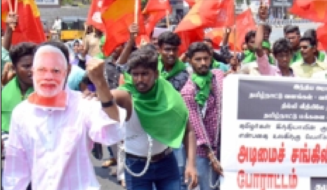
Chennai, April 13, 2017: New Delhi, Jantar Mantar nung Cauvery ayong atema longkak aitba sentong pusema Brihostibarnü Chennai nunga Tamizhar Ezhuchi Iyakkam züngsemtemi merang lisü agi teka alenteper longkak aitba noksa nung angur.