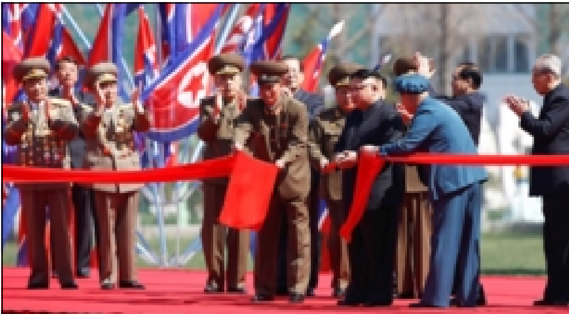
Pyongyang, April 13, 2017 : Ryomyong street, Pyongyang nung nisung alitsü complex tasen ka lapoktsü dang North Korea lenir Kim Jong Un-i ribbon mejepdangba noksa nung angur April 13, 2017.

Nepal-i tesüiba mapangtem nunga iba mesükba military exercise ya India, US aser tawa UN peace-keeping operation mapang linük aika den lokteper agiogo.