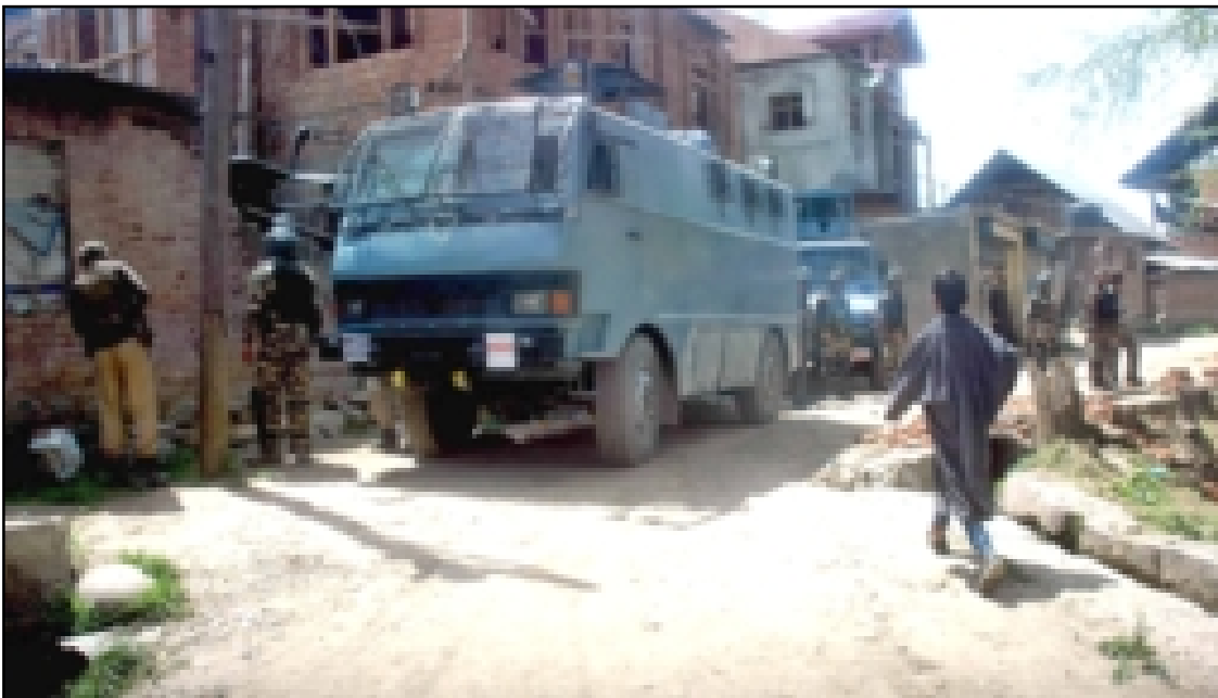
Srinagar, April 13, 2017: Brihostibarnü Srinagar Parliamentary constituency menden atema polling station 38 nung nung election agishiba anogo nung security sepaitemi iba constituency kübok Chadoora tehsil nung mitkar mapa inyakba noksa nung angur.