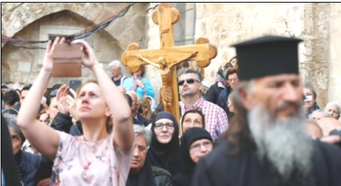
Jerusalem, April 13, 2017 : Jerusalem Yimti Tejenba nung aliba Holy Sepulchre tenla kidang Orthodox Khristan amangertemi kati ka "Tetsüng shitoktsütepba" sentong nung shilem agiba noksa nung angur.

Pope-i April 28-29 anogotem nung Egypt yimtiba, Cairo semdangtsü sentong lir.