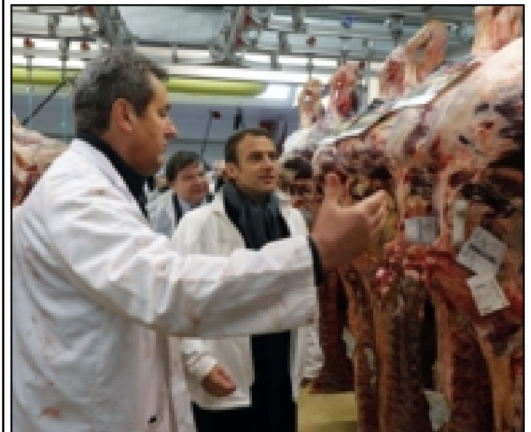
Rungis, April 18, 2017 : France Tir menden asoshi tokteper, candidate Emmanuel Macron-i Paris anüolentip tsütsü chiyungtsü shishilembaba tesem, Rungis wholesale nung shi ayokba tesem ka semdangba noksa nung angur.

Ajisüaka lai ashiba ama election kara agitsü asoshi la den sema parliament nung asemsü lemer anasü indang vote lai angutsüla. Opposition nungi Labour Party-ia parnok iba election asoshi renema lir ta shiogo.