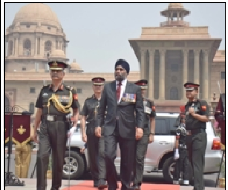
New Delhi, April 18, 2017 : Mongulbarnü Canada Defence Minister Harjit Singh Sajjan Union Finance & Defence Minister Arun Jaitly den ajuruteptsü tonga aruba sülen Army ketdangsertemi agizükba noksa yangi angur.

"La kechiba soseta asü ibaji bushisüngdangdar aser tang la temang sensaa repringba osang atar," ta ketdangser jagisa ashi.