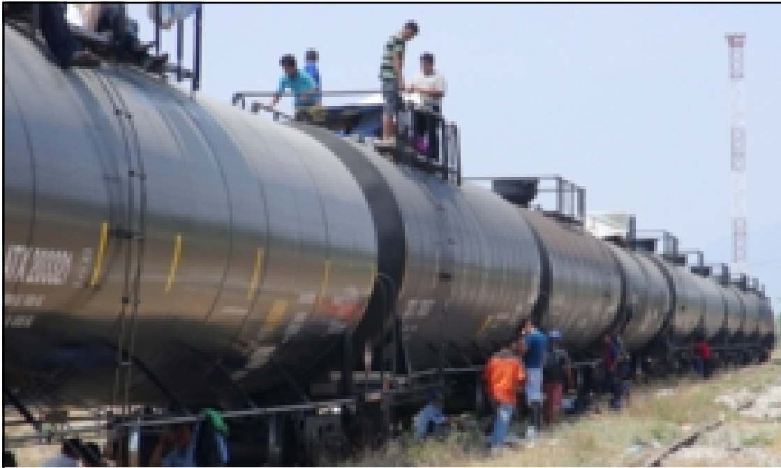
Ixtepec, April 18, 2017 : Central America nung migrant temi chemical abenba freight train ka nung mener Ixtepec, Oaxaca state, Mexico nung aliba U.S. arrtsü ajanga yokang ta akhangba noksa nung angur.