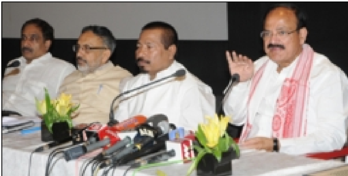
Guwahati, April 18, 2017 : Mongulbarnü North East tesem nung Information & Broadcasting Ministry indang inyakyimtem, sentongtem aser mapa tasen awawa inyakbatem asadanga sentong temer külen Union Minister for Urban Development, Housing & Urban Poverty Alleviation aser Information & Broadcasting M Venkaiah Naidu-i osangbenertem den senden mena jembiba noksa nung angur.