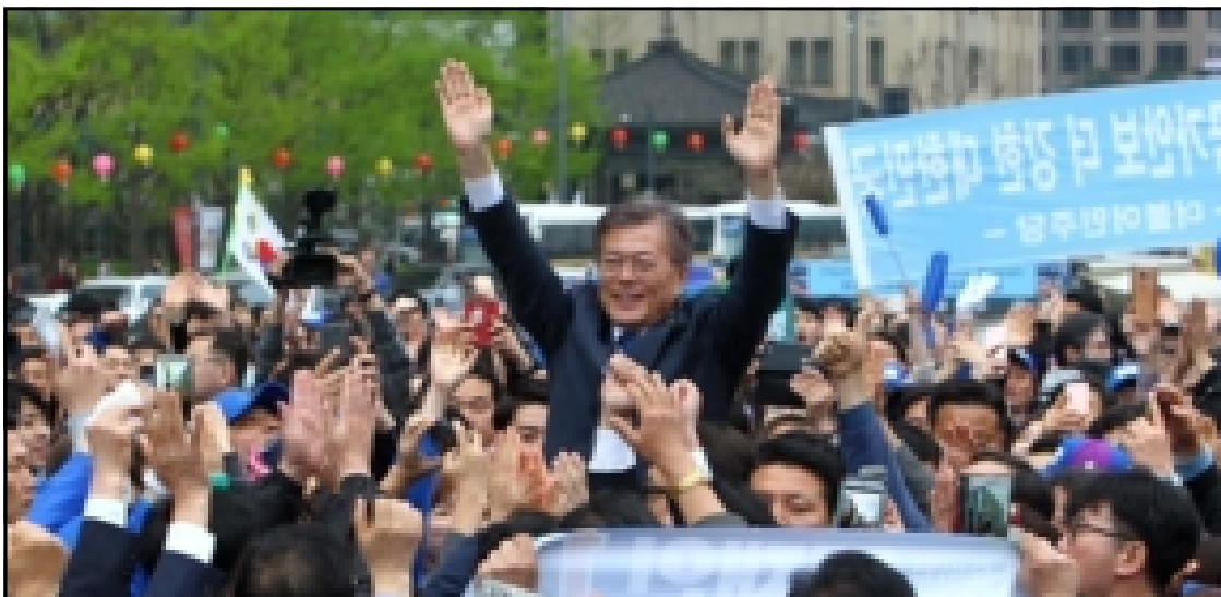
Seoul, April 18, 2017 : April 17, 2017 nü Seoul, South Korea nungi party tulutiba, Minjoo Party nungi linük Tir asoshi tokteper candidate, Moon Jae-in election nübuyim sentong ka nung shilem agiba noksa nung angur. May 9, 2017 nü agitsü aliba Tir election nung tokteper Candidate temi parnok official nübuyim sentongtem Hombarnü nungi tenzüko.

Iba temelenshi ya Turnbull-i India semdanga linük security, kiralongra tebilemstü, shisaluyim aser tashi tsütsü olemtep kar külen tenangzüka trok nung sign sütepba sülen sangdong.