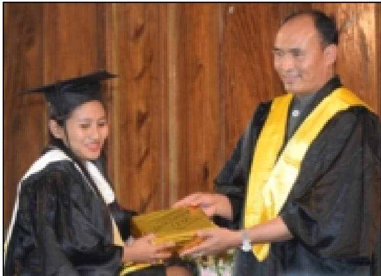
Mongulbarnü Dimapur Town Hall nung FTC 8 buba Graduation sentong nung School Education & SCERT Minister, Yitachu-i takoker nem sempet agütsüba noksa angur

Dimapur, April 18 (TYO): Naga loktiliba nung school züngtor anener aika lir aser iba khuret ya tuluka lir, ta Mongulbarnü School Education & SCERT Minister, Yitachu-i ashi.