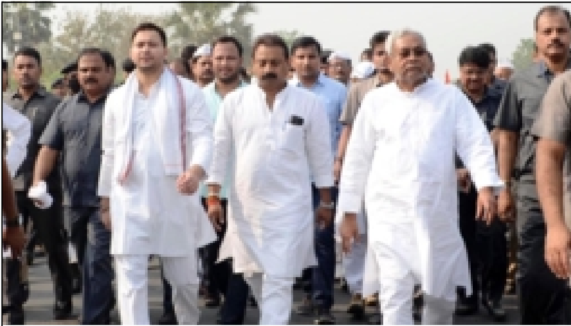
Motihari, April 18, 2017 : Mongulbarnü Motihari nung Bihar Chief Minister Nitish Kumar aser Deputy Chief Minister Tejashwi Yadav na Mahatma Gandhi Champaran Satyagrah kum 100 jungmung nung adenba noksa nung angur.