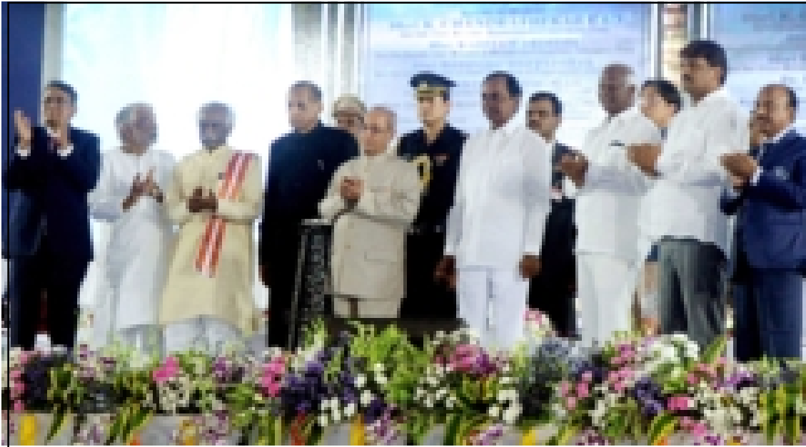
Hyderabad, April 26, 2017 : Bodhbarnü Hyderabad nung Osmania University kum 100 ajungba benjungmung sentong nung linuk Tir, Pranab Mukherjee, Telangana aser Andhra Pradesh Angh, E S L Narasimhan, Telangana Chief Minister, K Chandrashekhara Rao, Minister of State for Labour and Employment (I/C), Bandaru Dattatreya aser tanga ketdangsertem adenba noksa nung angur. Osmania University ya public state University ka lir aser iba ya 1918 kum teneta liasü. Iba University ya University Grants Commission, National Assessment & Accreditation Council aser Association of Indian Universities den affiliate süa lir.