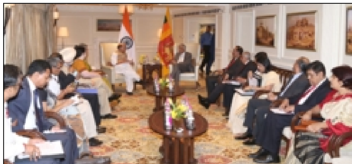
New Delhi, April 26, 2017: Bodhbarnü New Delhi nung Union Home Minister, Rajnath Singh-i Democratic Socialist Republic of Sri Lanka Ato kilonser, Ranil Wickremesinghe ajurua senden amenba noksa nung angur. Sri Lanka leniri anogo pezünü atema India semdanga lir. Pa yashi New Delhi tonga aruba sülen pai India lenirtem aika ajuruogo.

Security sepaitemi tashi alia amshir, ta aija kaketshirtemi longkak ait tenzükba sülen olulu proka tensa tamajungma mekümdaksütsü nükjidong nung Hombarnü mobile internet services anenja liasü.