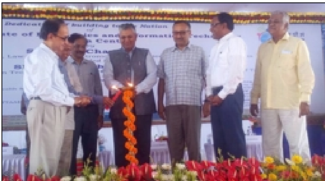
Agartala, April 26 : Bodhbarnü Jirania sub-division kübok Bodhjunnagar tesem nung NIELIT campus tasenba lapoktsüba mapang, Minister of State for Electronics & IT P P Chaudhary-i milen tsüklokba noksa nung angur. Maneni IT Minister Tapan Chakraborty-ia noksa nung angur.

"Onoki pension scheme tasenba indoker tejenba asentenshia amshitsü asoshi akhang," ta association ajanga PM Narendra Modi dangi tezüluba nung takhangba ka agütsü. Parnoki maneni tesayurtem aser elementary education nung tebilemetsü adokbatem achayangtsü asoshi national commission ka dentettsü asoshi akhang.