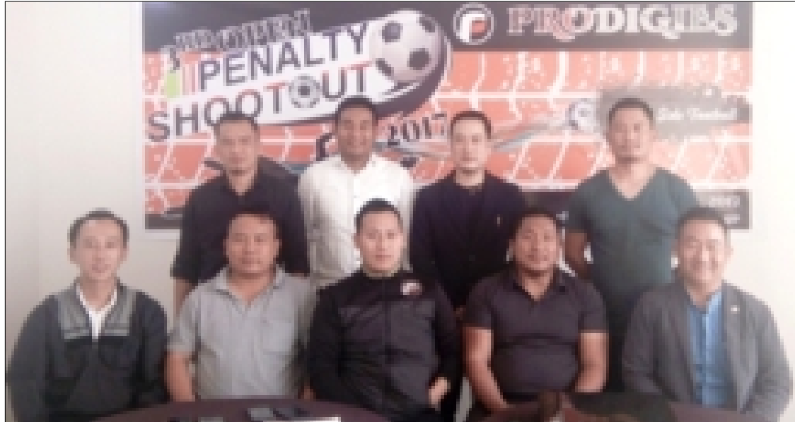
Kohima, April 26 : 2017, April 26 anogo Kohima nung Prodigies Group ketdangsertemi osangbener den senden ka amenba sülen tangokba noksa nung angur.

Kohima, April 26 (TYO): May 13 nü D. Khel (Seikhazou) Ground, Kohima village nung Khedi Baptist Church, Kohima kübok Prodigies Group ajanga "Innovating a stronger fellowship" omen nung ajemdaker 3buba Open Penalty Shoot-Out Tournament ka ayongzüka alitsü, ta sangdongogo.