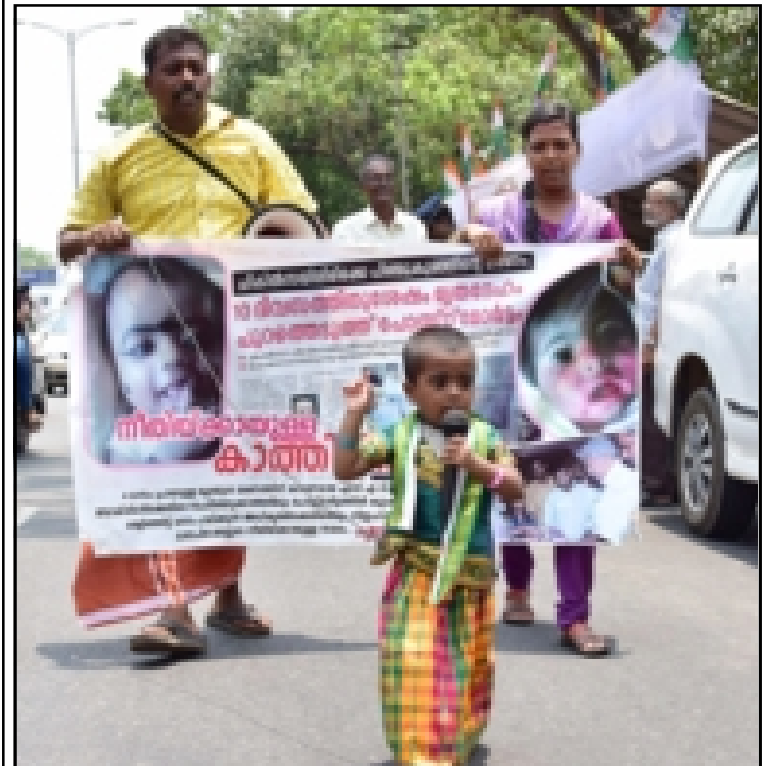
Thiruvananthapuram, April 26, 2017: Bodhbarnü Kerala yimtiba, Thiruvananthapuram nung kibong kati Kerala Secretariat kima longkak aitba noksa nung angur. Sorkari medical teyari magütsüba ajanga par chir arishi ita pezü tanur asü ta shia parnoki longkak aitba noksa nung angur.

Taoba hopta nunga JD(U) lenir aser Bihar Chief Minister Nitish Kumar aser CPI-M General Secretary, Sitaram Yechury natia Sonia Gandhi ajurua Tir election dak sentakba nung o lemtepa liasü.