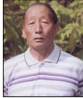
ASÜR TSÜRABUR IMSUMEREN JAMIR, UNGMA

Na iba akümüli nungi pilar tanü (27-4-2017) küm ana abensaago. Na onok nungi pilaa oaka, nü temeim mapa, nü senti kensü ola aser nü sarasadem anogo shia onok den alir, aser onoki na teti menungra bilemteter.