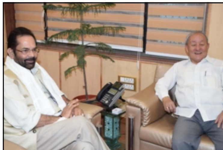
New Delhi, April 26 : Minister of State for Minority Affairs (I/C) & Parliamentary Affairs, Mukhtar Abbas Naqvi-i Bodhbarnü New Delhi nung Arunachal Pradesh Assembly Speaker, T N Thangdok den ajurutepdang tangokba noksa nung angur.

Aji saka aibelena alisang yagi pa nem auto rickshaw ka malitsüra la den kibong makümtsü ta ashi. Iba sülen tetempang nung tanütsülar kinungertemi police station nung tanobusang anema keno ka benokogo.