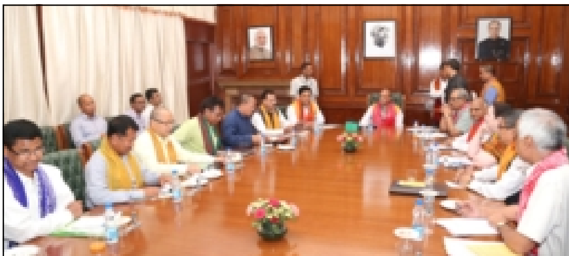
New Delhi, April 26: Bodo nungler lokti nungi teshimtet züngsemtem New Delhi nung April 26 nü Union Home Minister, Rajnath Singh ajurutep dang tangokba noksa nung angur. Maneni of Assam Chief Minister, Sarbananda Sonowal aser tanga sorkar ketdangsertem noksa nung angur.