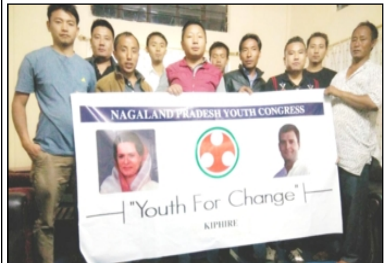
April 25, 2017 nü Kiphire nung Nagaland Pradesh Youth Congress (NPYC)-i state-wide tour (Organizational) tenzüka noksa nung angur. Iba tour ya shilem balala lemer aotsü aser Nagaland state tesem ajak ayimjemtsü.

Pua alisangji Zunheboto jila nung ozüing alema saru saruba aser rakzükraktemba nung shilem agia lir, aser pa ket nungi saru saruba booklet ka den sign sür aliba tax collection slips pezü apu. Maneni bushisungdangtsü asoshi pa den pa ket nungi angubatemji Zunheboto Police Station ket nung agütsüogo, ta kasa sangdong nung shia lir.