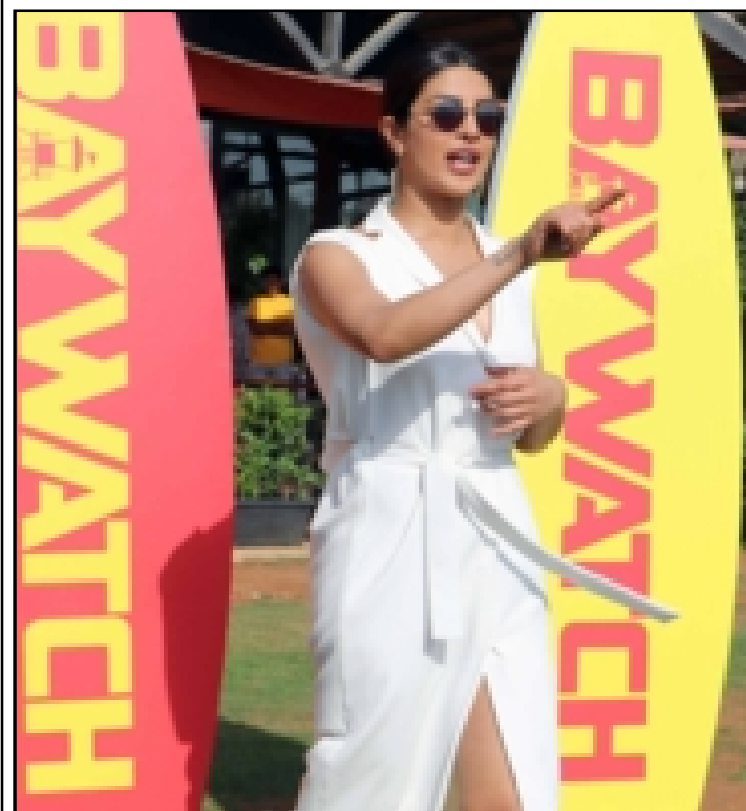
Mumbai, Apr 26 : Bodhbarnü Mumbai nung Priyanka Chopra-i Hollywood film, Baywatch atema osangbener den senden ka amenba mapang tangokba noksa nung angur. 'Baywatch' film ajungkettsü asoshi Priyanka Chopra-i sentong balala ajanga nüburtem den sensaksem alitsü tenzükogo. Lai iba film ajungkettsü asoshi mezüng India nung tenük rangloker tenzüker.