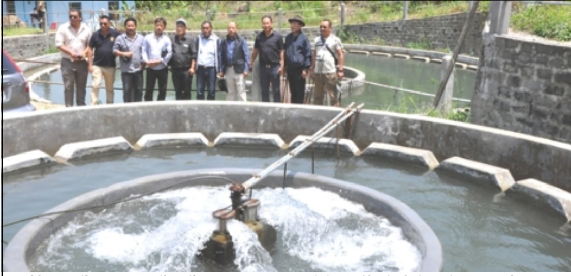
Wokha, April 27, 2017: Brihostibarnü state PHED Minister, Chotisuh Sazo-i Engorotchu ayong nung Wokha town water supply project semdangba mapang tangokba noksa nung angur.

Wokha, April 27 (TYO): Non-Lapsable Central Pool of Resources (NLCPR) project dak sendakba nung tanü PHED Minister, Chotisuh Sazo-i Wokha town water supply project semdanga liasü.