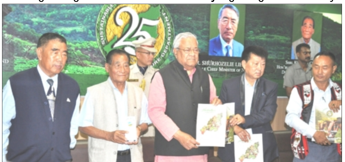
Convention Centre, Kohima nung Horticulture Department kum 25 ajungba Silver Jubilee souvenir sayatsüba sülen state Angh, PB Acharya aser Parliamentary Secretary Kejong Chang den department ketdangsertem külemi tangokba noksa ka angur. (Kohima, April 27, 2017)

Kohima, April 27 (TYO): Brihostibarnü Capital Convention Centre, Kohima nung Horticulture Department kum 25 ajungba Silver Jubilee mung mungogo, aser iba sentong nung tongti tesemdangerji, Nagaland aser Arunachal Pradesh Angh, P.B. Acharya liasü.