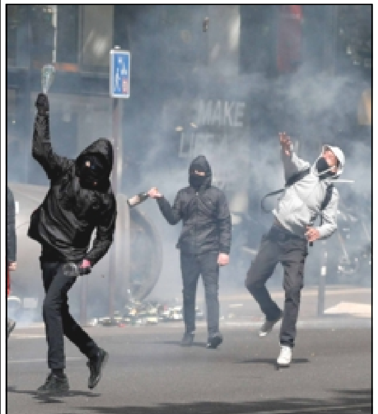
PARIS, APRIL 27, 2017: April 27 nü Paris, France nung Tir election mezüng shilem indang osang angashiba sülen rara adokdang lanurtemi bottle tem mereploksüba noksa nung angur.

2017 nü mim mozü amshia Khan Sheikhoun jila amakba ajanga US-i Syria amakbaji tangar kati pi inyakyim nung teka aitsü merangba lir, ta ashi.