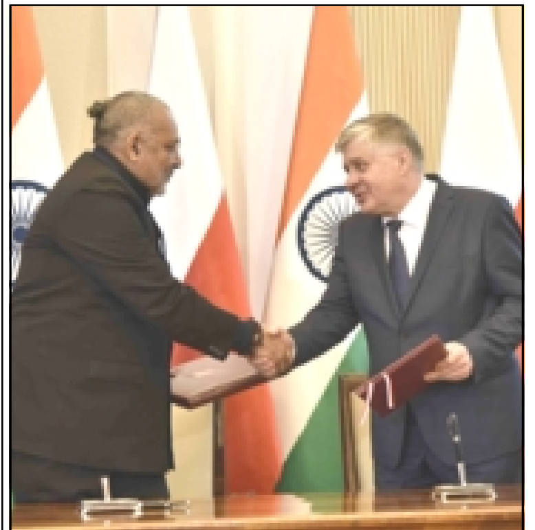
April 27, 2017 nü Poland yimtiba, Warsaw nung India tatong Tir, M. Hamid Ansari aser Poland Ato kilonser, Wt. Beata Szydlo na leniba nung linük ana senden amenba sülen Minister of State for Micro, Small & Medium Enterprises, Giriraj Singh aser Poland Agriculture & Rural Development Minsiter, Krzysztof Jurgiel nati aluyimba nung amalitepa inyaktetsü atema tezüngzükep agiba noksa nung angur.

Lok Sabha nung opposition party tulutiba, Congress züingsem 45 dang lir aser opposition lenir asütsü atema party nung züingsemji menden Lok Sabha menden 545 nungi shilem 10 bo abensatsüla.