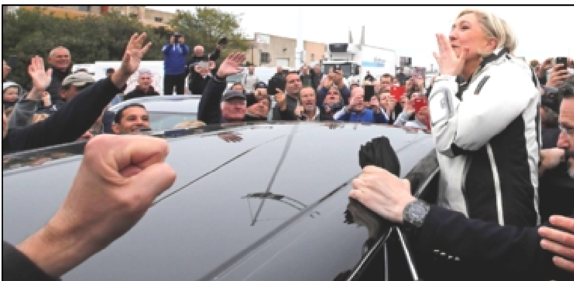
LE GRAU DU ROI, APRIL 27, 2017: Taküm France Tir atema toktepla, French National Front (FN) party nungi candidate, Marine Le Pen-i Grau-du-Roi nung nübuyim sentong agitsü asoshi ango apuba rong ka nung mener mao tsüingda la pusemertem den temeim lemsatepba noksa nung angur.

Tan semdangba mapang Ansari-i ano India nungeri tongti lokti balalatem dena ajuruteptsü sentong lir.