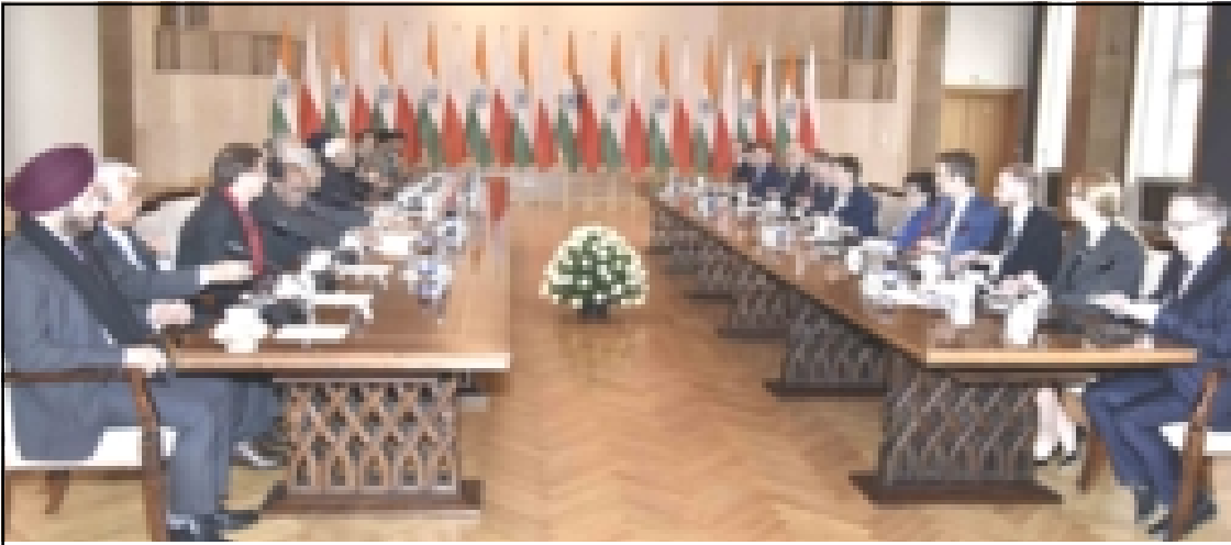
Warsaw, April 27, 2017: Brihostibarnü Poland yimtiba, Warsaw nung India tatong Tir, M. Hamid Ansari aser Poland Ato kilonser, Wt. Beata Szydlo na leniba nung senden amenba noksa nung angur. Kasa noksa nungsa Minister of State for Micro, Small & Medium Enterprises, Giriraj Singh aser Poland Agriculture & Rural Development Minister, Krzysztof Jurgiel nata angur.