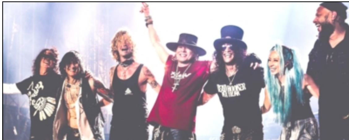
SCG Stadium, Bangkok nung 2017, February 28 nü kentener telok, Guns N' Roses-i kenten sentong atemdang tangokba noksa nung angur.(File photo)

April, 27 2017 (Agencies): Guns N' Roses kentener teloki 'Not In This Lifetime' tour ajanga tang tashi nung sen million $230 aazükogo aser maneni iba kasa sentong taruba ita tenzüksü asoshi renemdar.