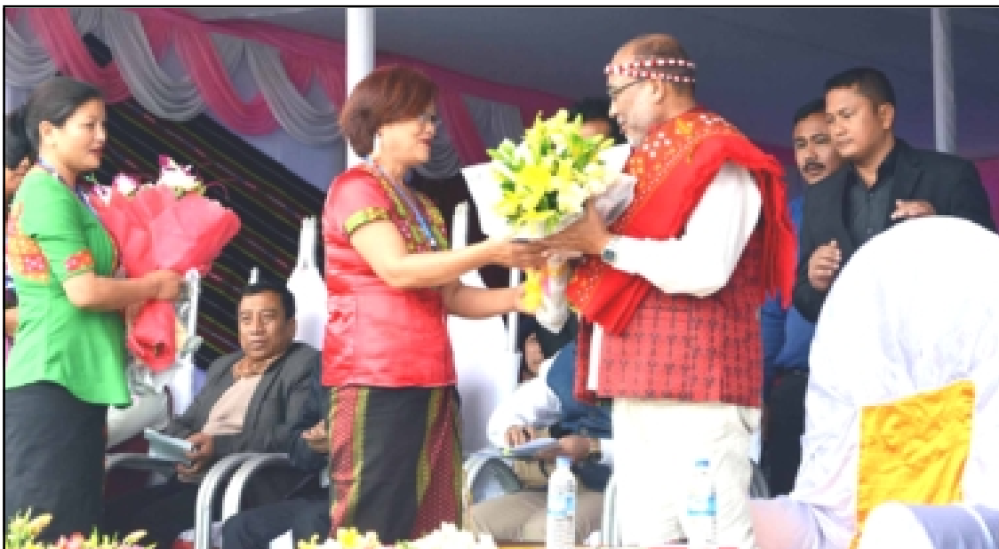
Imphal, April 27 : Tawa district tasen kümtetba Kangpokpi nung Brehostibarnü, District Social Welfare Office aser District Information Office complex lapoktsüdang yimdaklirtemi Manipur Chief Minister, Nongthombam Biren Singh nem tetushi agütsüba mapang tangokba noksa nung angur.