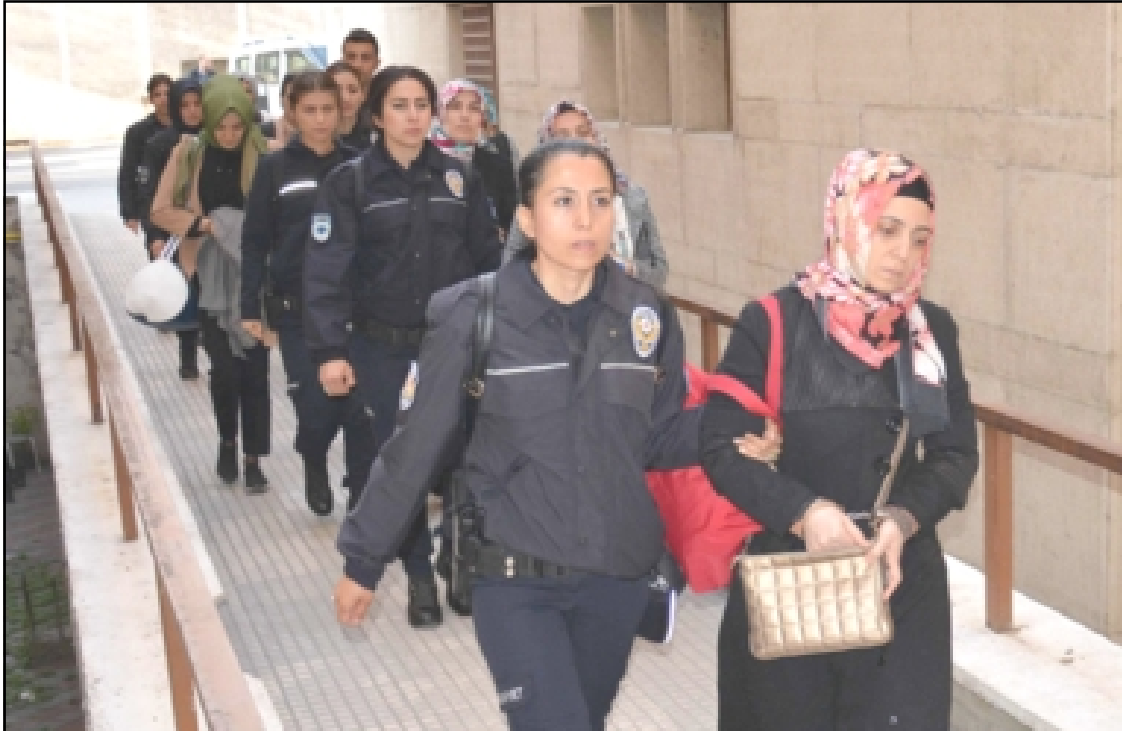
BURSA, APRIL 27, 2017: U.S.- nung aliba cleric Fethullah Gulen, pusemertem ta temulung melemi bilemertem Bursa, Turkey okadak tonga arudang police ketdangsertemi anir aoba noksa nung angur.

Ankara, April 27 (Agencies) : Gulen telok den tesendaktep aliba Turkey nung police 9,000 dak tali mapa nungi anentsüogo.