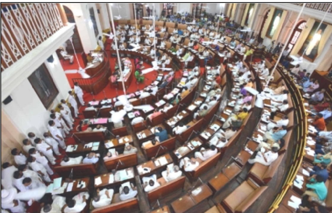
Thiruvananthapuram (Kerala), April 27, 2017: Brihostibarnü Kerala yimtiba, Thiruvananthapuram nung aliba Assembly hall, Secretariat complex nung Kerala MLA tem Kerala Legislative Assembly tenzükür küm 60 ajungba anogomung nung tanü senden amenba noksa nung angur.

New Delhi, April 27 (Agencies): Jammu & Kashmir nung longkak aita long amshirtem azüoktsü atema kobi melii tetsürtemi akumba India Reserve Battalion (IRB) shima mapa lemzüksütsü, ta tanü home ministry ketdangser kati metetdaksü. April 24, 2017 nü Jammu & Kashmir yimtiba, Srinagar yimti kübok Lal Chowk nung tetsür kaketshirtemi sepaitem den raraba tatalokba nung ajemdaker home ministry-i iba telemtetba ya agir. Tetsür temeja battalion ji Centre-i Kashmir atema shimtsü aliba IRB Battalion pongu rongnung ka asütsü. Tetsür temeja battalion nem tensa azüokba mapa lemzüksüba dang masü saka longkak aiterem azüoktsü atemaa mapa lemzüksütsü, ta ketdangserisa ashi. IRB Battalion 5 atema tenüng agütsür candidate 1,40,000 liasü, aser item rongnung candidate 6,000 bo tetsürtem liasü, ibayongji tetsür battalion-a ka shimtsü atema Home Ministry-i telemtetba agiogo. Tanü New Delhi nung Union Home Minister, Rajnath Singh leniba nung temaba jenjang nung senden ka amendang iba onüka süoka jembia liasü. IRB Battalion pongu shimtsü atema maparen tenzükogo aser tenüng agütsür shilem 40 bo Kashmir nungi lir. Tang linük nung India Reserve Battalion 144 lir.