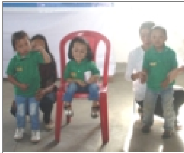
Cure Foundation Mokochung tanurtemi shilem agiba yangi noksa nung angur.