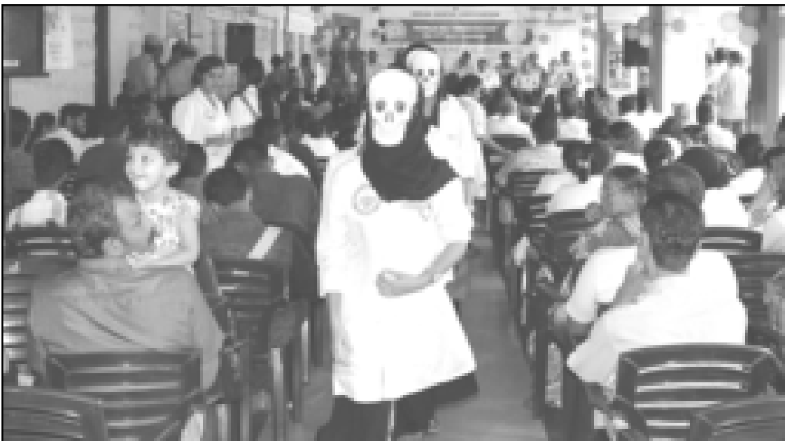
Thiruvananthapuram, May 31, 2017: Bodhbarnü Kerala yimtiba, Thiruvananthapuram nung 'World No Tobacco Day' dak sendakba sentong ka ayonga agiba noksa nung angur.

Mishra minister menden nungi anentsüba sülen anogo ka lir pai, "Jain-i Kejriwal nem par kidang sen crore 2 agütsüba ni nguogo," ta sangdonga liasü.