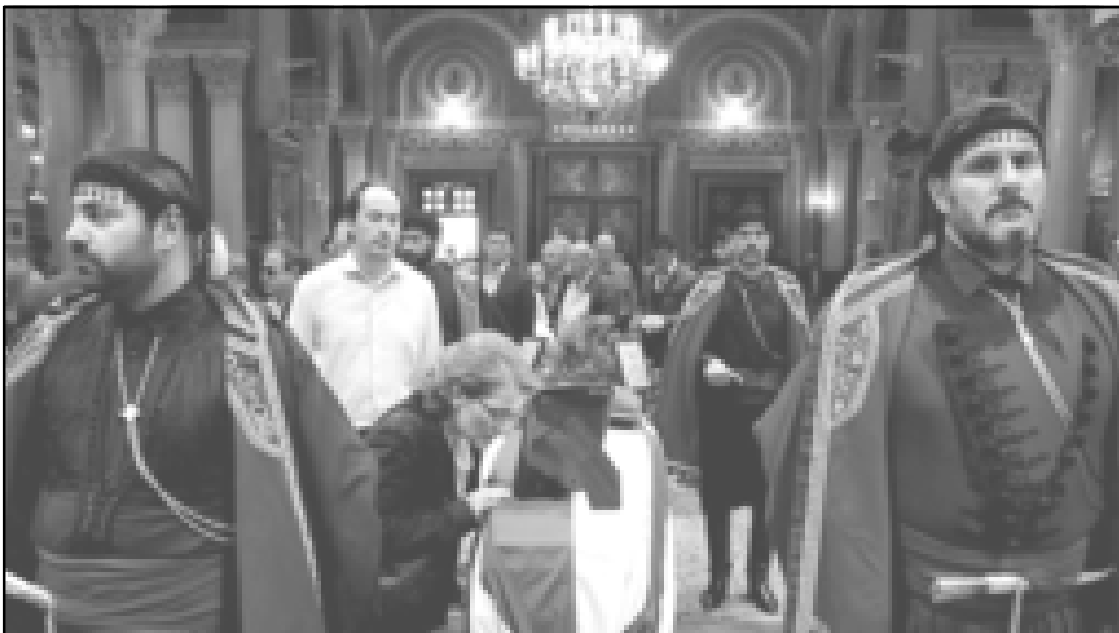
Athens, May 31, 2017: Bodhbarnü Athens, Greece nung aliba Athens Metropolitan Cathedral telung nung tetsür kati taoba Greek Ato kilonser, asür Constantine Mitsotakis tasü mang senden nung asür nem akhüm agütsüba noksa nung angur.

Iba ama longkak aitba ya Imzouren, Rabat aser Casablanca tesemtem nunga liasü.