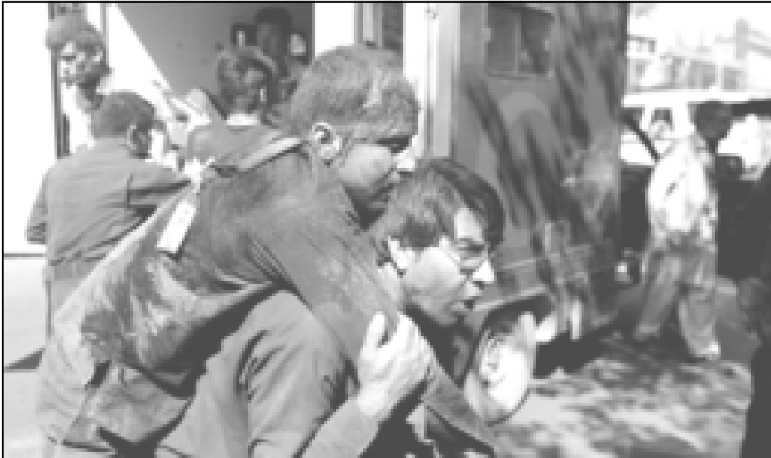
Kabul, May 31, 2017: Bothbarnü Kabul, Afghanistan nung bomb tesashi ka apokba sülen nisun kati yirua alir ka mozükidangi anir aoba noksa nung angur. Tanep Afghan yimtiba, Kabul yimti tiyong nung sewage tanker ka nung miima toktsüba bomb poka liasü, aser iba lendong nung tajemba agi nisung 80 süogo.

Kabul, May 31 (Agencies): Tanep Afghanistan yimtiba, Kabul nung aliba diplomatic zone nung gari nung bomb pokdaksüba ajanga nisung tajemba agi 80 pokset aser 350 yiruogo.