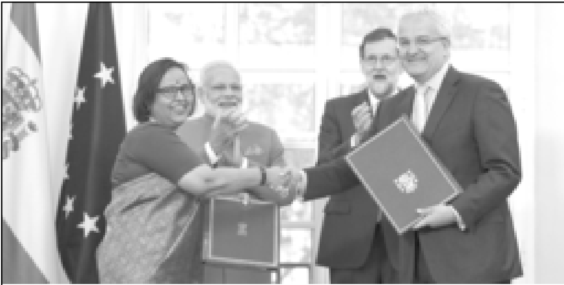
Madrid, May 31, 2017: Bodhbarnü Spain linük yimtiba, Madrid nung aliba La Moncloa Palace nung India Ato kilonser, Narendra Modi aser Spain Tir, Mariano Rajoy nati kulisüa repranga atadang India aser Spain na tsungda tezungzüktep balala agiba noksa nung angur.