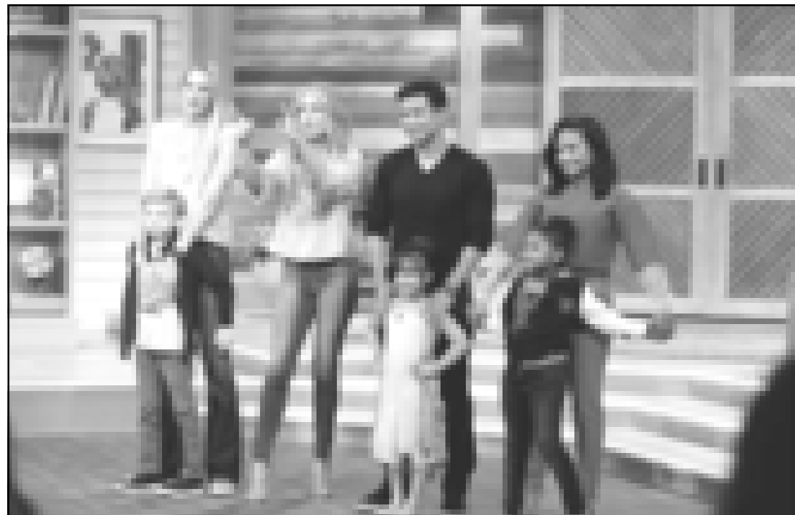
Big Star Little Star - Season 1 tenzükba sentong nung (abelen nungi) Joey Jennings, Kerri Walsh Jennings, Cat Deeley, Mario Lopez, Gia Lopez, Christina Milian aser Violet Milian nungertem külemi agiba noksa angur.

Kaala film ya tang Mumbai nung tetangokdak lir. Iba film nung Rajinikanth, Anjali Patil, Nana Patekar, Samuthirakani aser Sakshi Aggarwal nungeri tongti shilem agir.