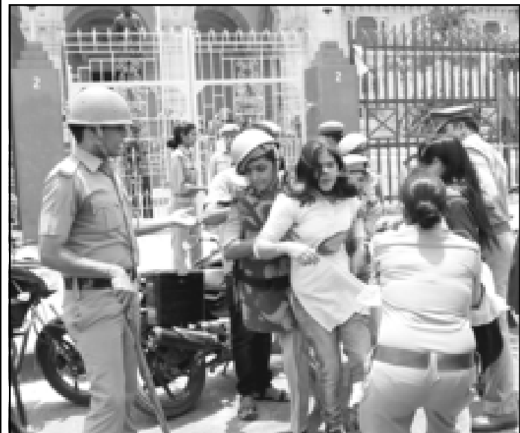
Lucknow, May 31, 2017: Bodhbarnü Lucknow nung Lucknow University nungi Dalit kaketshirtem indang Joint Working Committee zungsemtemi Saharanpur rara anema longkak aيتدang police-i parnok apuba noksa nung angur.

Centre tetuyuba anema yashi Karnataka chief minister, K Siddaramaiah-i, Centre nungi tetuyuba ajakji angatsü menüngdak, ta shiogo.