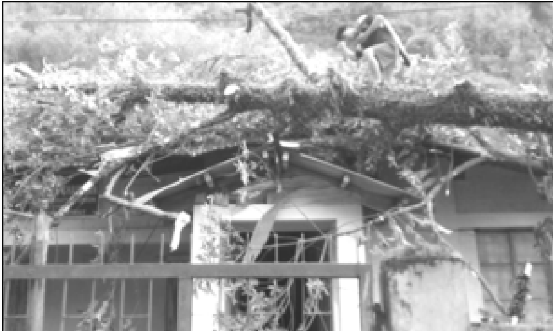
Aizawl, May 31, 2017: Mongolbarnü Mizoram yimtiba, Aizawl nung cyclone Mora ajanga süngdongtem kokzüka alua ki raksatsüba yangi noksa nung angur.

Aizawl, May 31 (Agencies): Cyclone Mora ajanga Mizoram nung Mongolbarnü kongshia liasü aser iba ajanga ki aika raksatsüba den külemi electricity aser telecommunication network tem nung timtem adokdaksüogo.