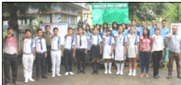
Bodbarnü Christian Higher Secondary School, Dimapur -i alima den tsüngsü medema World No Tobacco Day ayongzüka amung aser iba mapang signature campaign ka agiba den anti-tobacco tezülubattem yutsü. Kasa sentong nung tesayurtem aser kaketshirtemi school campus nung moko anema tenangzükbatem agia liasü. (Dimapur, May 31)