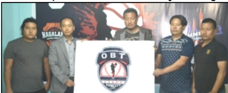
April 29, 2017 nü 9buba Basketball asayamung nung Convener Teisozhavi Theünuo aser Co-convener Medozhatuo Rutsa na den Suncity ketdangsertemi asayamung indang official logo amer tangokba noksa yangi angur.