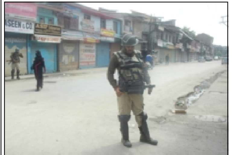
Srinagar, April 30, 2017: Kashmir kübok Kupwara district nung April 27, 2017 nü security sepaitemi injang yokdang nisung ka khasetba anema tanü Deobarnü separatist-i ayongzüka longkak aitba anogo nung Security sepaitemi Srinagar yimti lenmangtem anükba noksa nung angur.

"Tang lanurtem aikati digital currency amshidar, saka ano angazüksü akok. Sen aazüksü atema sorkari nenok nem maangka tulu agütsüogo. BHIM app amshiang aser iba osangji tangar nema metetdakjang aser sen aazükang," ta paisa ashi.