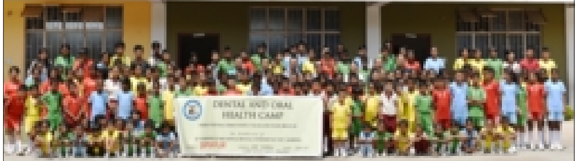
Dimapur, April 30, 2017: April 29, 2017 nü IDANSB [Indian Dental Association Nagaland State Branch] den MMU CECS-i ayonga CEC School, Grace Colony Kuda "C", Dimapur nung "Dental and Oral Health camp" nung tangokba noksa ka angur. Iba sentong nung kaketshir 167 dena dental & oral care teyari agia liasü. Parnokisa dental aser oral hygiene indang lemsatepa liasü.