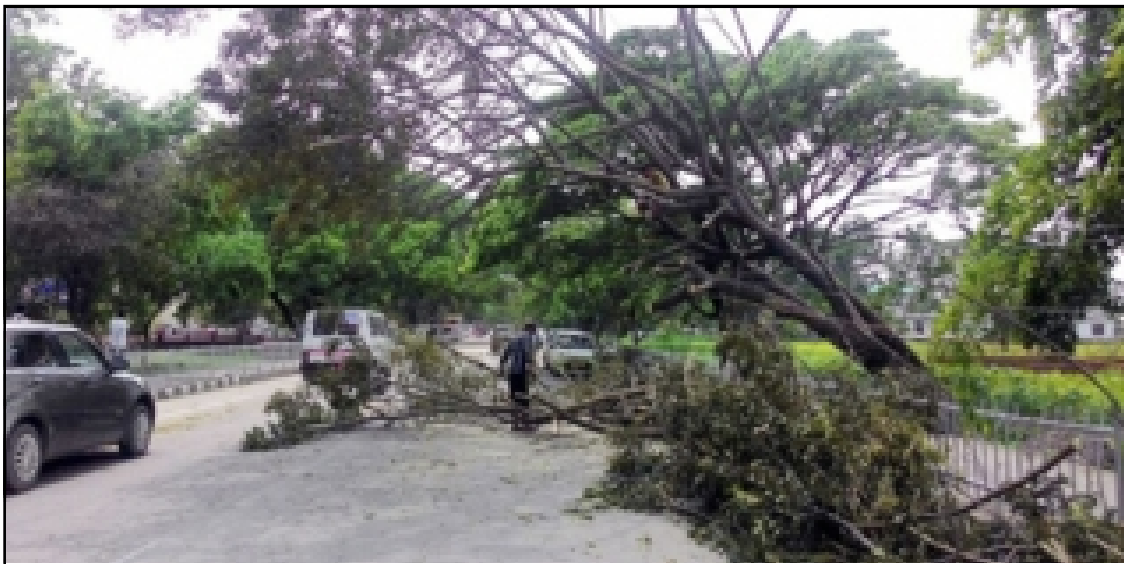
Guwahati, April 30: Guwahati, Assam nung yipru tesashi aruba ajanga Guwahati University anasa süngtong aika tera mükepa laodaktsür aliba noksa nung angur.