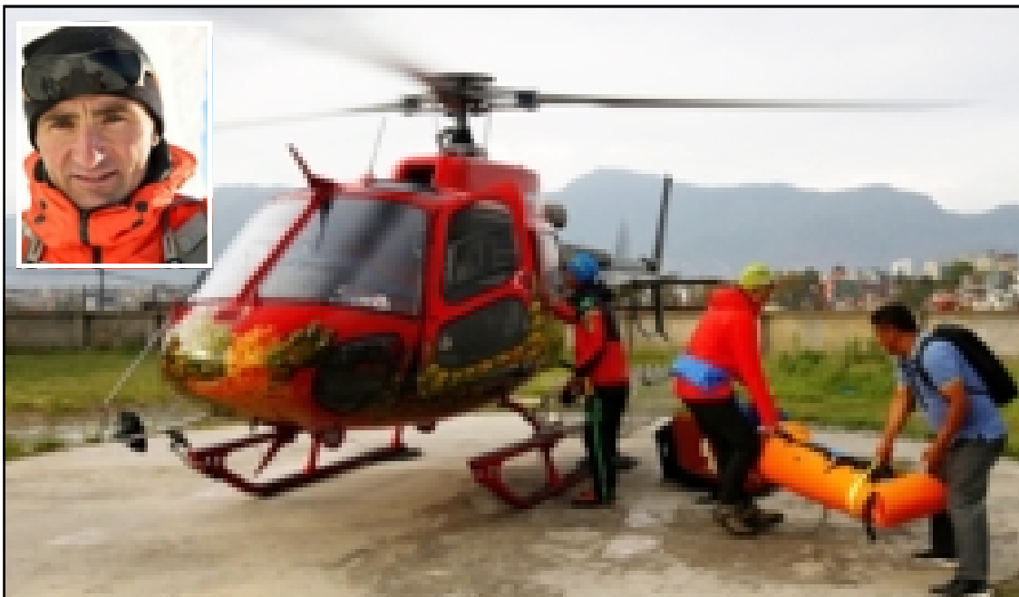
Kathmandu, April 30, 2017 : April 30, 2017 nü Switzerland nunger tenemi atur Ueli Steck tasümang Kathmandu, Nepal nung aliba hospital atongba noksa nung angur. Nübur aikati jangja aliba tenemi atur Switzerland nungba ya tenemi atuba mapang Mount Everest, Nepal anasa lendong ajurua asü. Pa tasümang anguba sülen Mount Everest tesem nung tayimtsü anenba tesem ka dang aliba, Lukla-i bener ao.