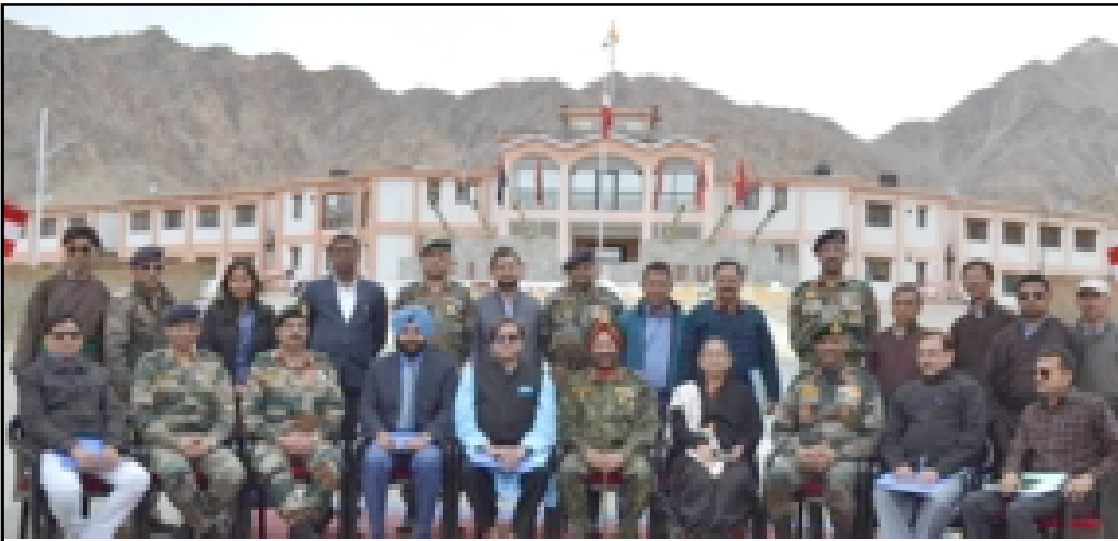
External Affairs indang Parliamentary Committee züngsem pongui Ladakh nung Leh semdangba mapang sepai ketdangsertem den tangokba noksa nung angur. (Ladakh, April 30, 2017)