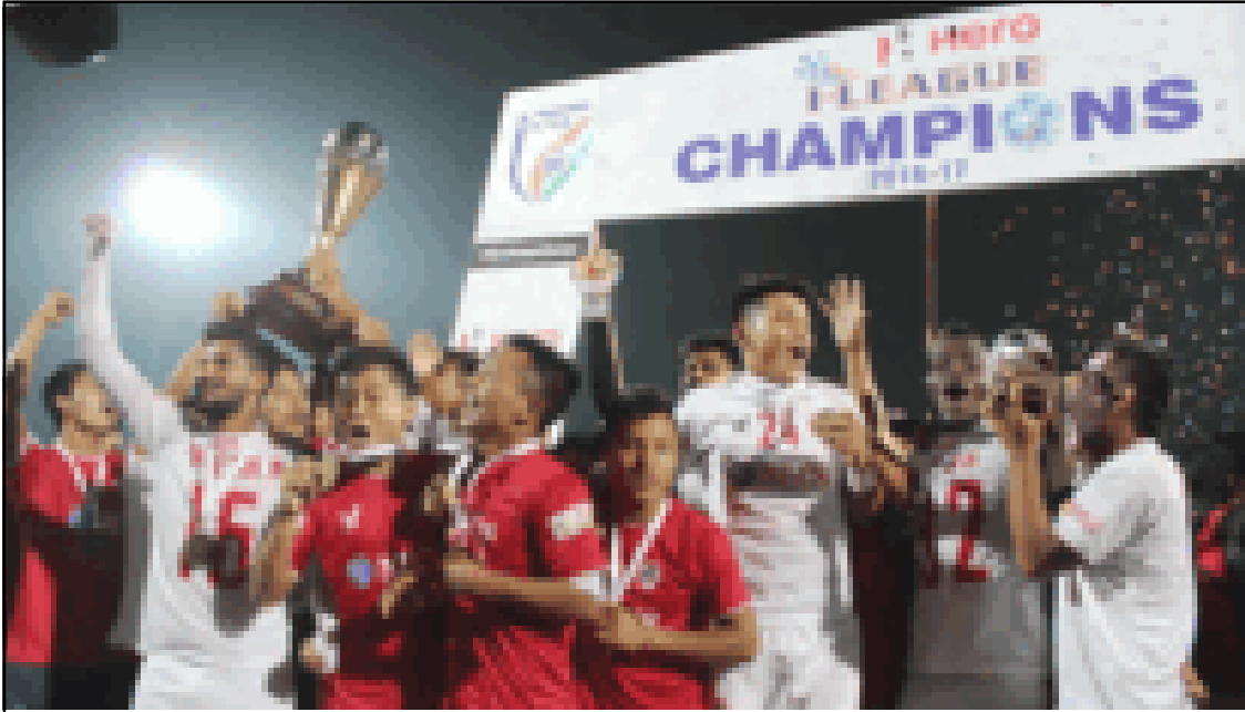
Deobarnü Jawaharlal Nehru Stadium, Shillong nung Mizoram nungi Aizawl FC-i Shillong Lajong den goal 1-1 nguteta asayaba sülen parnoki I-League takok marok amer pelatepba noksa nung angur. North-East nungi national football league mezüing atema takok angurji Aizawl FC lir. Parnoki Kolkata nungi Mohun Bagan ajangteter temaba jenjang angu. (Shillong, April 30)