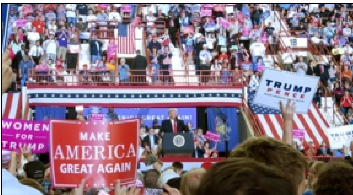
Harrisburg, April 30, 2017 : U.S. President Donald Trump (tiyong)-i pa Tir mendeni tur April 29, 2017 nü anogo 100 ajungnü Harrisburg, Pennsylvania, United States, nung senden ka nung jembiba noksa yangi angur.

"Iba tayimtsüji komaser tsükok ibaji bushisüngdangtsü asoshi Ministry of the Revolutionary Armed Forces nungi telok ka tentetogo," ta sangdong ajangsa ashi.