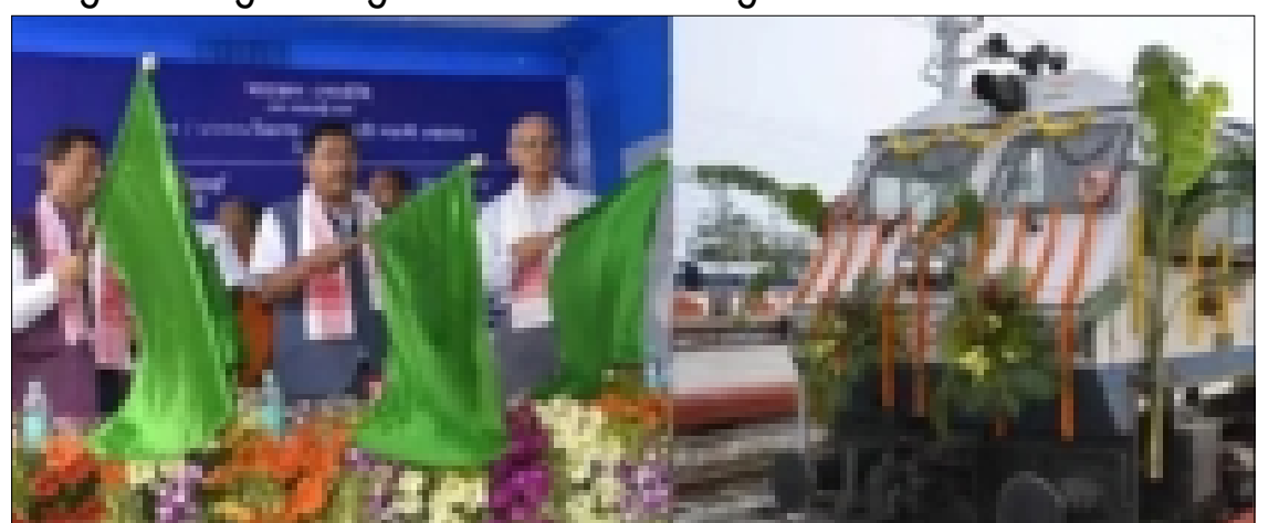
Deobarnep Dibrugarh Railway station nung Minister of State for Railways, Rajen Gohain-i Dibrugarh aser Guwahati tsüngda senzütsü atema Shatabdi Express tenzüksüdang agiba noksa angur. (Dibrugarh, April 30)

Guwahati, April 30 (Agencies): Deobarnü Assam nung tang mezüng Shatabdi Express train ka Minister of State for Railways, Rajen Gohain-i Dibrugarh nungi tenzüksü; iba train, Shatabdi Express (No 12085/12086) ya Dibrugarh aser Guwahati yimti na