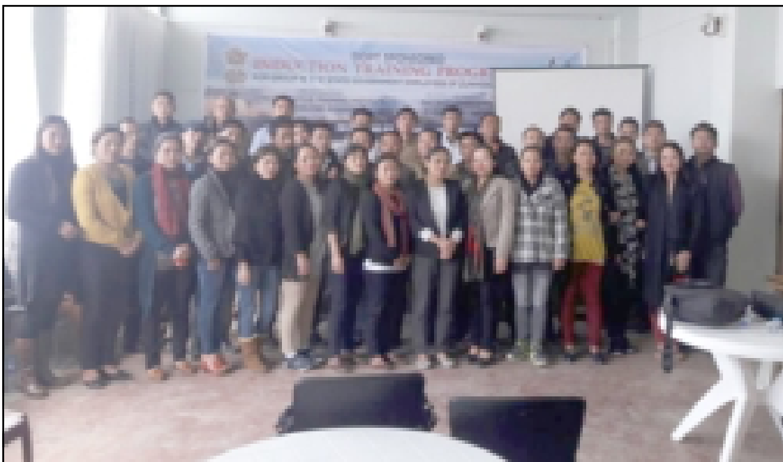
April 29, 2017 nü Zunheboto nung ITP Program valedictory sentong nung Zunheboto ADC, Nungsangmenla Imchen den sorkar mapa inyakerem tangokba noksa nung angur.

April 30 nü DGAR-i Manipur Chief Minister, N Biren Singh-a ajuruogo, aser iba mapang nung pai CM den state dak sentakba tensa aser security onüktem nung o lemtepa liasü.