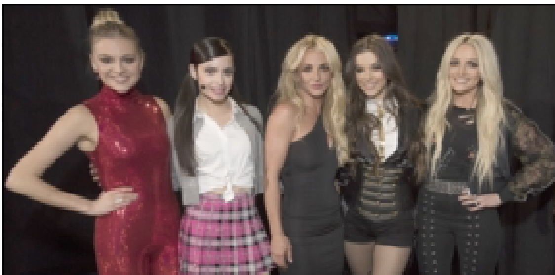
Kelsea Ballerini, Sofia Carson, Britney Spears, Hailee Steinfeld, aser Jamie Lynn Spears

California, April 30 (Agencies): 2017 Radio Disney Music Award sentong Microsoft Theatre, Los Angeles nung agiogo. Iba sempet ya tanurtemi sapuba ken, kentener