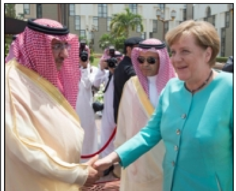
Jeddah, April 30, 2017 : Deobarnü Jeddah, Saudi Arabia nung Saudi Crown Prince Mohammed Bin Nayef-i Germany Chancellor Angela Merkel agizükdang la den salemba noksa nung angur.

Asean telok ya tenteter taküm küm 50buba ajunger.