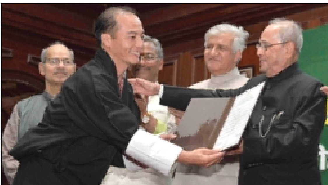
Dehradun (Uttarakhand), May 05, 2017: Hokolbarnü Uttarakhand yimtiba, Dehradun nung Indira Gandhi National Forest Academy (IGNFA) Annual Convocation sentong nung Tir, Pranab Mukherjee-i kaketshirtem nem degree lemstüba noksa nung angur.

Iba election nung Samajwadi Party-i UP assembly menden 403 nungi menden 47 nung dang takok angu.