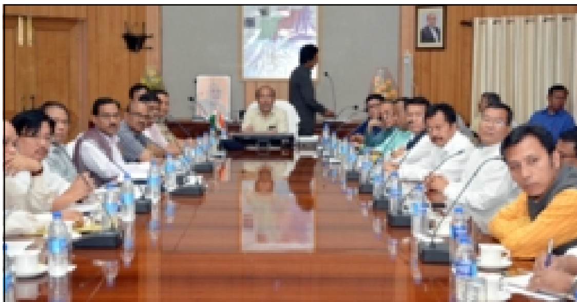
Imphal, May 05, 2017: Hokolbarnü Imphal nung Manipur Chief Minister, Nongthombam Biren Singh (tiyong)-i Tamenglong aser Noney district na nungi Cabinet Minister tem, MLA tem, district ketdangsertem, Heads of departments aser district level ketdangsertem den senden amenba noksa nung angur. Iba senden nung Tamenglong aser Noney district na nung terenlok project balala repringshiba den külemi sorkar department balala nung tashimait onüktem nung o lemtepa liasü.