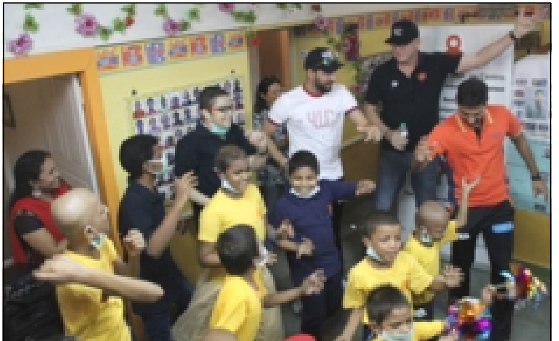
Hyderabad, May 5, 2017 : Hokolbarnü St. Jude India Child Care Centre, Hyderabad nung Sunrisers Hyderabad team züngsemtem Yuvraj Singh, Ashish Nehra, Tom Moody aser V V S Laxman nungeri Cancer tashidak agi kongshir aliba tanurtem den mapang intokba noksa nung angur.