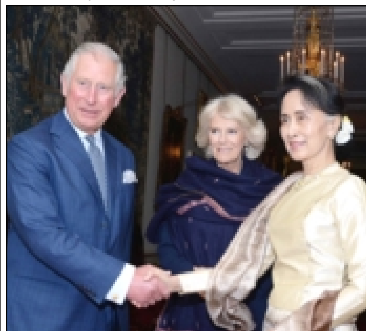
London, May 5, 2017 : Britain Prince Charles aser Duchess of Cornwall, Camilla nati Hokolbarnü Burma nungi lenir Aung San Suu Kyi den Clarence House, London nung ajurutepba noksa nung angur.

Dalai Lama den külempi Tibet nung 140,000 shi linük nungi jena ao aser item rongnungji parnok 100,000 shi India nung jenoka lir. Tibet nung Tibet nung nisung million trok dak tali lir.