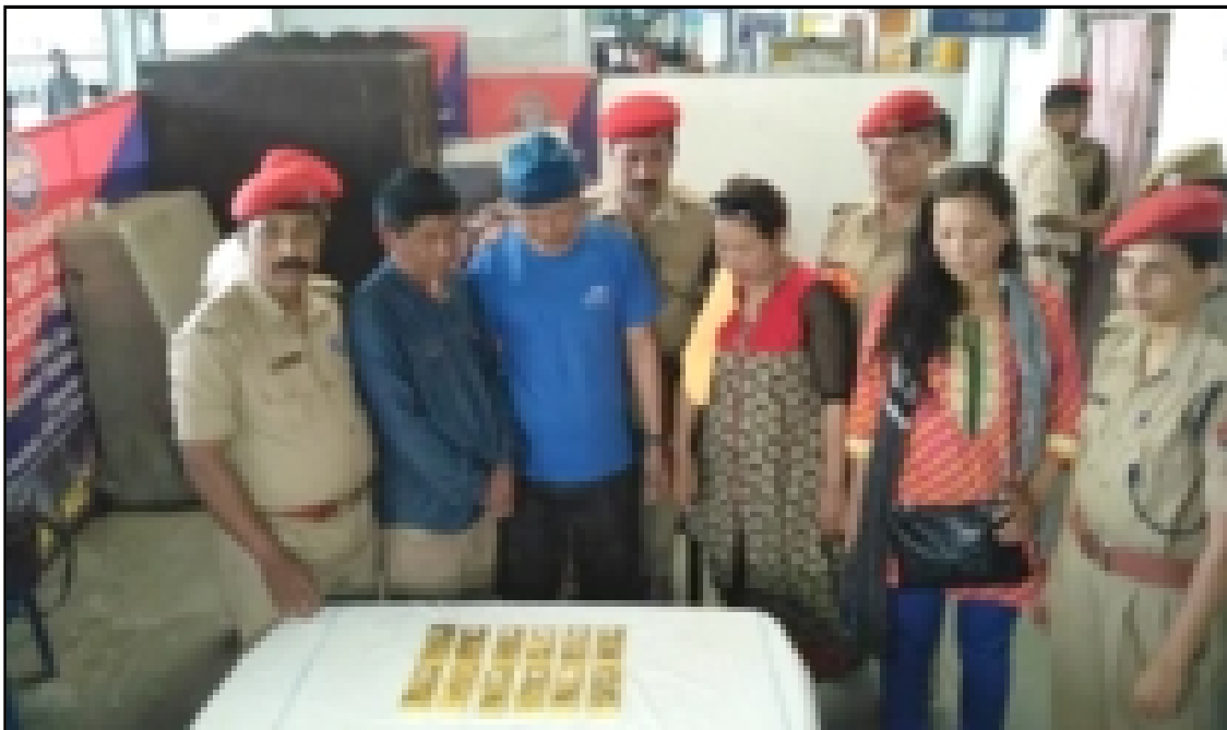
Guwahati, May 05, 2017: Hokolbarnü Guwahati Railway station nung tetsür ana densema nisung pezü ket nungi sen crore 6 shi jenjang hon seret 20 pua aliba noksa nung angur. Honji Myanmar nungi New Delhi-i bener aotsü sentong liasü ta parnok pezüi nangzükogo.