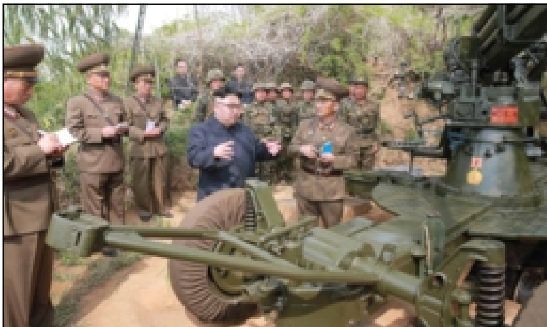
Pyongyang, May 5, 2017: Hokolbarnü North Korea lenir Kim Jong Un-i anüolentip tsütsü aliba tzü anasa Jangjae Islet aser Mu Islet tesemtem nung Hero Defence osettem salaa yokba noksa nung angur.