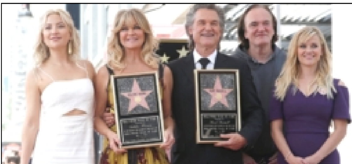
Los Angeles, May 5, 2017 : Brihostibarnü actor Kurt Russell (tiyong) aser actress Goldie Hawn (abelen nungi tanabula) nati Hollywood Walk of Fame, Los Angeles, California U.S nung tenati anguba petinu lapokba sülen speaker tem, Kate Hudson (abelen), Quentin Tarantino aser Reese Witherspoon nunger den tangokba noksa ka angur.

Iba inyakyim ajanga nisung mashi kati online ajanga sen 4,000 agüsür electro-magnetic field emission osang agiteptsü asoshi temelaba agüsütsü.