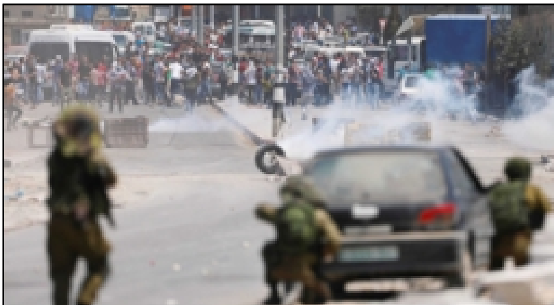
Beita, May 5, 2017 : Hokolbarnü West Bank yim, Beitalrael nung aliba Israel nung tepuokdak Israel sepaitemi Palestine nung tepuokdak alirtem lumia longkak aitba sema longkak aitter Palestine nungertem den raratepba noksa nung angur.

Deobarnü linük Tir election agitsü lia Le Pen aser centrist candidate Emmanuel Macron na Hokolbarnü tatembang buba nübuyim sentong agiba mapang iba longkak aitba atalok.