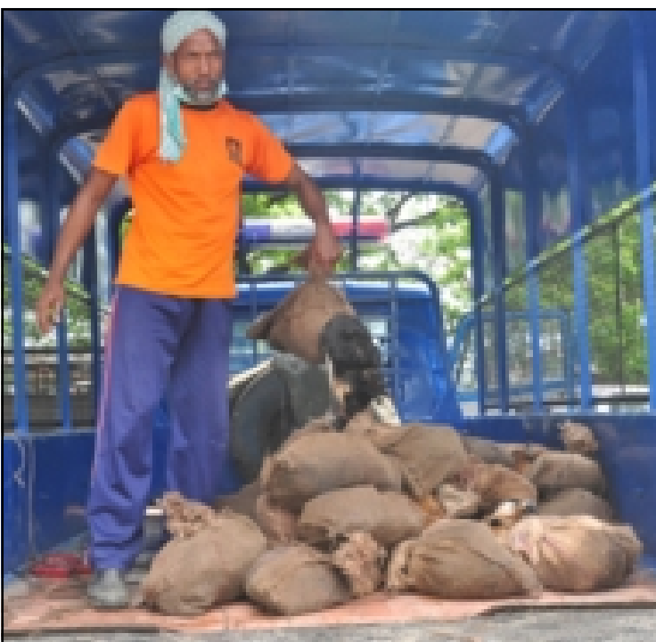
Guwahati, May 05, 2017: Hokolbarnü Guwahati nung aliba PFA Hospital & Shelter Centre nung People for Animals (PFA) züngsemtemi van gari ka nungi azü tasümgangtem oshizükba noksa nung angur. Brihostibar aonung PFA züngsemtem aser Samuguri Police senteper Samuguri, Nagoan district nung azü 70 apu. Item azüji Nagaland-i bener aoba mapang nung apu aser azü 70 rongnungi azü 20 bo süadoker liasü.