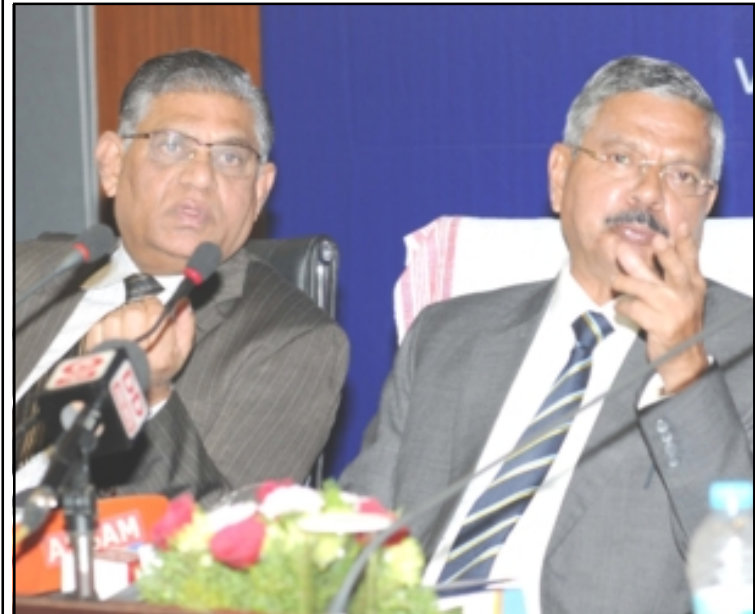
Guwahati, May 18 : Brehostibarnü Guwahati nung National Human Rights Commission nung mendenbuba, Justice H L Dattu, osangbenertem den jembidang tangokba noksa nung angur.

Lalmuankima atema iba ya Delhi-i tanabenbuba arurba liasü. Pa anogo 20 tejakdang khen aru. Pai ashiba agi, item temesep mozütem Delhi-i bener aruba atema pa nem sen 5000 agütsü aser item osettem Nigeria atongba sülen tanüngba 5000 par kinunger nem agütsü.