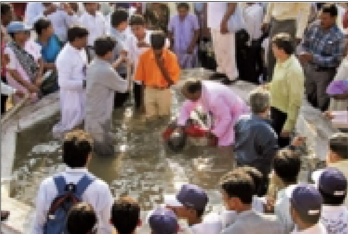
Maharashtra, Nagpur nung Khristian Pastor kati Khristian yimsü dangi meyipertem tzsentsüba noksa nung angur.

Iba senden nung o jembirtem aikati, Africa, Middle East aser Asia nung charity mapatem aika inyakaka anüdoklen aliba Arogotemi maneni sarasadem aser tenla mapa agi yaritsüla, ta ayongzüka liasü.