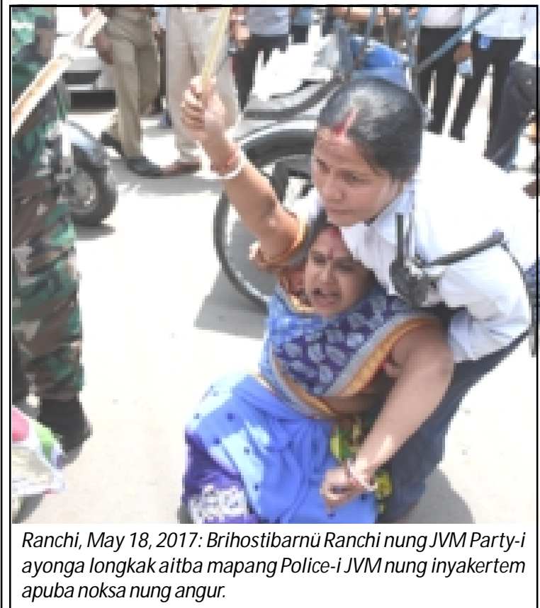
Ranchi, May 18, 2017: Brihostibarnü Ranchi nung JVM Party-i ayonga longkak aitba mapang Police-i JVM nung inyakertem apuba noksa nung angur.

GST ya linük saru ka lir aser ibaji goods mesüra service balala nung agitsü. 1954 küm France linüki mezüng GST ya mapa küma inyaka liasü. Iba sülen Germany, Italy, UK, South Korea, Japan, Canada aser Australia densema linük 12 dak temai GST ya mapa küma inyakdar, aser India-a item linüktem rongnung densemstü. 1994 küm China-i aser 1991 küm Russia-i GST mapa küma tenzüka liasü. Ano Saudi Arabia-ia sangküm nungi GST mapa küma tenzüksü sentong lir.