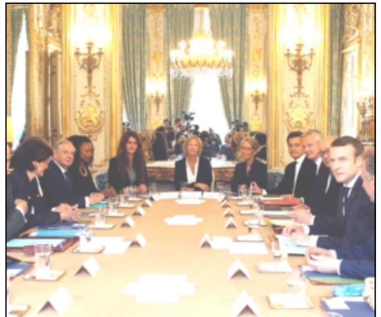
Paris, May 18 : Paris nung aliba Elysee Palace nung 2017, May 18 anogo France tir, Emmanuel Macron (achichilen tanabuba), aser Ato Kelonser, Edouard Philippe (abelen) den tang minister tasen shimteta alirtem mezüng cabinet senden amenba mapang tangokba noksa nung angur.