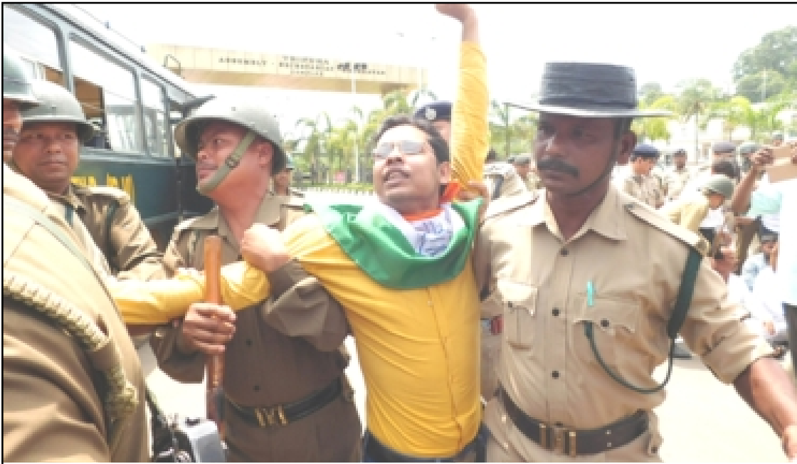
Agartala, May 18 : Brehostibarnü Agartala nung Congress puri parnok indang 12 point charter khanga ghonda 24 Tripura mokdangba mapang, police temi Congress nung züngsemtem pur aoba noksa nung angur.