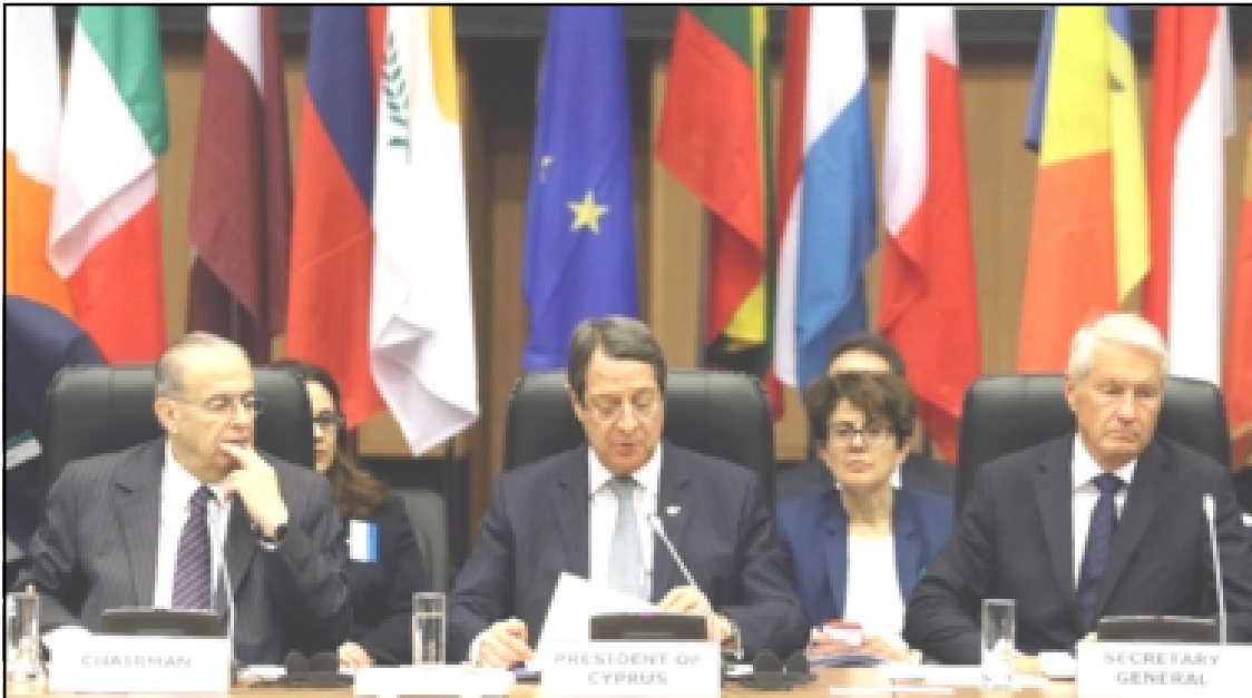
Nicosia, Cyprus nung Council of Europe nung Committee of Ministers senden ka amendang Cypriot President Nicos Anastasiades (tiyongtsü), Council of Europe Secretary General Thorbjørn Jagland (achiji) aser Cypriot Foreign Minister Ioannis Kasoulides nungertem külemi agiba noksa ka angur. (Nicosia, May 19)