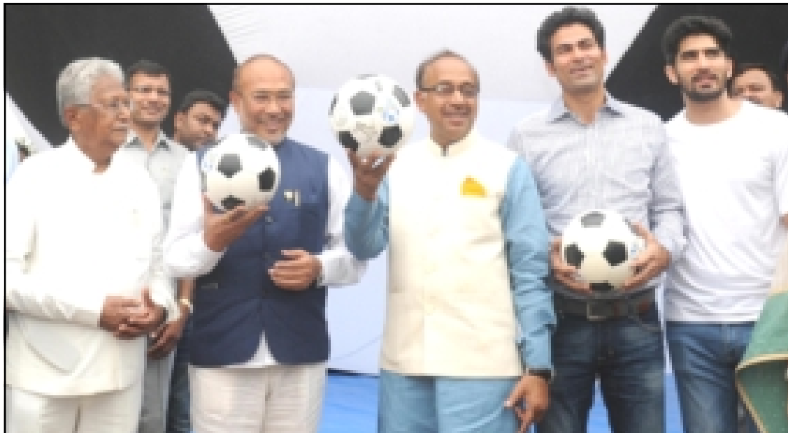
New Delhi, May 19 : Hokulbarnü Inner Circle of Cannauh Place, New Delhi nung Minister of State for Youth Affairs & Sports (I/C), Water Resources, River Development & Ganga Rejuvenation, Vijay Goel aser Manipur Chief Minister, N Biren Singh nunger temi FIFA Under-17 World Cup ajungkettsü asoshi Football Balloon sayaba mapang tangokba noksa nung angur.