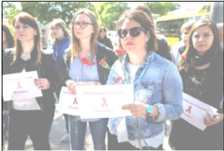
Kiev, May 19: 2017, May 19 anogo Kiev, Ukraine nung International AIDS Memorial Day amongdang AIDS tashidak agi asür tenüing nung nüngshilong ka yanglua aliba anasa nüburtemi parnok asürtem bilemteta shilem agidang tangokba noksa nung angur.

London City Airport indang digital tower feet 164 talang ya 2019 nung lapoktsü sentong lir.