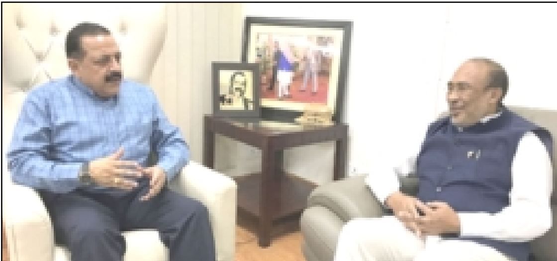
New Delhi, May 19, 2017: Hokolbarnü New Delhi nung Manipur Chief Minister, N. Biren Singh-i Minister of State for Development of North Eastern Region (I/C), Prime Minister's Office, Personnel, Public Grievances & Pensions, Atomic Energy & Space, Dr. Jitendra Singh ajurua senden amenba noksa nung angur.