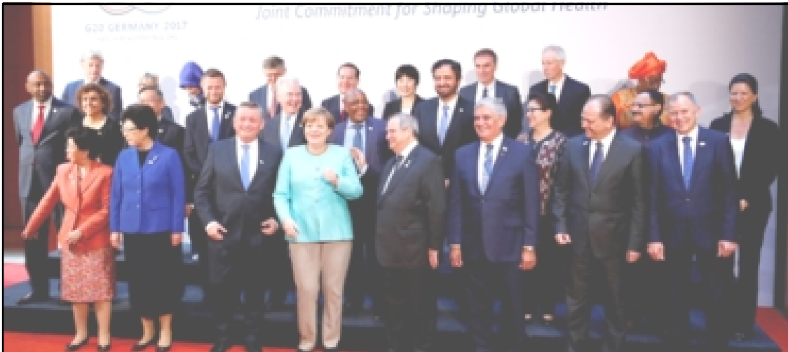
May 19, 2017 nü Germany yimtiba Berlin nung G20 health minister tem senden nung German Chancellor Angela Merkel külemi agiba noksa ka angur.

Tesüiba küm 10 tsüngda Sudan nung mepetmesü adoka rara nung nisung 300,000 shi taküm samaogo, ta UN-i asadangtetba osang ka metetdaksüogo.