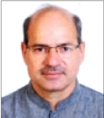
Anil Madhav Dave (file)

ajungbena asüba osang angashia kanga aoksar, ta Nagaland aser Arunachal Pradesh Angh, PB Acharya-i sangdong ka nung metetdaksü.