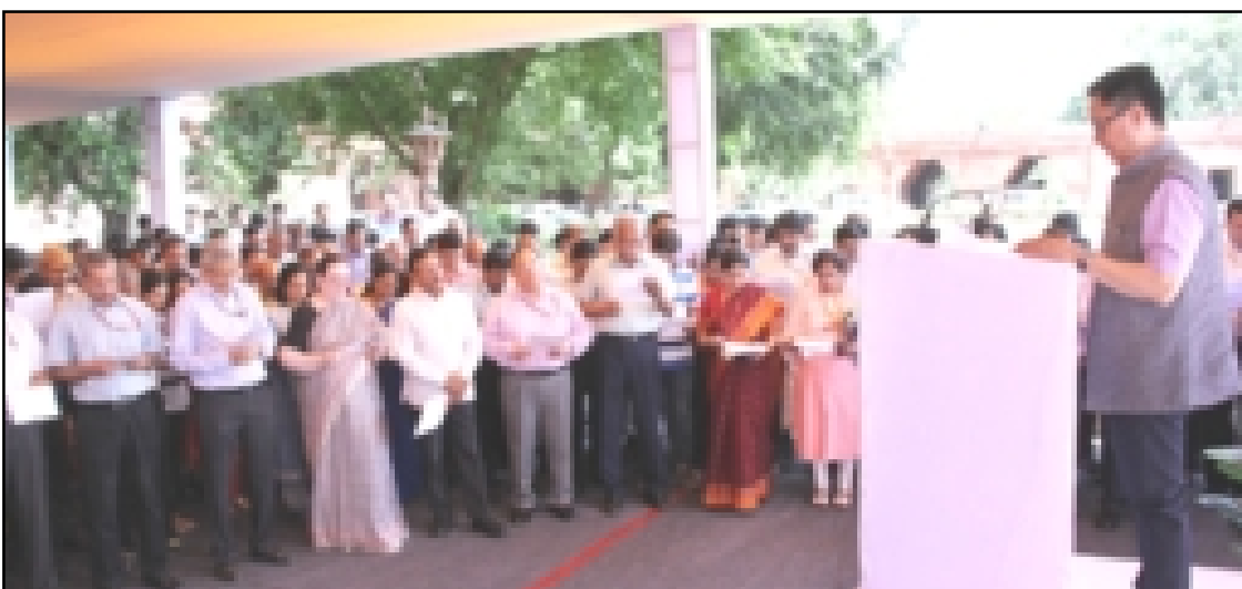
New Delhi, May 19, 2017: Anti-Terrorism Day atongtsü (May 21) anogo ana nung lia Hokolbarnü New Delhi nung Minister of State for Home Affairs, Kiren Rijju-i ketdangsa Ministry of Home Affairs aser Dept of Personnel & Training ketdangsertem aser staff tem tenangzükba agidaksüba noksa nung angur.

Cricket asayar nungtugu, Tendulkar ya pa taküm otsü nung ajemdaker yangluba film "Sachin: A Billion Dreams" ajungkettsütsü atema New Delhi-i arua lir.