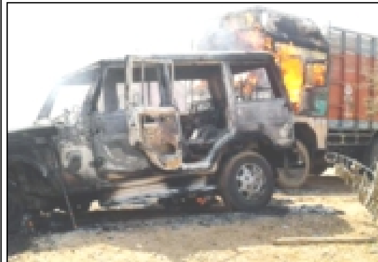
Ranchi (Jharkhand), May 19, 2017: Hokolbarnü Jharkhand nung auer teloki nisung asem khasetba sülen Garhwa district kübok Bishunpura tesem nung alirtemi tejashi nung garitem rongdoktsüba noksa nung angur.

EC-i mepishiba nung ajemdaker Union Cabinet-i VVPATs lakh 16 alitsü atema sen crore 3,200 jungnüa lemozüksüogo.