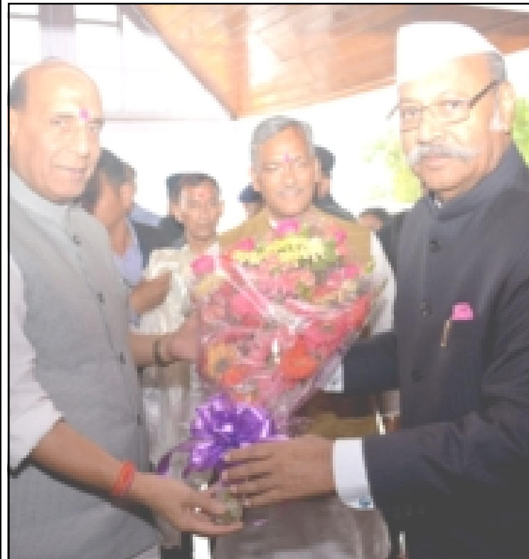
Gangtok (Sikkim), May 19, 2017: Hokolbarnü Gangtok nung Sikkim Angh, Shrinivas Patil-i Union Home Minister, Rajnath Singh agizükba noksa nung angur. Union Home Minister-i anogo asemnü atema Sikkim semdang, aser iba mapang nung pai India-China arrtsülen aliba state pongu- Jammu & Kashmir, Himachal Pradesh, Uttarakhand, Sikkim aser Arunachal Pradesh state tem nungi Chief Minister tem ayonga senden ka mena India-China arrtsü dak sendakba onüktem lemteptsü. Kasa senden nung Border Area Development Programme aser state tem o ITBP tsüngda amalitepa inyakba onüktema jembitsü.

Tain ita kisüng nung telungpurtemi mitkartem dak amakba ya tain aki tanaben lir. May 9 nunga telungpur temi IED ka bokdaktsüba mapang Territorial Army (TA) ana bokset. Territorial Army-tem ya Tengenoupal district kübok Lokchao tesem nung lenmang lapoka duty aoba mapang iba lendong ataloka liasü.