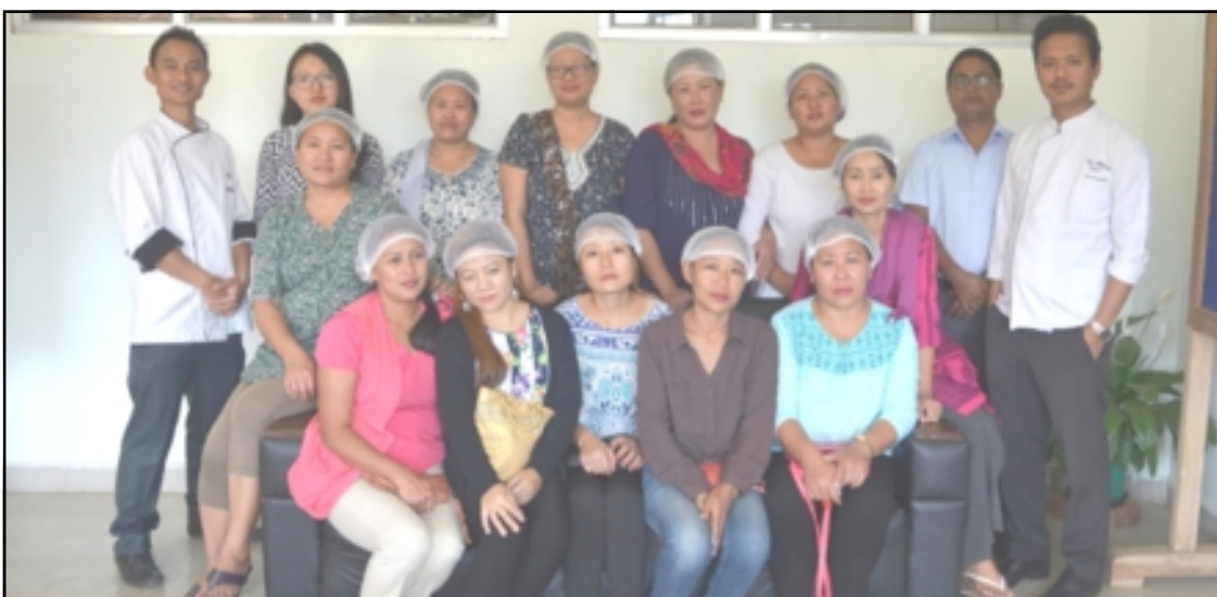
Dimapur, May 19, 2017: Department of Hotel Management, The Global Open University, Nagaland-i Sodzulhou Village, Dimapur atema "Art of Cooking" indang anogo ka workshop ayonga katsüba sentong nung shilem agirtem aser tesayurtem külemi tangokba noksa nung angur.