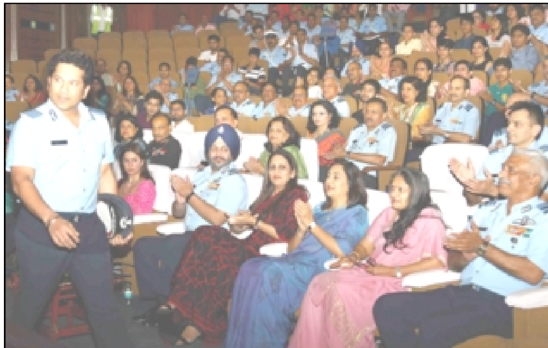
New Delhi nung aliba Air Force Auditorium Subroto Park nung 'Sachin a Billion Dreams' film sayaba sentong nung nisungtemi Group Captain (Hony) Sachin Tendulkar pela agizükba noksa nung angur.

Jackman-i iba shilem agitsü asoshi shimtetba telemtetba asoshi nüburtemi pelaa bilemetsüla. Tangbo iba shilem tangar kari agira kanga balaka bilemetsü.