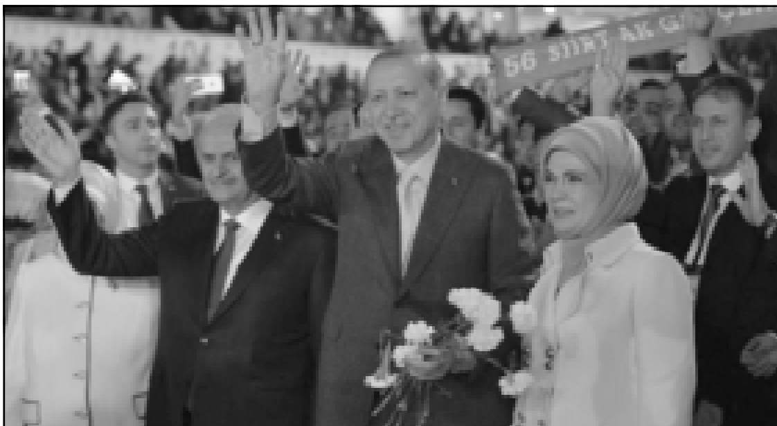
May 21, 2017 nü Ankara, Turkey nung AKP pur Extraordinary Congress nung Turkey President Tayyip Erdogan(tiyongtsü), den pa kinungtsü Emine Erdogan aser Prime Minister Binali Yildirim nungertemi party züngsemtem dak teka ayiploksüba noksa nung angur. Deobarnü President Erdogan-i linük nung yimjung aser tesünep tensa maru tashi emergency magientsü ta metetdaksü. Yaküm July 20 nü sorkar atsüngdoktsü merangba sülen Turkey nung emergency alitsü tetuyuba agütsü aser taküm April 18 nü parliament-i emergency ita asem tashi atsülangtsü telemtetba agi. (Ankara, May 21)

Yaküm Panama Papers miim osang temai adokba nung Sharif'er tanurtemi British Virgin Islands nung aliba company tem den London nung kiojen aliba indang shia liasü aser iba sülen okadak Sharif anema ken o ya benok.