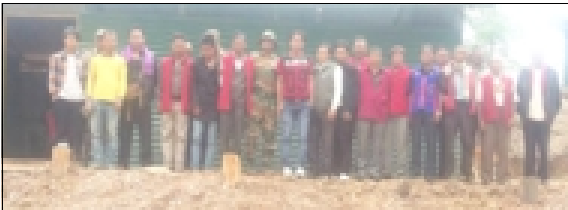
Dimapur, May 21, 2017: May 18, 2017 nu HQ IGAR (North) kübok 22 Assam Rifles-i Akhen yimdak Area of Responsibility (AOR) kübok yimtsung balala nungi GBs, Chairman, Student Union aser Secretary tem den shisalemsatepba sentong agiba mapang nung tangokba noksa nung angur. Iba senden nung tesem nung tesunep alitsü atema lisopurtem aser Assam Rifles tsungda ano taliba amalitepa inyaksü asoshi jembia liasü.