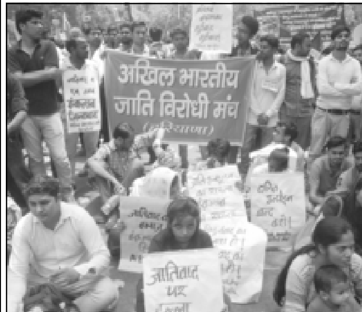
New Delhi, May 21, 2017: Saharanpur nung Dalit nung anema inyaba tali buluba anema Deobarnū New Delhi nung Dalit nung loki tentetemi mener longkak aitba noksa nung angur.

Narendra Modi'er sorkar kum asem abensatsū anogo ishika dang lia Shah-i, sorkari nūburtem tamang koktetogo aser sensakertemia sorkari parnok takūm jenjang ajungtsū atema inyaker ta amanger, ta ashi.