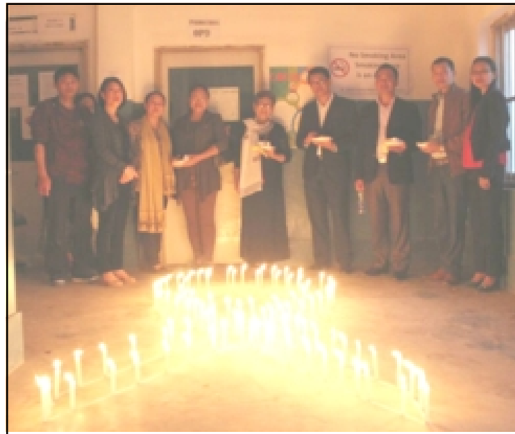
May 21, 2017 nü NHAK, Kohima nung International AIDS Candlelight memorial sentong alidang tangokba noksa nung angur.

Parnok anema benshiba aser sendokba ajanga PLHIV aikati treatment agitsü atema tejakleni marur. Kodang HIV positive nisung kati ART (anti retroviral therapy) treatment agi tenzükdir pa/la temang anema litettsü, aser