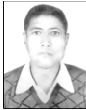
Oba tanü na onok den meliaka na onok molungjang nung teti lir.

- Temeim Oja, Tanurtem, Semchirtem, & Kinungertem.