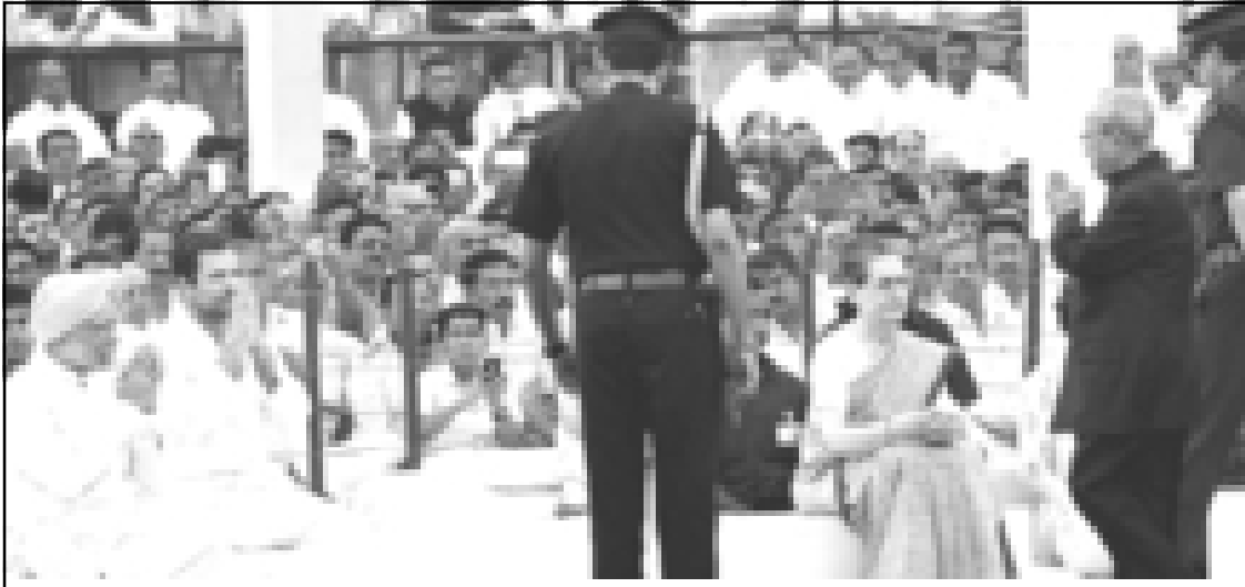
May 21, 2017 nū New Delhi nung Tir, Pranab Mukherjee-i taoba mapang Ato kilonser, Rajiv Gandhi sūr kum 26 ajungba anogomung nung asūr nem akhūm agūtsūsū atema asūr memorial 'Vir Bhumi'-i aruba noksa nung angur. Kasa noksa nung taoba Ato kilonser, Manmohan Singh, Congress Tir, Sonia Gandhi aser lar jabaso, Rahul Gandhi nung-a angur.