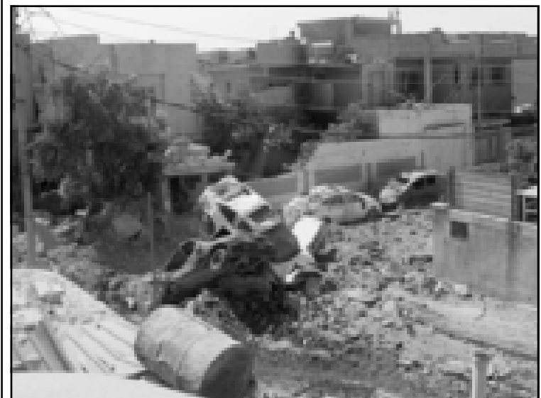
May 21, 2017 nü Iraq kübok Mosul nung Iraq sepaitem aser Islamic State kiralongrartem tsungda khatepdang yimdong nung garitem raksar aliba noksa nung angur. (Mosul, May 21)

Yaküm November ita nunga Duterte-i, "Philippines-i US dang nungibo Russia aser China denang amaliteptsü bilemer" ta aser saka pai US Tir, Donald Trump den amalitep malitsü indangbo mejembi.