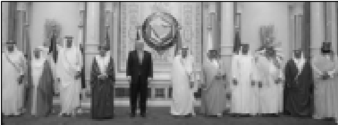
Deobarnü Riyadh nung US Tir, Donald Trump-i Arab aser Muslim lennirtem den külemi agiba noksa ka angur.

Riyadh, May 21 (Agencies): Deobarnü US President Donald Trump-i Middle East nung lennirtem dang 'Islamic extremism' anema raratsü ayongzük aser pai ashiba agi, kiralongraba anema rara ya West aser Islam tsungda masü saka tajung aser tamajung tsungda rara ka lir ta metetdaksü.