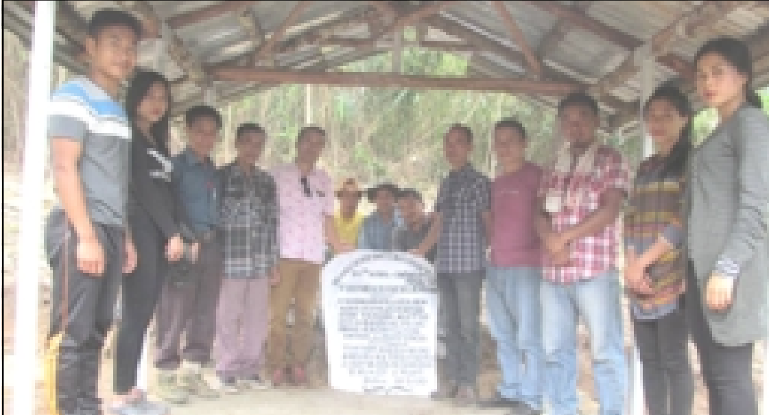
Mokokchung, May 21, 2017: Mongsenyimti Kaketshir Telongjem (MKT) tenteter kum 75 abensaba Jubilee mung atema renemshia ataba nungtem nung akhidang tsurabur arem nung aliba mapang Tsungrem kulemba tesem nung anisungzuk semtu ka yanglutsuba May 20 nu lapoktsudang Yimtiba aser Compound Arogo ana nungi sannuker ana, Youth director aser MKT ketdangpurtem kulemi tangokba noksa nung angur.

Mokokchung, May 21 (TYO): Mongsenyimti Kaketshir Telongjem (MKT) tenteter aruba takum December nung kum 75 ajungba Jubilee mung amungtsu nukla yur inyaka arudar aser MKT-i Jubilee nungtem nung akhidang tsurabur arem nung alidang Tsungrem kulemba tesem nung anisungzuk semtu ka yanglutsuba May 20, 2017 nu semzükogo.