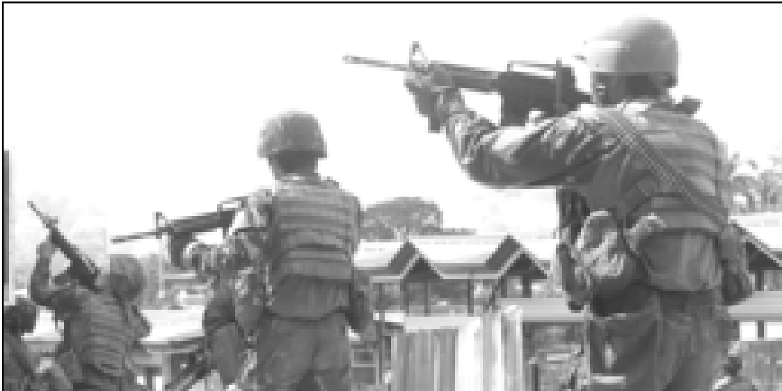
2017, May 25 anogo Armed Forces of the Philippines (AFP) nisungtem Lanao Del Sur Province nung Maute telungpur den raratsü arudang tangokba noksa nung angur. South Philippine yimti, Marawi nung Maute telungpur 40 jungnüa atsüka aliba meindoktsü asoshi Philippine mitkartemi Brehostibarnü mita bushia liasü, ta mitkar osang ajanga ashi.

densema nisung ti pua lir. Iba ken o nung tetsür-a ka apu saka la bo chiokogo. England chubatsür-i Royal Manchester Children's Hospital semdanga iba mozüki nung yirur alirtem aser ketdangsertem ajuruogo. Manchester Arena nung Ariana Grande-i concert agütsüba temli iba concert reprangi arurtem pei kidangi meyiba aoba mapang Abedi-i 'nuts & bolts' bomb ya pokdaksü. Tsüraburtem aser kinungertem iba concert reprangi oa aliba tanurtem ataa lia iba bomb apok aser iba lendong nung nisung 22 asü aser 116 yirua liasü.