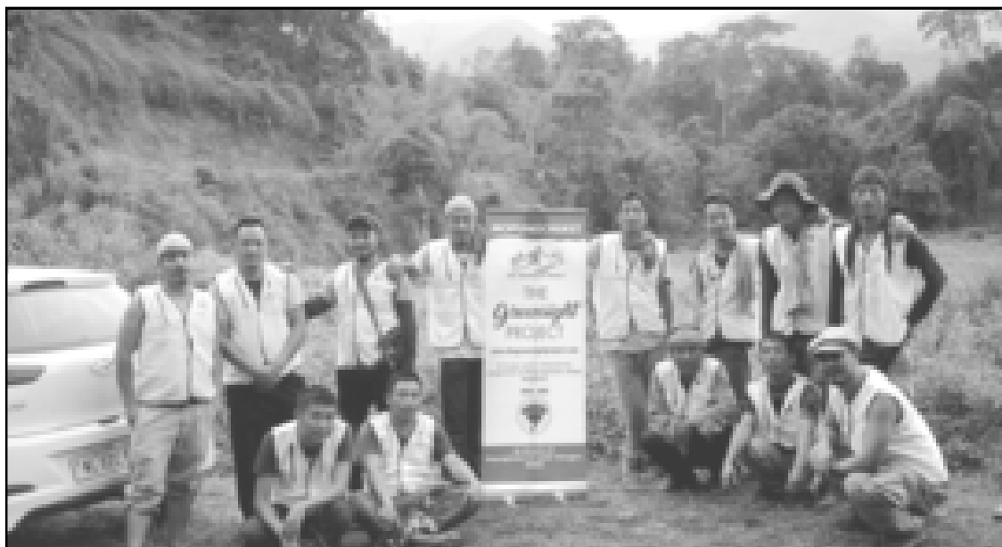
Mokokchung, May 25, 2017: Brihostibarnü The Greensight Project züngsemtemi Mokokchung district kübok Mopungchuket-Milak lenmang nung 'ornamental' süngdongtem temtsüba sülen tangokba noksa nung angur. Parnoki maple aser royal poinciana süngdongtem den sobaliba arem süngjanglijang süngdongtem temja liasü. Parnokisa yaküm temtsüba süngdongtem melenba den külemi süngdongtem anepalua azüa yutsü. The Greensight Project ya küm pongu scenic enhancement programme ka lir aser iba ya 2016 küm July ita nung Mopung kaketshir telongjem, Mopungchuket Ait Laishir Telongjem (MALT)-i achaayanga tenzük. Kilometer 11 lenmang ya tepor junga yanglutsü nükjidong nung MALT-i iba project tenzüka liasü.

Nüburtemi amalitepa inyaktsü imlar, iba den külemi ozüng alema inyakba garitemji police-i atsüer aotsü aser gari kiburtemi senchi agütsütsüsa akümtsü, ta kasa sangdong ajangasa metetdaksü.