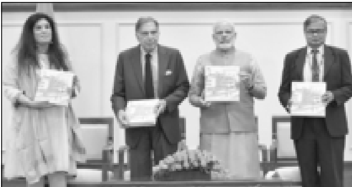
New Delhi, May 25, 2017: Brihostibarnü New Delhi nung Ato kilonser, Narendra Modi-i Tata Memorial Centre indang Platinum Jubilee Milestone kakat sayatsüba noksa nung angur. Kasa noksa nungsa Ratan Tata den tongtibang nisungtema kar angur.

Yakünü Indian Army temi Line of Control nung Pakistan nung positions maaka liasü, aser iba dak sendakba nung tanü Union Minister-i iba o ya jembio.