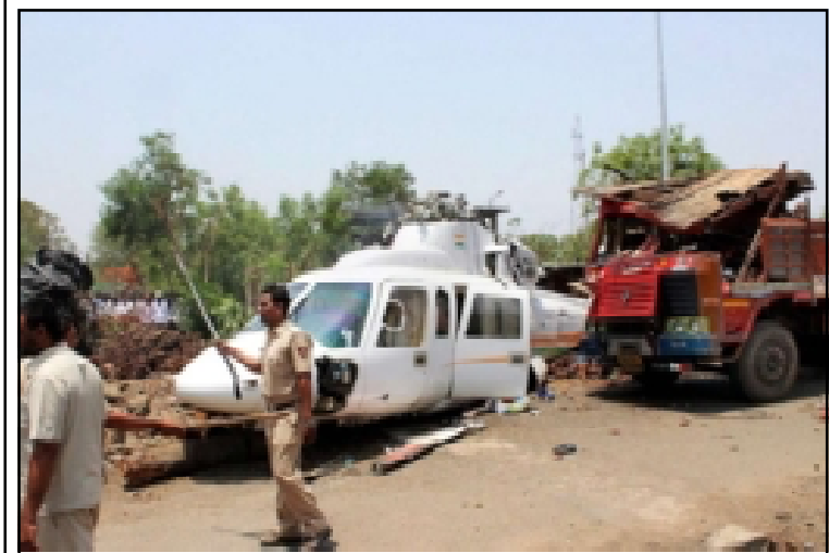
May 25, 2017 nü Latur nung Maharashtra chief minister, Devendra Fadnavis amenba, Sikorsky VT-CMM helicopter tsükoka aliba noksa nung angur.

Latur (Maharashtra), May 25 (Agencies): Brihostibarnü Maharashtra Chief Minister, Devendra Fadnavis mena aliba helicopter ka Latur district kübok Nilanga nung tsükok, saka CM den külemi mena alir shinga meyrü.