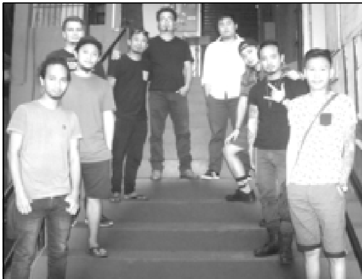
Lord of Rocks band züngsemtem den achayanger aser tayongertem külemi tangokba noksa nung angur.

Mokokchung, May 25 (TYO): May 27 Honibar aonung 6:00 ako nungi tenzüka Mokokchung town hall nung 'Lords of Rocks (LOR)' ta sür classic rock jangrar telok kati concert agütsütsü asoshi mazüngi ken bushitepdar.