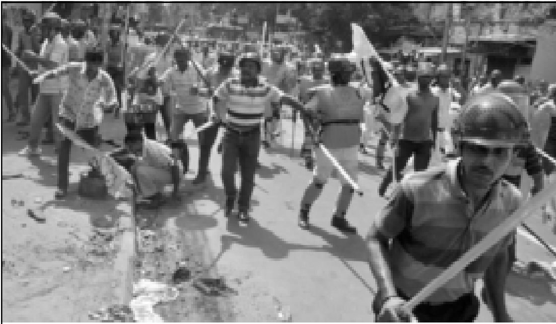
Kolkata, May 25, 2017: Brihostibarnü Kolkata nung BJP züngsemtemi 'Lal Bazar Abhiyan' longkak aيتدang police-i ajok agi züka parnok mindokba noksa nung angur.