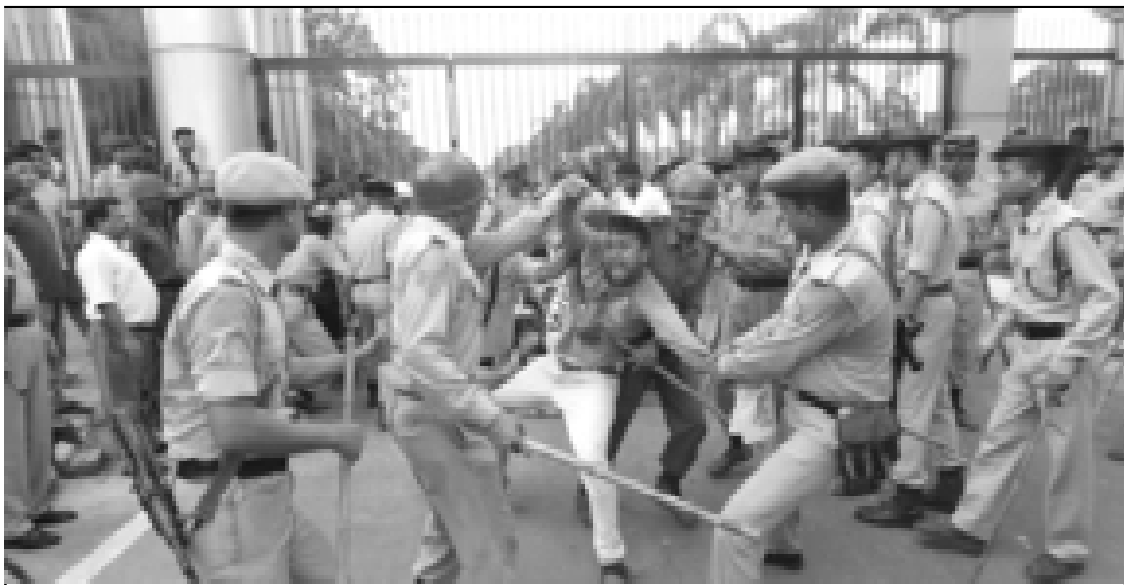
Agartala, May 25: Trinamool Chatra Parishod(TMC) pur longkak aitba sentong ka nung Chief Minister Manik Sarkar mena aliba gari jakdang police den atsütepba noksa nung angur.