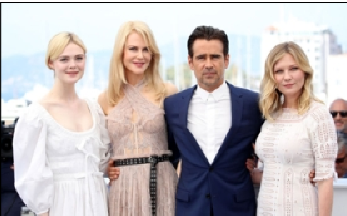
May 24, 2017 nü 70th annual Cannes Film Festival mapang Palais des Festivals nung (abelen nungi) actors Elle Fanning, Nicole Kidman, Colin Farrell aser Kirsten Dunst nungertemi 'The Beguiled' photocall nung shilem agiba noksa nung angur.

e-mail - tiryimiyim@gmail.com mesüra SMS - 9856121232 / 9436072422 mesüra Tir Yimiyim Facebook account ajanga yokang. Telangzübatemji taruba Hokolbar nü adoktsütsü.