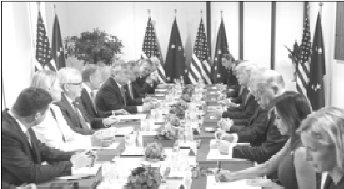
Brussels, May 25: 2017 May 25 anogo European Council headquarter, Brussels, Belgium nung Europe nungi yimden yimsüsürtem den U.S. tir, Donald Trump (achichi nungi pongububa) senden amenba mapang tangokba noksa nung angur.