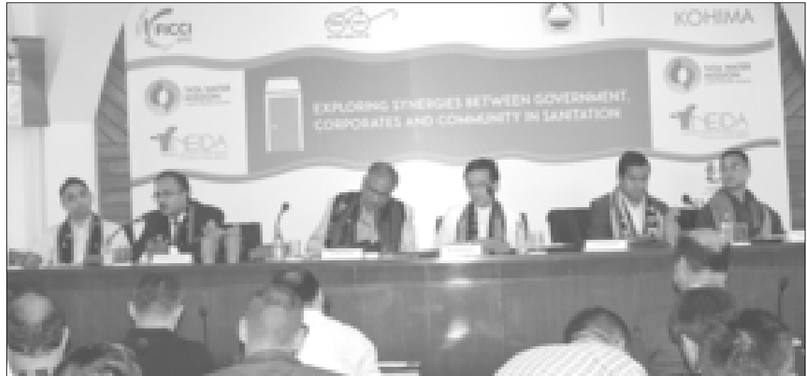
Kohima, May 25, 2017: Brihostibarnü Kohima nung sorkar, corporate aser nübortem tsüingda longjemer linük merükmejutsü atema inyaksü shisalemsatepba senden amenba noksa nung angur.

Kohima, May 25 (TYO): Tang tashi nung Nagaland nung kibong 88.6 % nung metsümeshidak junga yanglua lir saka item ama merükmejuba mapaji yimya sübaa kibur küma inyaksü aser nisung shinga tesem mashimashi nung metsümeshi masütsü asoshi tangatetba agütsütsü ano kanga nüingdaka lir, ta tanü PHE department nung ketdangsertemi metetdaksüogo.