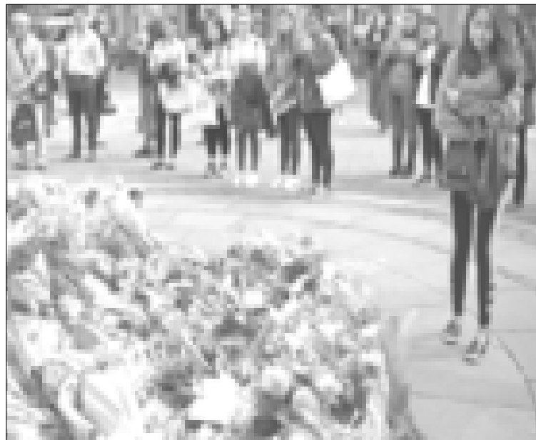
May 24, 2017 nü Manchester (England) nung aliba St Anns Square nung nüburtemi tawa kiralongrartemi amakba lendong nung asürtem nem akhüm agüja nokdakba noksa nung angur.

May 25, 2017: Hombor kibongtem ajurua teyari aonung kiralongrartemi agütsüba den külemi parnok Manchester, UK amakba nung melung süneptsüogo.