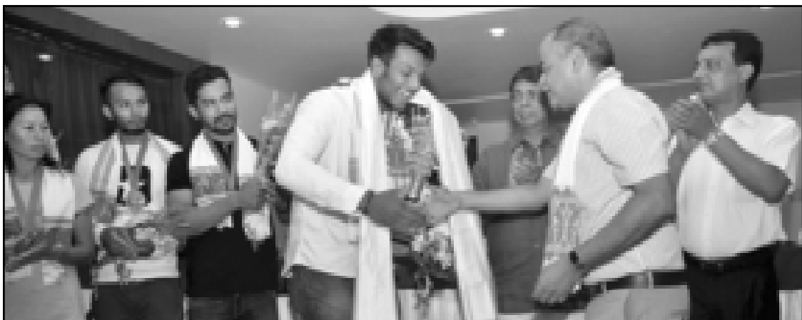
Guwahati, May 25: 41buba National Arms Wrestling Championship nung medal angurtem nem Arms Wrestling Association of Assam-i Guwahati nung Brehostibarnü tenüngsang agütsüba sentong ka ayongzuka katsüdang tangokba noksa nung angur.