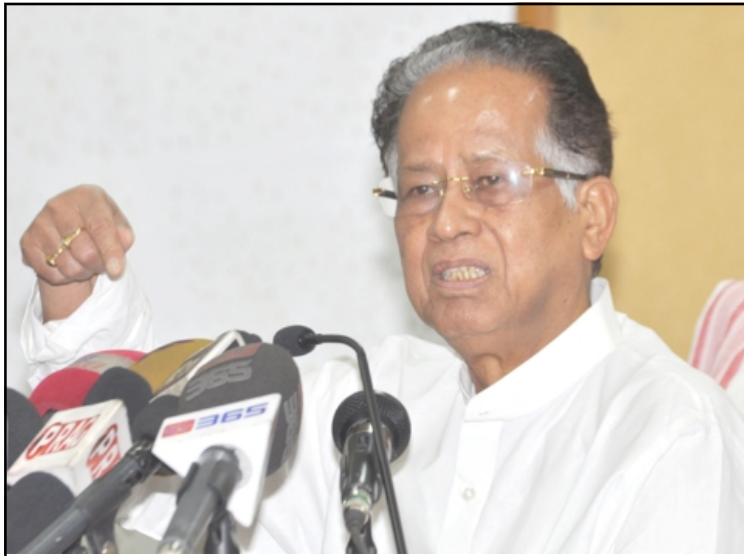
Tarun Gogoi (File)

Guwahati, May 27 (Agencies): Honibarnü taoba Assam Chief Minister, Tarun Gogoi-i sübokrem agiba ken o nung BJP nungi Minister ka anema CBI nem bushisüngdangdaksütsü atema takhangba agütsüogo.