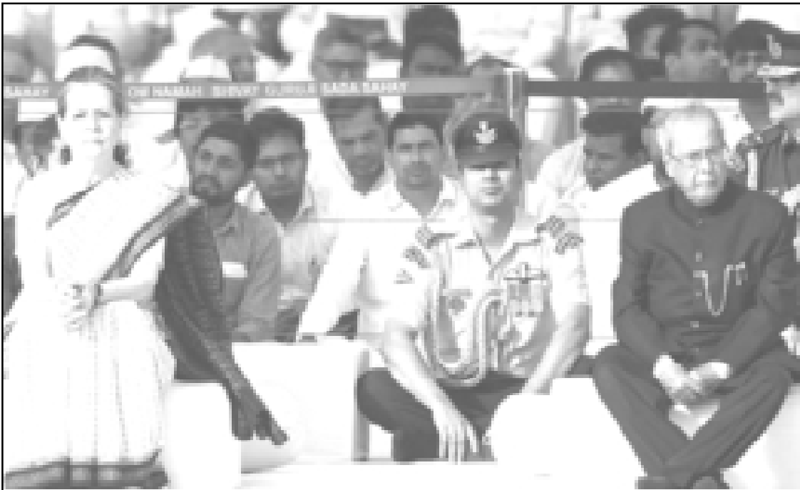
New Delhi, May 27, 2017 : India nung mezüngbuba Ato kilonser, Pandit Jawaharlal Nehru sür küm 53 ajungba anogomung nung tanü, Honibarnü Shanti Van, New Delhi nung Tir, Pranab Mukherjee aser Congress Party Tir, Sonia Gandhi nati asür nem akhüm agüja sarasadem sentong nung adenba noksa nung angur.