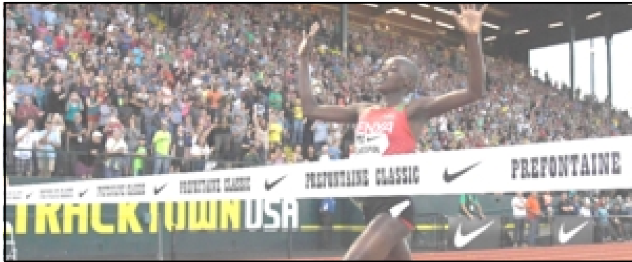
Eugene, May 27:- 4 3 b u b a P r e f o n t a i n e C l a s s i c , H a y w a r d F i e l d n u n g t e t s ü s t e e p l e c h a s e a s e m t e p b a n u n g C e l l i p h i n e C h e s p o l ( K E N ) t a k o k n g u r p e l a b a n o k s a n u n g a n g u r .