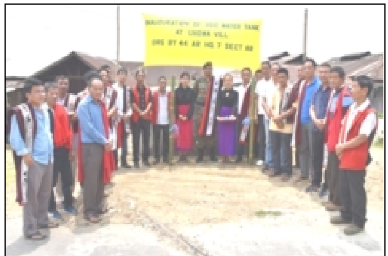
Mokokchung, May 27, 2017: Headquarters IGAR (North) kübok 44 Assam Rifles-i Mokokchung district kübok Ungma yimdak tzu litre 10,000 capacity, RCC Water Storage Tank ka yangluja May 24, 2017 nü semzüka sentong nung tangokba noksa nung angur. Tzü rizüngba tank ya ajanga yimdaklirtem nungdak peritsütsü aser tanga nungdaktema tongzüksü.