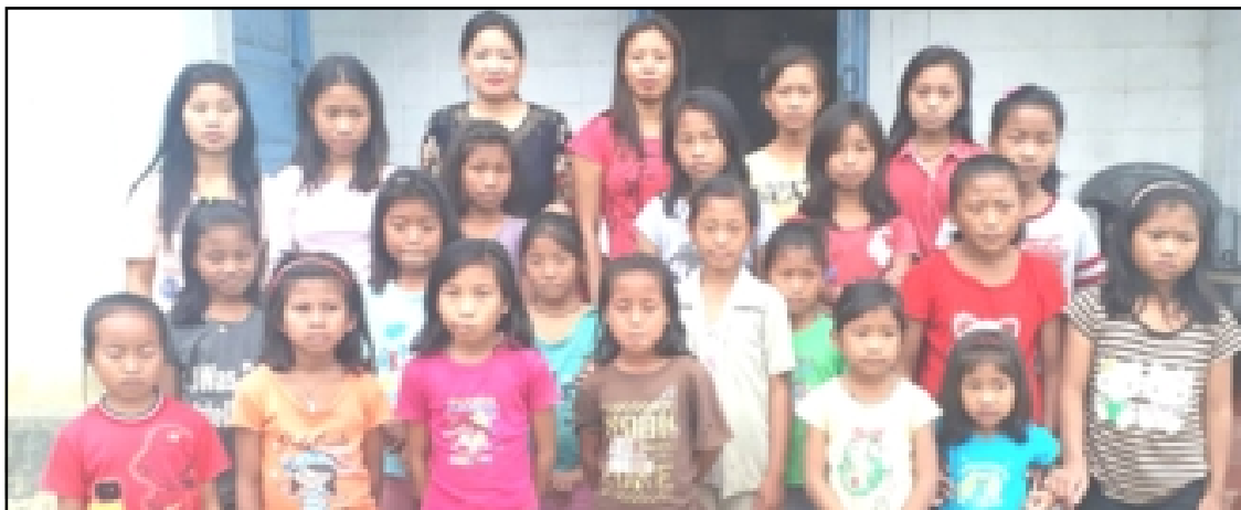
May 27, 2017 nü Kohima orphanage & destitute home nung legal awareness sentong nung KDLSA team den Kohima orphanage & destitute home tanurtem külemi tangokba noksa nung angur.

Kohima, May 27 (TYO): May 27, 2017 nü Kohima District Legal Services Authority (KDLSA)-i GMS, Kohima orphanage & destitute home nung legal awareness den "Tanurtem Temeten" omen nung poster yangluba tetoktepba sentong ka ayonga katsüogo.