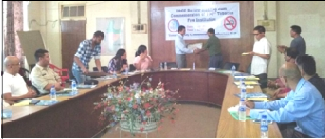
Dimapur, May 27, 2017: May 26, 2017 nü Deputy Commissioner, Dimapur Conference hall nung 2017-18 küm atema first quarter District Level Coordination Committee Review senden den 100buba tobacco free institution sentong repsema agidang Dimapur DC, Kesonyu Yhome-i district kübok school 12 nem Tobacco Free School Certificate lema agütsüba noksa nung angur.

Dimapur, May 26 (TYO): May 26, 2017 nü Deputy Commissioner, Dimapur Conference hall nung 2017-18 küm atema first quarter District Level Coordination Committee Review senden den külemi 100buba tobacco free institution sentong repsema agiogo.