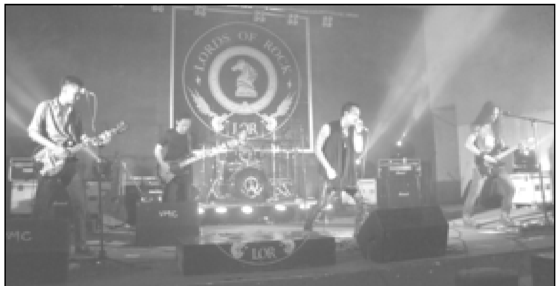
Mokokchung, May 27, 2017: Honibar aonung Lord of Rocks teloki Mokokchung town hall nung kenten sentong ka nung shilem agidang tangokba noksa nung angur. Parnoki 1980's mapang nüburtemi sapuba rock ken tajung aika tena tesentepertem tzuratemdakogo. Par telok nung züngsemtemji music luyimba nung takutet tesa lir. Lord of Rocks asoshi ibai mezüngbuba commercial concert ka lir aser yang nungi tenzüka parnoki yimti balala sema kenten sentong ayonga jajatsü parnok nükjidong lir.