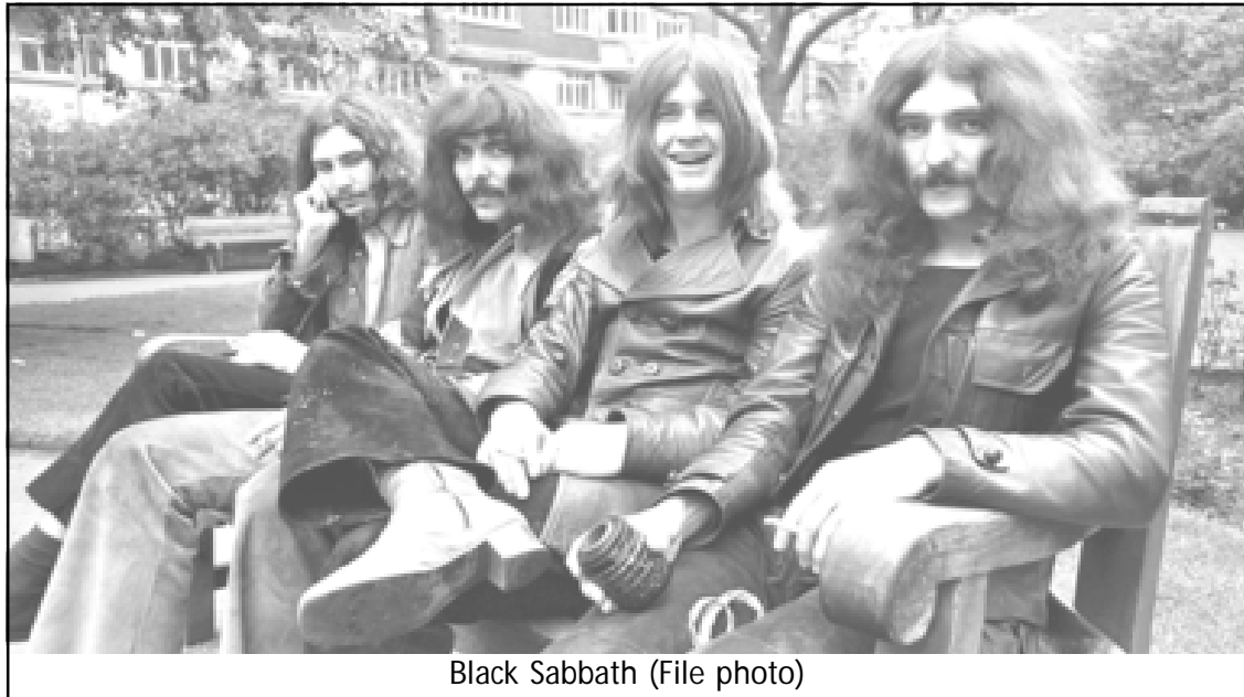
Black Sabbath (File photo)

June 07, 2017 (Agencies): Hombarnü (12.06.17) agitsü aliba 2017 Metal Hammer Awards nung Black Sabbath-i Golden God sempet agizüksü. London IndigoO2 nung aliba The O2 nung Orange Amplification den külemi ayongzükba sentong Hombarnü agitsü aliba nung iba Golden God Award ya par telok tenüing nung gitar atemer, Tony Iommi-i agizüksü.