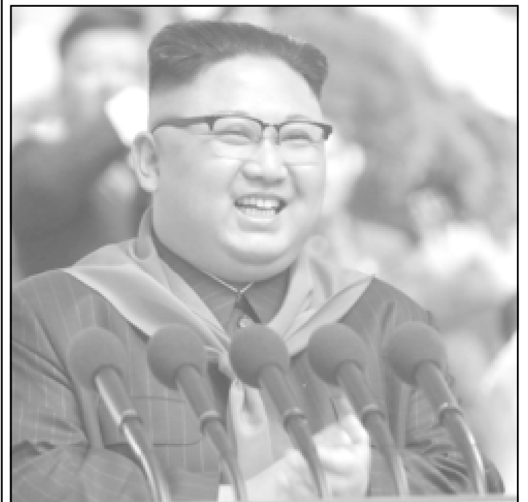
Pyongyang June 7 : 2017, June 7 nung North Korea indang Korean Central News Agency (KCNA) ajanga sayaba noksa ka nung North Korea lenir, Kim Jong Un-i 8buba Congress of the Korean Children's Union (KCU) senden April 25 House of Culture nung jembidang tangokba noksa nung angur.

Bodhbarnü aruba yipru dang tesashiba arutsü lir, ta Western Cape Disaster Management ajanga metetdaksüogo. World News Media Congress senden ka lapoktsütsü asoshi South Africa tir, Jacob Zuma Cape Town-i aotsü aliba iba yipru ajanga athi, ta ketdangser osang ka ajanag ashi.