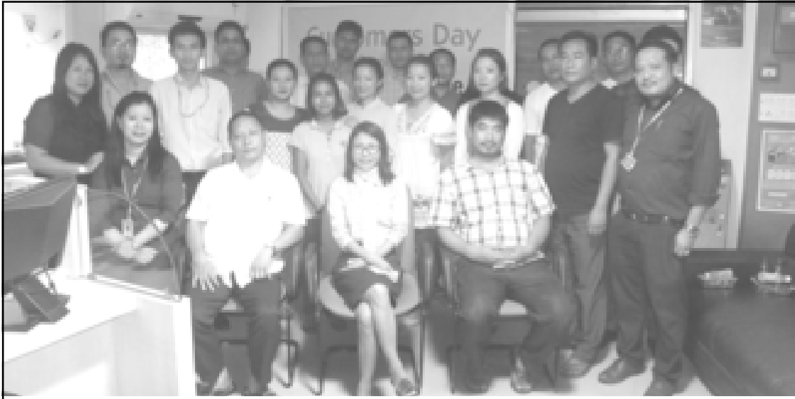
Mokokchung IDBI bank nung customers day sentong agir külen yangji inyaktertem den shilem agia adener customer-tem külemi tangokba noksa nung angur. Mokokchung, June 07, 2017.

Mokokchung, June 7 (TYO): IDBI Bank Mokokchung Branch-i "Customers Day" ta sür Bank nung inyaker aser customer na tsüingda sensaksem sentong tajung ka parnok bank nung ayongzüka kaogo.