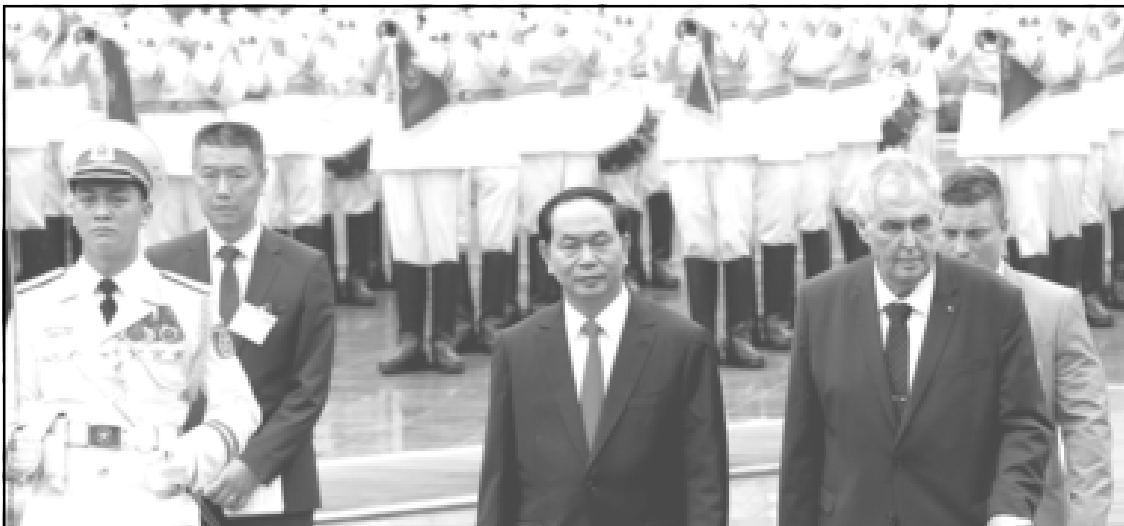
Hanoi, June 7 : 2017, June 7 nü Hanoi, Vietnam nung aliba Presidential Palace nung Vietnam tir, Tran Dai Quang-i Czech Republic tir, Milos Zeman agizükba mapang tangokba noksa nung angur.

2016 US tir atema election agiba mapang Russia-i Trump busema liasü, ta temolung melemteti aliba ken o FBI ajanga bushiba mapang Comey ya FBI Director liasü aser Trump-i pa mapa nungi anentsüba ajanga nüburtem aikati Trump anema ola adokogo.