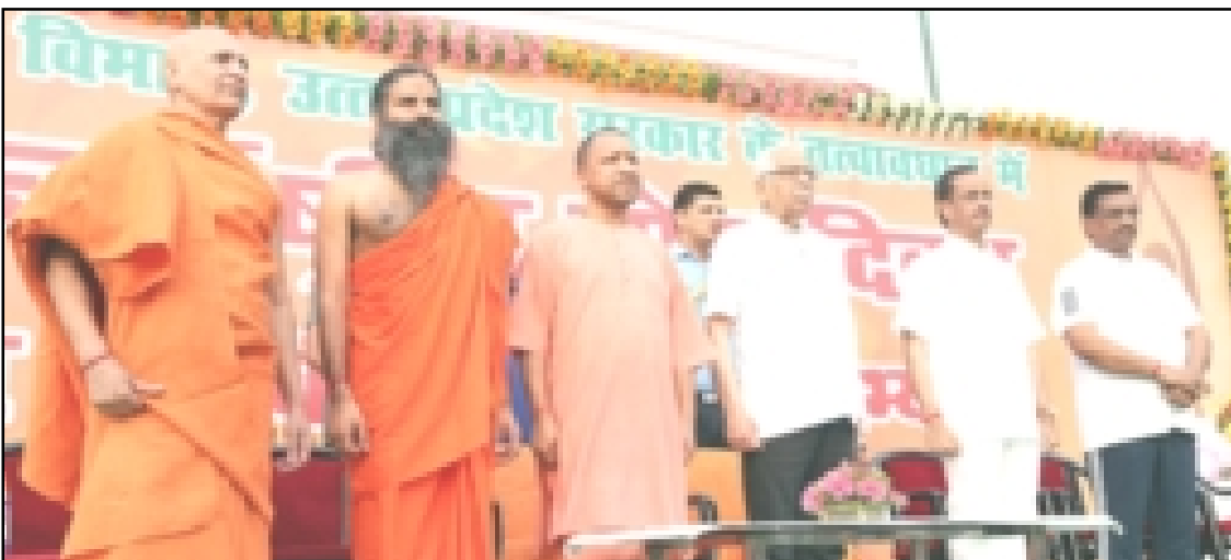
Lucknow, June 07, 2017: Bodhbarnü Lucknow nung International Day of Yoga 2017 (June 21) jeli sentong ka nung Uttar Pradesh Angh, Ram Naik, Uttar Pradesh Chief Minister, Yogi Adityanath, Uttar Pradesh Deputy Chief Minister, Dr. Dinesh Sharma, MoS (Independent Charge) AYUSH Ministry Uttar Pradesh, Dharam Singh Saini, Swami Ramdev aser Swami Bharat Bhushan nung külemi tangokba noksa nung angur.

2014 küm Lok Sabha election nungi tenzüka Congress-i Punjab dak alaka election ajak nung tamakok ngua arudar.