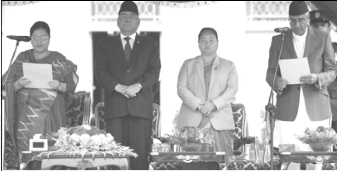
Kathmandu, June 7 : Kathmandu, Nepal nung 2017, June 7-nü Nepal tir, Bidhya Devi Bhandari (abelen)-i Nepal Ato Kelonser tasenba, Sher Bahadur Deuba (achichi) mapa inyaksü asoshi kulizü agiba mapang tangokba noksa nung angur. Kasa noksa nung Ato Kelonser mapa doktsüsang, Pushpa Kamal Dahal/Prachanda (abelen nungi tanabuba) aser Constituent Assembly mendenbula, Onsari Gharti Magar (abelen nungi tasembuba) nungera angur.