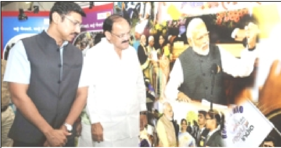
New Delhi, June 07, 2017: Bodhbarnü Sarojini Nagar, New Delhi nung Urban Development, Housing & Urban Poverty Alleviation and Information & Broadcasting Union Minister, M. Venkaiah Naidu-i DAVP indang "Saath Hai Vishwaas Hai, Ho Raha Vikas Hai" Exhibition lapoktsüba sülen sema senzüba noksa nung angur. Kasa noksa nungsa Minister of State for Information & Broadcasting, Col. Rajyavardhan Singh Rathore-a angur.