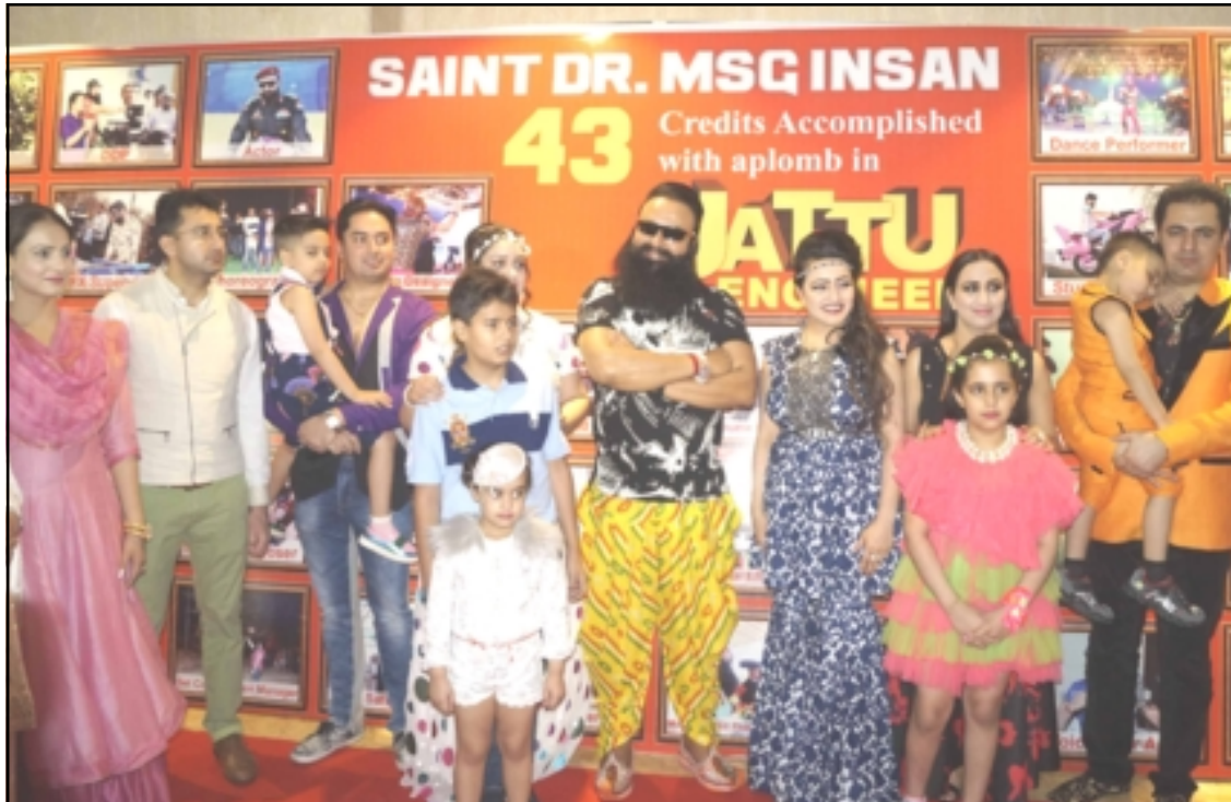
New Delhi, June 7: Bodhbarnü New Delhi nung 'Jattu Engineer' film takok anguba atema party amongba mapang tamangba yimsü nung lenir Gurmeet Ram Rahim Singh (teyong) aser tangartem tangokba noksa nung angur.

2018 küm June nungi tenzüka Mac app store nung inokja aliba app tem agizüksü asoshi iba device yagi 64-bit support sütetsüla, ta osang ajanga sa ashi.