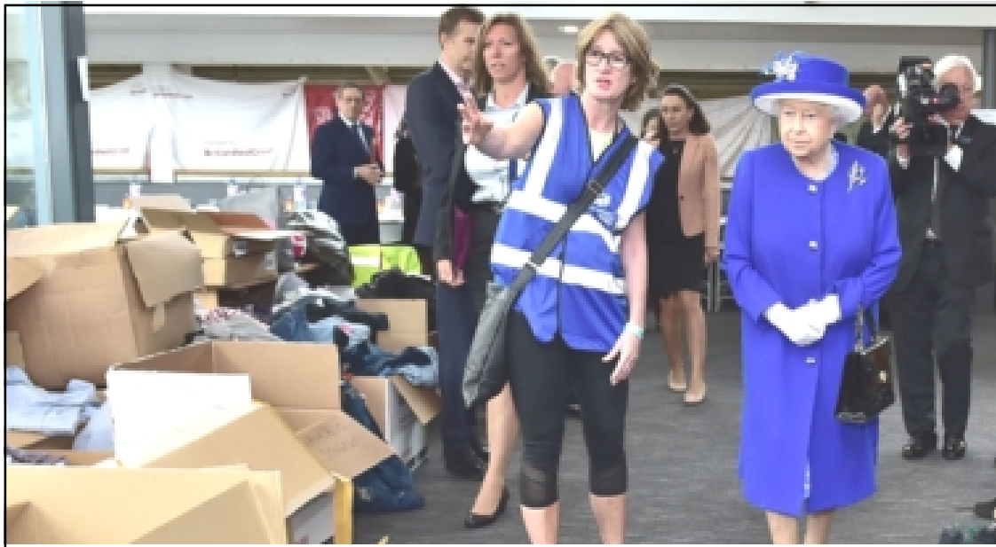
London, June 16 : Grenfell Tower mi lendong ajurur aliba nisungtem Britain chubatsü, Queen Elizabeth II-i 2017, June 16 nü semdangba mapang tangokba noksa nung angur.

London, June 16 (Agencies): London nung aliba Grenfell Tower mi lendong nung asür nisung 30 jangjaogo aser anu aika mangu bushidar, ta police ajanga Hokulbarnü ashi.