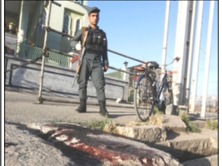
Kabul, June 16: 2017, June 16 anogo Kabul nung aliba Muslim nunger tekülem ki ka nung bomb apokba anasa police kati ali nung azü melanga aliba reprangdang tangokba noksa nung angur.

Kabul, June 16 (Agencies): Afghanistan yimtiba Kabul nung aliba Shiite nunger tekülem ki ka anasa pei sasa temang nung bomb inoker pokdaktsüba lendong ka Brehostibarnü nikongdang adalokba mapang nisung pezü asü. Muslim nunger temeshi ita, Ramadan mapang nung Afghan yimtiba nung iba ama lendong aika adaloka arudagi.