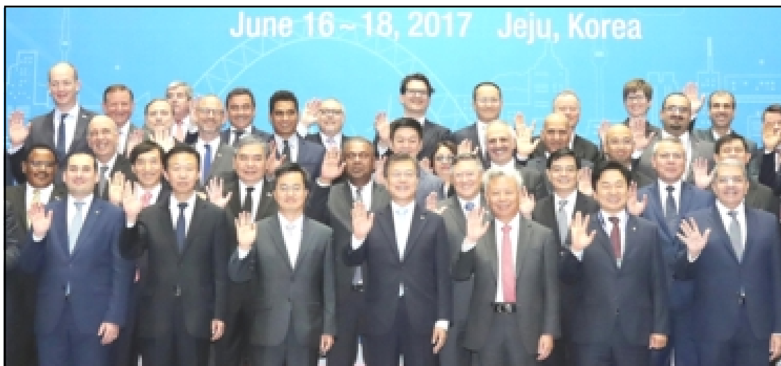
Jeju, June 16: 2017, June 16 anogo Jeju, South Korea nung 2buba Asian Infrastructure Investment Bank (AIIB) senden tenzüka mapang South Korean tir, Jae-in aser AIIB tir, Jin Liqun-na densema tangokba telok noksa ka angur.

Iba ama densa ka nung ozüngi memelai arrtsü alema aitsü merangba nisungtem aika Turkey Border Guard temi khasetogo aser aika dak züka merenshiogo, ta Amnesty International aser Human Right Watch ajanga ashir.