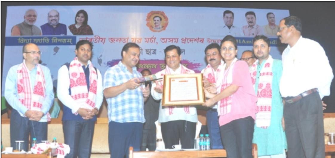
Hokolbarnü Guwahati nung Bharatiya Janata Yuva Morcha (BJYM)-i High School leaving Certificate Examination (HSLC), Higher Secondary Examination aser High Madrassa 2017 nung takok angur nem tenüngsang agütsüba sentong nung Assam chief minister Sarbananda Sonowal den State Education minister Himanta Biswa Sarma na adenba noksa nung angur. (Guwahati, June 16)