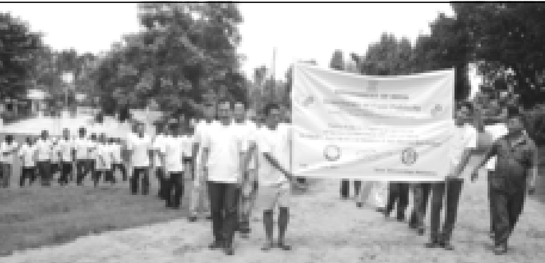
Dimapur district kübok Molvom yimtak center government-i Swachh Bharat, Beti Bachao Beti Padhao, PMJDY amala sentongtem ayongzüka agiba asoshi tenüngsang agüja jajaba noksa nung angur. Kohima, June 16, 2017.

Nagaland nung election timi agitsü ... (TAPAK 1 NUNGI...) Ano, yimten, lokti aser arogo nung lenirtemisa Election department dang vote agütsüba anogo nung proxy vote enokba aser tashiyim amshiba nokdangtsü asoshi polling station ajak nung vote agütsüba mapang piyong cctv agi noksa agia anidaksüla ta metetdaksü. Iba senden nungsa political party nung lenirtem dang Ruling nung dang adentsü mebilemi nübortem tenzüksü bilema yimsü asütsü aser ano nübortem danga Tsüngrem akümtsübuba aser nübortem meimba lenir tajung bushia adokdaksütsü atema ajungshitepa jembia liasü. Iba senden sentong tenzüka jembidang, electoral merüktetsü asoshi department-i software tasen amshia inyaktü tenzükgoko ta Chief Electoral Officer (Officiating) Wb.N.Moa Aieri metetdaksü. Ano, tanüsa Election department-i "election watch mobile Web" ka tenzükgoko. Iba web ya ajanga nübortem election maparen indang tementetnüba reprangtsü akoktsü. Ano, election maparen dak sendakba nung osang agitepa nungdakba mapatem inyaktü asoshi district aser sub-division ajak nung 'control room' kaka lapoktsü ta CEO-isa metetdaksü.