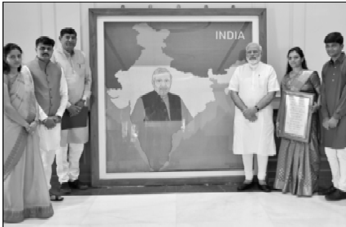
New Delhi, June 16:- Brehontibarnü Prime Minister Narendra Modi nem Khushboo Akash Davda-i pearl agi yangluba noksa ka agütsüdang tangokba noksa nung angur.

Iba sentong ya Wizcraft International Entertainment-i ayongzuka akatsü. IIFA sentong ya US Tampa Bay nung 2014 küm agiba sülen taküm agitsü aliba ya tanabuba asütsü.