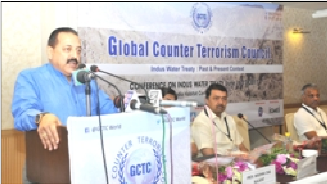
June 16, 2017 nū New Delhi nung Global Counter Terrorism Council-i ayongba senden nung Minister of State for DoNER (I/C), Prime Minister's Office, Personnel, Public Grievances & Pensions, Atomic Energy and Space, Dr. Jitendra Singh-i jembiba noksa nung angur.