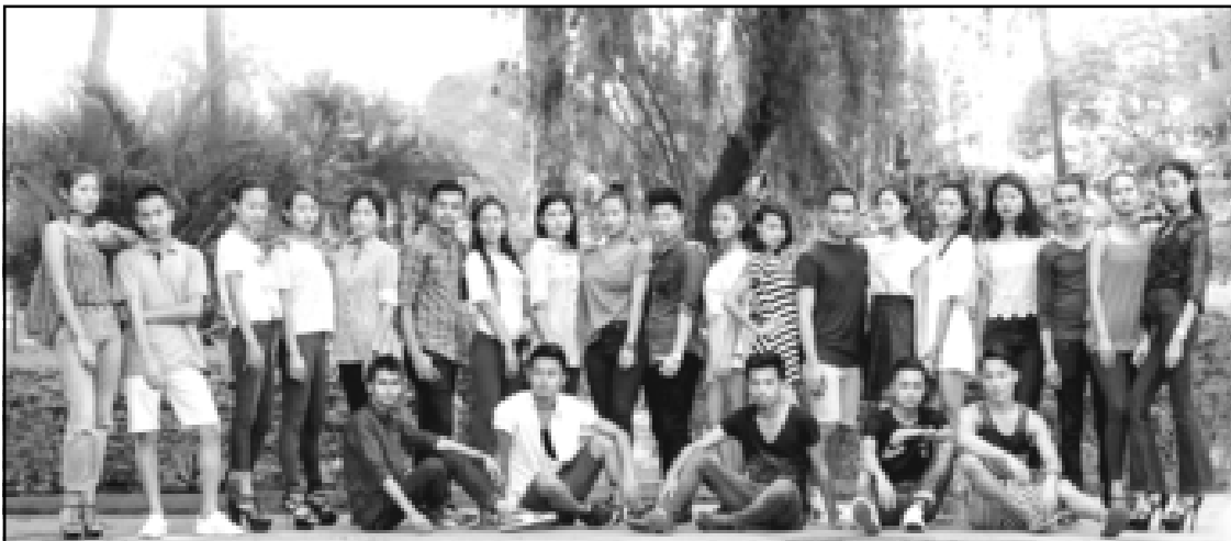
Dimapur, June 22 (TYO): Nagaland Designer Association-i ayonga Nagaland Fashion Week 2017 Season-1 sentong ka Hotel Theja Fort nung June 22 anogo, nikongdang 5:00 ako nungi tenzükogo. Iba sentong nung Nagaland tesem balala nungi designer lanur aika adenshia shilem agitagi. Iba sentong nung desinger balala-i yangluba süoshi aser sübutsü tem sayatsü.