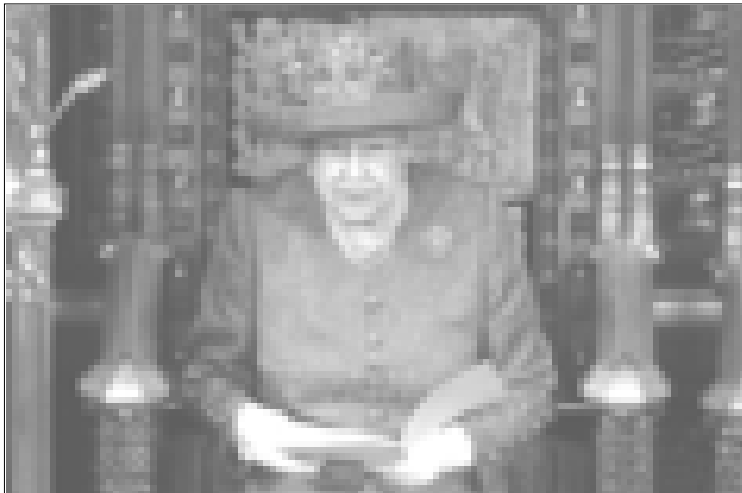
London, June 21, 2017: Bodhbarnü central London, Britain nung Parliament senden tenzü kba anogo nung Britain Chubatsür, Elizabeth-i jembiba noksa nung angur.

June 22, 2017: Bodhbarnü Parliament nung Queen Elizabeth-i jembiba sülen Christain Aid-i, UK sorkari alima atema Paris Agreement tanaben asüngsashiba atema tenüngsang agütsüogo.