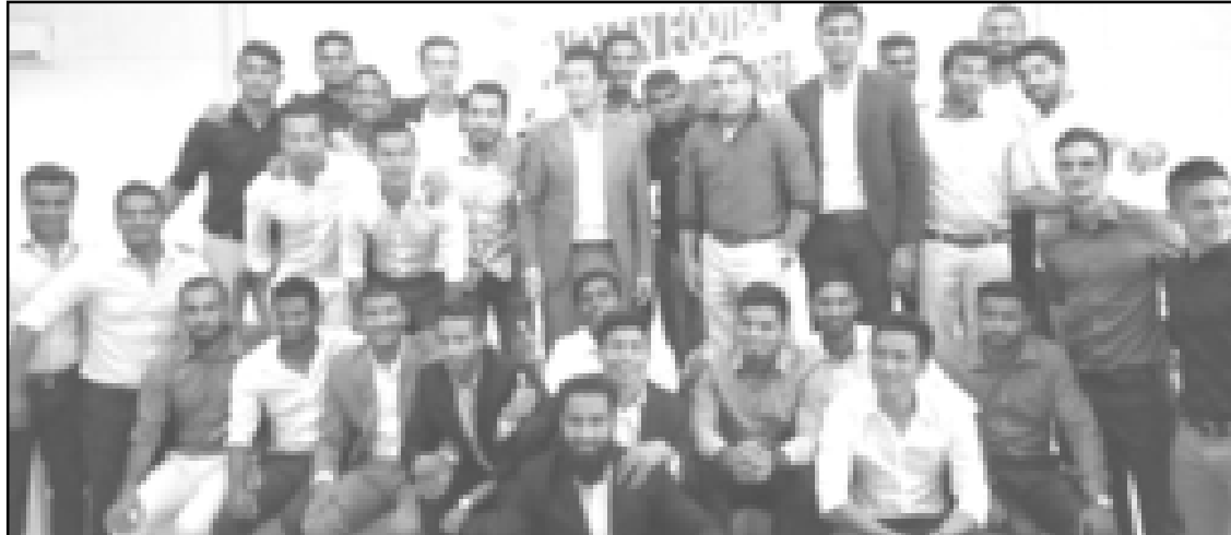
Football Players Association of India (FPAI) aser Mizoram XI na I-League champion Aizwal FC's home ground nung July 1 nü charity match ka asayatsü. FPAI pur noksa nung angur.

Mumbai, June 22 (Agencies): Tawa India nung football renloka aotsüba ren nung kanga bulua jempitepa arudar aser iba nung I-League aser Indian Super League (ISL) na ka küma longjemtsüba kanga sashia jembidar.