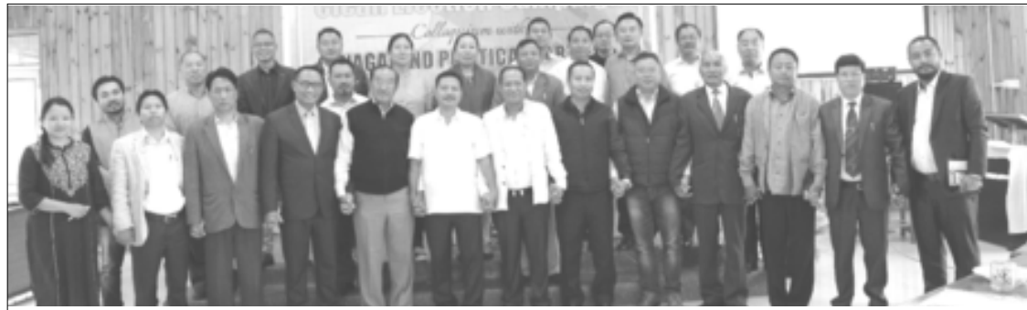
Brihostibarnü NBCC Platinum Hall, Kohima nung NBCC ketdangsertem aser Nagaland nung yimtenren party balala nungi lenirtem tangokba noksa nung angur.

Kohima, June 22 (TYO): Nagaland nung ochimashi mapatem ajak dera ya election lir, kechiyong election timi magitetba ajanga yimten nung ochishia meinyaketter, anungji 2018 küm agütsüba election yabo merükmerüka timi agütsü asoshi yimten telok ajaki Nagaland Baptist Church Council (NBCC) pusema nokdaksü, ta tanü yangi Kohima nung yimten teloktemi tenangzükba ka NBCC den agiogo.