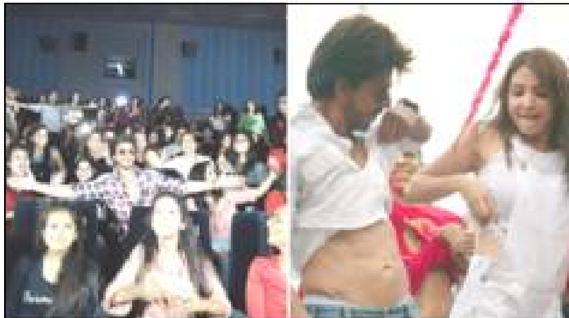
Ahmedabad yimti nung Bollywood actor, Shah Rukh Khan-i pai shilem agiba film, 'Jab Harry Met Sejal' nungi Radha ken sayaogo. Iba sentong nung pai tetsür ajak dang pa temeim lemsatepa 'hu tane prem karu chu' ta ashiba ajanga tetsüe ajak peladaksü. Iba sentong nung kasa film nungi Anushka Sharma bo medentet, ajisüaka Shah Rukh den film director, Imtiaz Ali bo liasü.

"Alima nung pop star tajungtiba densema lir. Ni asayaa