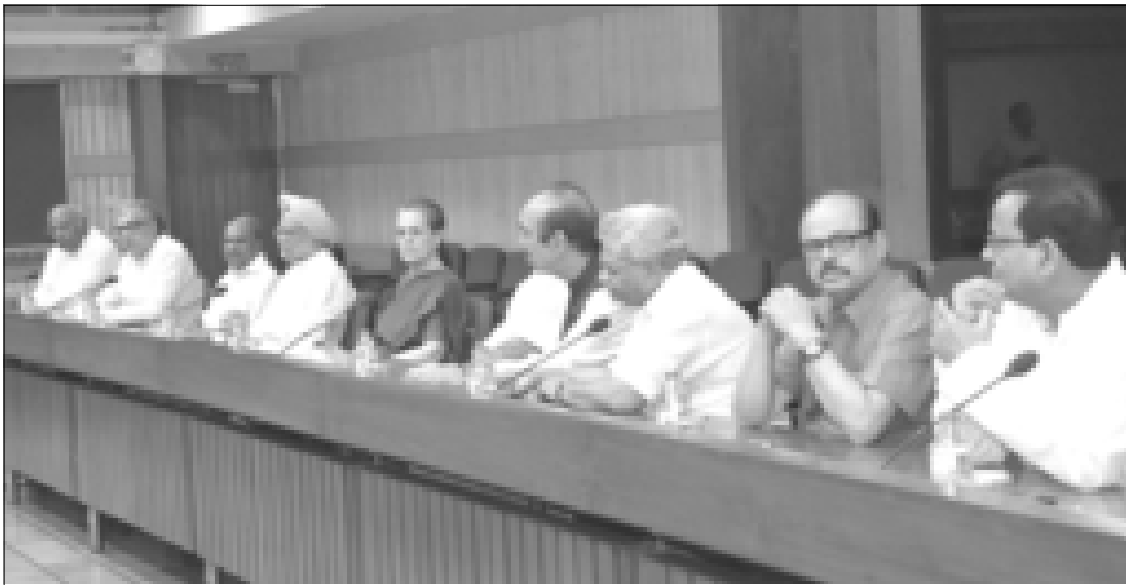
New Delhi, June 22, 2017 : Brihostibarnü Parliament House library building, New Delhi nung Congress Party Tir, Sonia Gandhi leniba nung Opposition Party balala nungi lenirtemi linük Tir election onük nung senden ayonga amenba noksa nung angur.