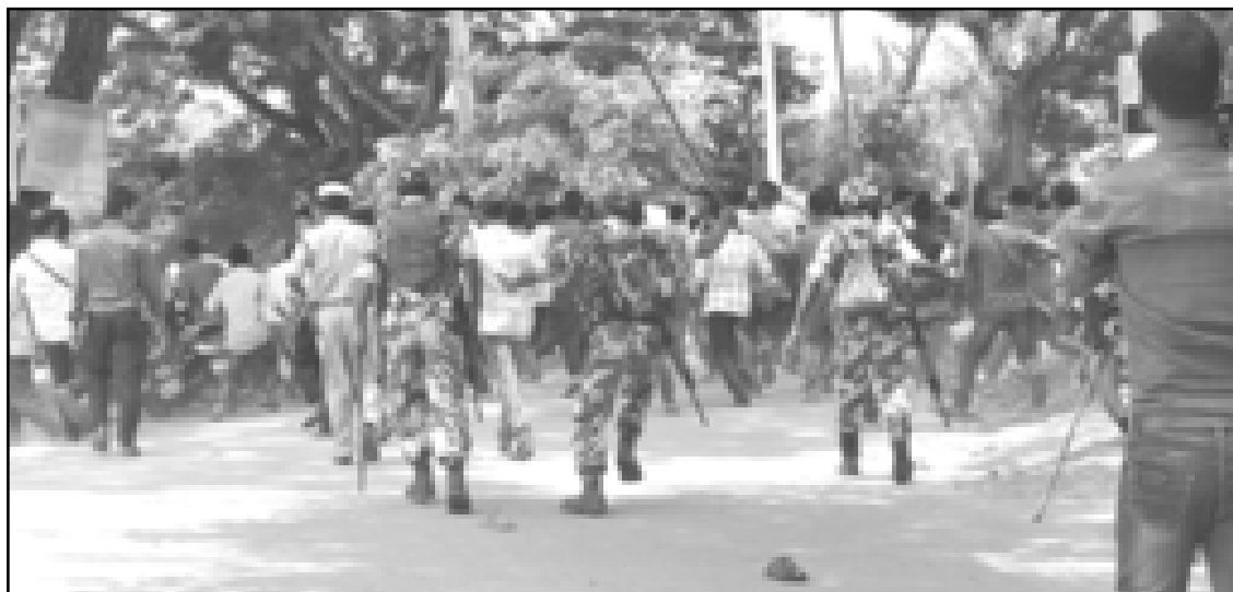
Diphu, June 22 : Brehostibarnü, Diphu nung Karbi Autonomous Council election mapang polling station ka kima police temi nüburtem ajok agi züka meinshiba noksa nung angur.

Kolkata-Dhaka bus service ya kiyonger ana tsüngda mezüngbuba bus service lir aser iba ya 1999 küm July ita amenoka liasü aser iba sülen Agartala-Dhaka bus service 2003 küm September ita amenoka liasü.