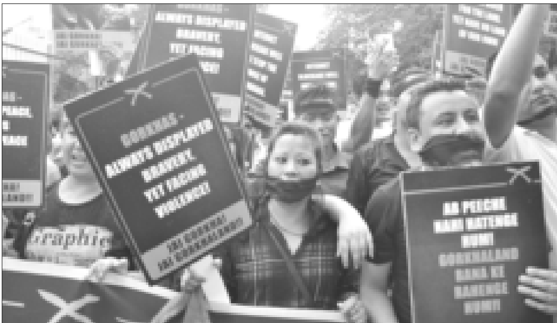
Mumbai, June 22, 2017: Brihostibarnü Azad Maidan, Mumbai nung Gorkha nungeri Gorkhaland atema takhangba agüja longkak aitba noksa nung angur.

Yashia north Kashmir, Baramulla district kübok Sopore jila nung security sepaitem telungpur ana khaseta liasü.