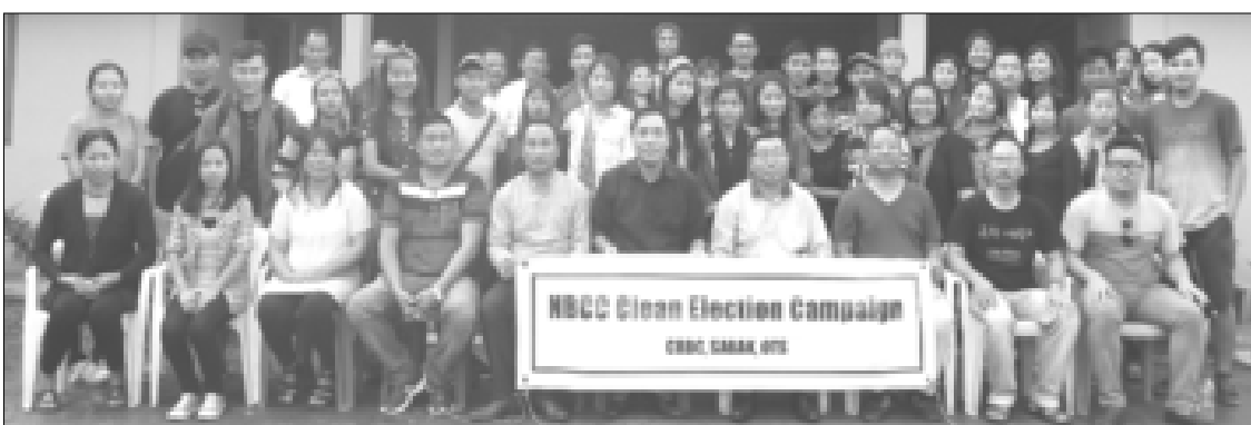
Sümi Aphuyemi Baptist Akukuhou Küqhakulu (SABAK), Council of Rengma Baptist Churches (CRBC) aser Oriental Theological Seminary (OTS)-i senteper June 20 nungi July 20, 2017 nü tashi NBCC Clean Election ayongzü kogo. Iba mapang nung OTS kaketshirtem aser SABAK o CRBC nungi züngsemtemi Pughoboto aser Tseminyu nung aliba nüburtem dang Election merüka agitsü indang tesayubatem agütsüsü.