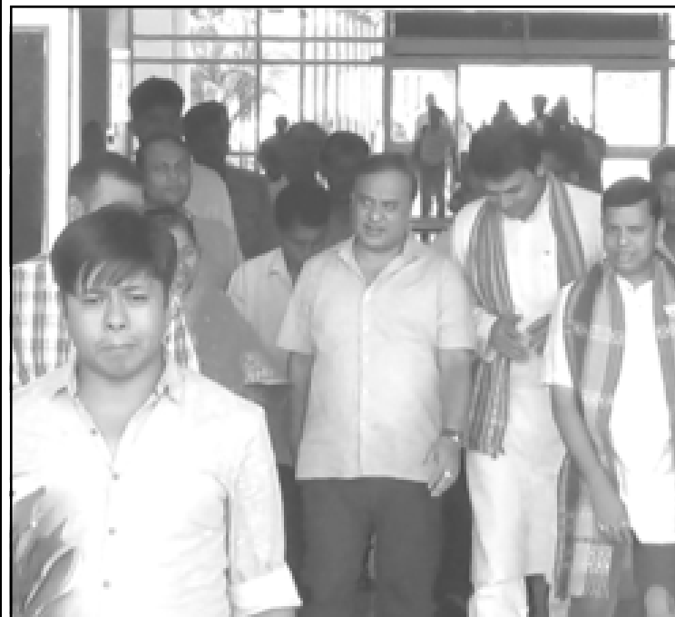
Agartala, June 22 : Brehostibarnü Agartala Airport nung Assam Minister Hemanta Biswa Sharma BJP lenirtemi agizükba noksa nung angur.

Gorkha Janamukti Morcha puri West Bengal hills nung Gorkhaland state tasen ka kümettsüba atema khanga mapang telatet ka makai longkak aitba mapang ka nung, Chamling-i iba tebilemba lemsatepa liasü.