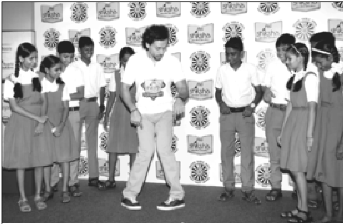
Hokolbarnü Mumbai nung tangar memenepba tanurtem den sentong ka nung Bollywood actor Tiger Shroff-i shilem agiba noksa nung angur. (Mumbai, June 30)