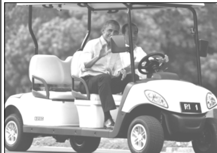
June 30, 2017 nü Bogor, West Java nung aliba Presidential palace nung Indonesia Tir, Joko Widodo aser taoba former U.S. Tir, Barack Obama na golf cart ka nung mener aodang agiba noksa ka angur.

Pi Zero ya tanga computer dang tilaba aser jenjang talangba lir. Raspberry Pi ya British nung computer ayokba puti ostü nung tajungtiba lir. Iba computer ya Amstrad aser Sinclair indang ZX Spectrum amala computer ajateta kümogo.