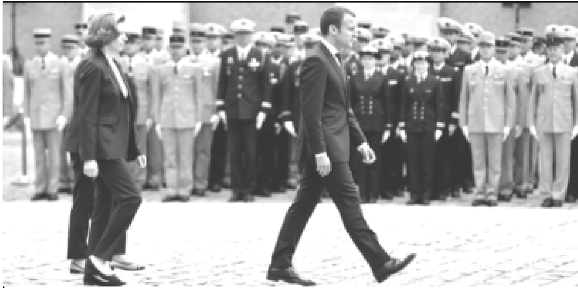
Paris, June 30, 2017: Hokolbarnü France yimtiba, Paris nung Hotel des Invalides nung France Tir, Emmanuel Macron aser France Armed Forces Minister, Florence Parly na military sentong ka nung adenba noksa nung angur.