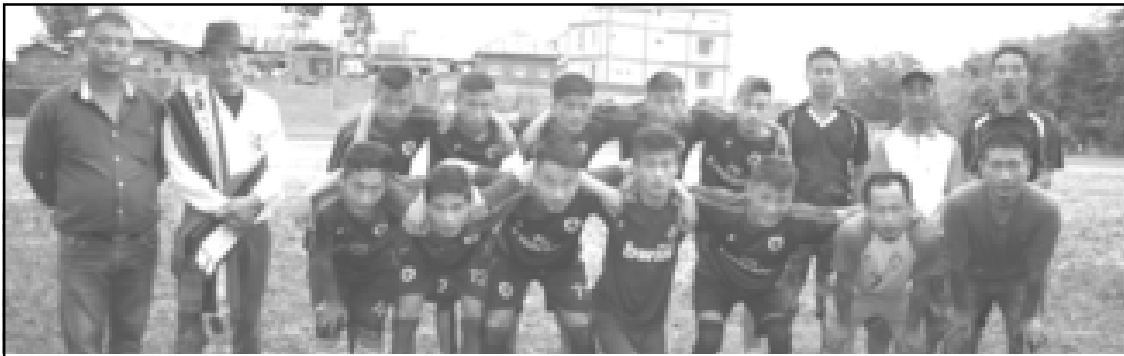
2buba SSS football asayamung nung tematiba takok angur United Soyim Club asayatem den tajungshi o jembir Wb. Imlikokba Imsong Tatar aser SSS ketdangsertem noksa nung angur. Ungma, June 30, 2017

Ungma, June 30 (TYO): June 28 nungi tenzuka anogo asemnu tashi Sports Society Soyim (SSS)-i ayongzuka yangi Senayangba Govt. Hr. Sec. School ground Ungma nung 2buba SSS football tournament 2017 takok ngua mungogo.