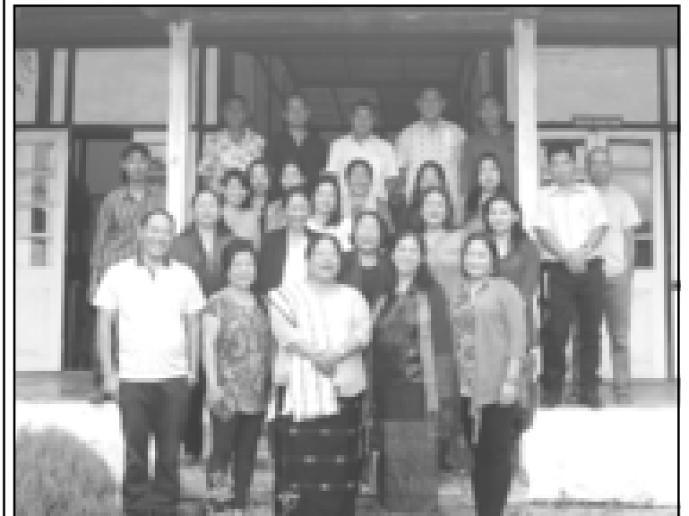
June 30, 2017 nü Mokokchung DEO office nung Mokokchung DEO, Temjennaro (tiyong) den tepila sentong agiba sülen la den külem inyakerem aser tangartem tangokba noksa nung angur.

Iba senden anogo atsüzükbaji temelung nung itta yur DPDB züingsem ajak iba senden nung medema adentsü metetdaksür, ta sangdong nungsa shia alir.