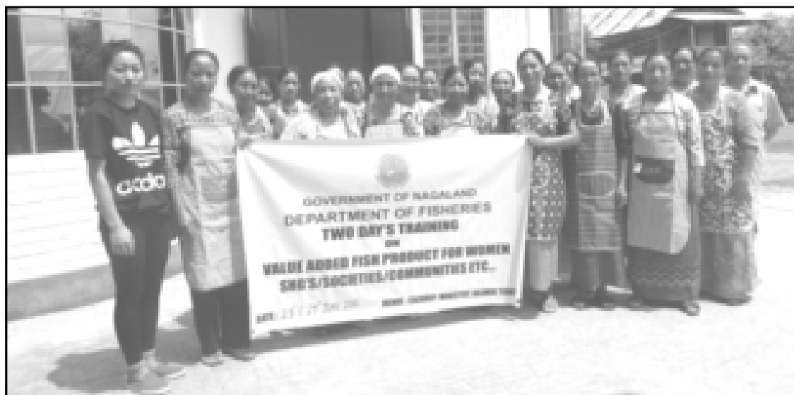
June 23 aser June 24, 2017 anogotem nung Calvary Ministry, Jalukie town nung Department of Fisheries-i tetsürtem Self Help Groups/societies/communities nem 'value fish products' indang training agütsüba sentong nung tangokba noksa nung angur. SDFO aser staff temi ango pickles, ango cutlets aser ango soups densema ango agi chiyungtsü tapu balala yangluba training agüja liasü. Calvary Ministry nungi tetsür 25 iba training nung aden.