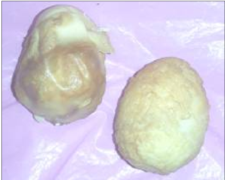
Plastic entsü met-er totzü nung asangba sülen tangokba noksa abelen nung aser ajichilen shidakba entsü angur.

Kohima, June 30 (TYO): Kohima nung kanga dang taoksatsü aketba osang ka angazüker aser ibaji shishilembadak taila entsütem anguba lir.