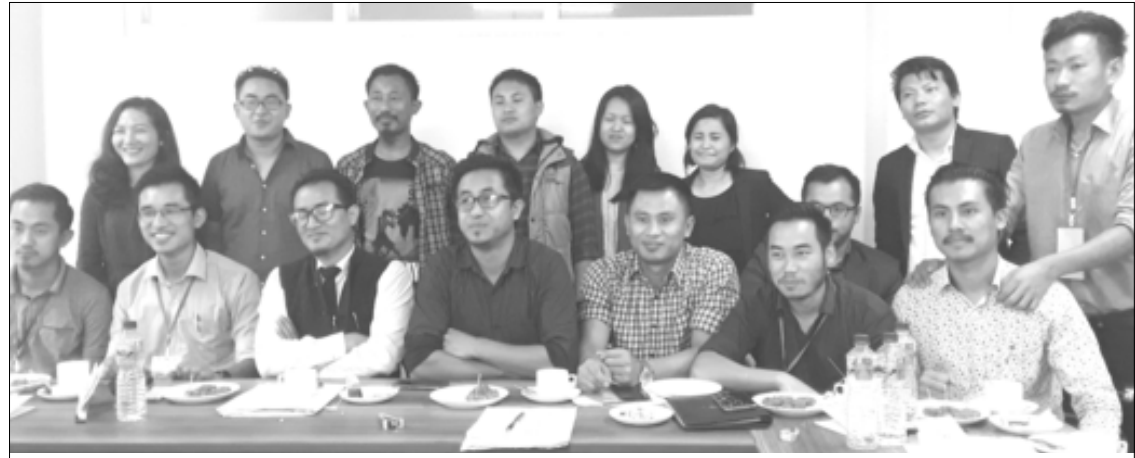
June 30, 2017 nü Hotel Ariel Kohima nung PSAN core team agiba noksa ka angur.

Kohima, June 30 (TYO): Nagaland nung sorkar department temi mapa tazüngtem Nagaland Public Service Commission (NPSC) ajanga meshimba anema Public Service Aspirants Nagaland (PSAN)-i July 3, 2017 nungi Civil Secretariat kima lungkak aittsü.