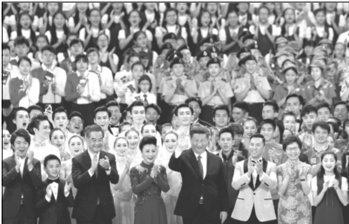
Hongkong, June 30, 2017: British nunger yimsüsüba kübok aliba Hongkong, China linük nem agütsüba sülen küm 20 ajungba benjungmung dak sendakba 'Variety show' ka tembangba sülen China Tir, Xi Jinping-i lokti dak teka ayiploktsüba noksa nung angur.

i osangbener dang ashi. Iba tetsürla ya Yazidi community nungi lir aser item nisungtem ya temenen külemertem lir, ta ISIS temi ashir. ISIS temi Yazidi nisungtem ya meyirjang aika reshikangshia amshi aser aika tepset, iba den külemi tetsürtem aser tanurtem ya parnoki shi nung medemtsü asoshi alar ama amshir.