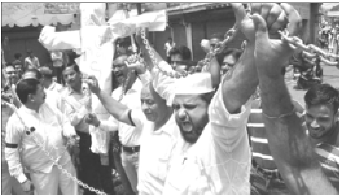
Moradabad, June 30, 2017: Hokolbarnü ayaterm nung sorkari Service & Goods Tax tenzüksü lia tanü Uttar Pradesh, Moradabad nung shishilembartemi shishilembabba tesemtem shibanger Goods and Services Tax anema longlak aitba noksa nung angur.

Lenir ana senden amenba sülen linük ana külem sangdong ka ajanga, arrtsü adener kiralongra inyaktsü atema Pakistan-i kiralongrartem nem pei litsü mamshidaksütsüla, ta metetdakja liasü.