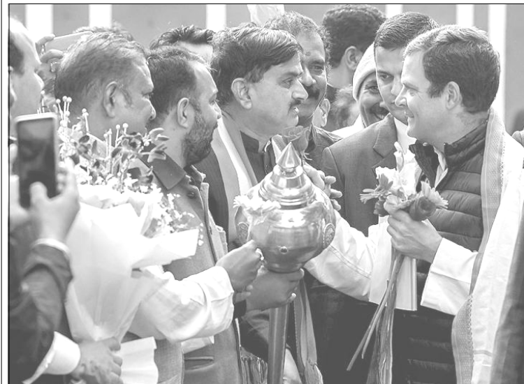
Lucknow (Uttar Pradesh), January 23, 2019: Tanü Lucknow yimti nung Congress Tir, Rahul Gandhi, Chaudhary Charan Singh International Airport tonga arudang party nung inyaktertem aser lenirtemi pa agizükba noksa nung angur.

Amethi (Uttar Pradesh) January 23 (Agencies): Regional party tem- Samajwadi Party (SP) aser Bahujan Samaj Party (BSP) nati Uttar Pradesh nung taruba Lok Sabha election teloktep nung Congress sendokogo, ajisüaka tanü Congress party Tir, Rahul Gandhi-i, SP aser BSP na den yariteptsü melunga dang lir, ta metetdaksü.