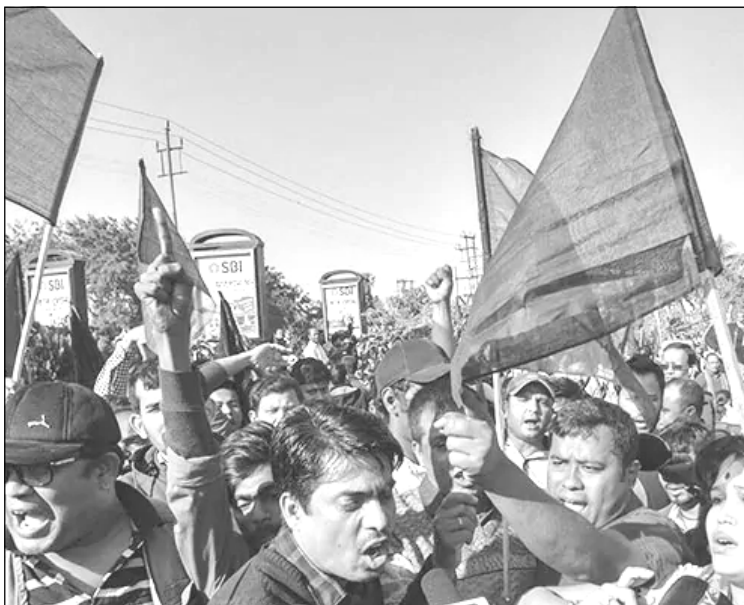
Aizawl: Kaketshirtem densema nisung meyirejang aika Bodhbarnü Citizenship (Amendment) Bill anema yimtung nung longkak aitba noksa nung angur.

Aizawl, Aenjeti/January 23 (Agencies): Bodhbarnü Mizoram kübok tesem balala nung kaketshirtem densema nisung meyirejang aikati Citizenship (Amendment) Bill anema longkak aitogo.