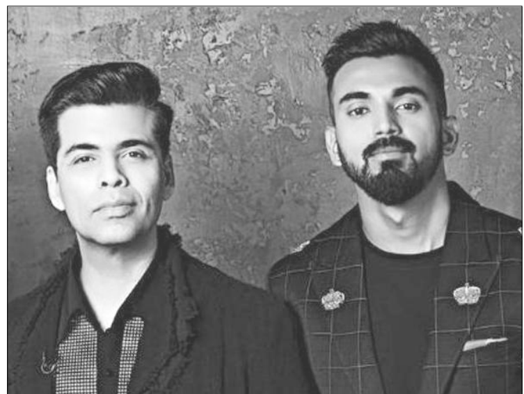
KL Rahul & Karan Joha