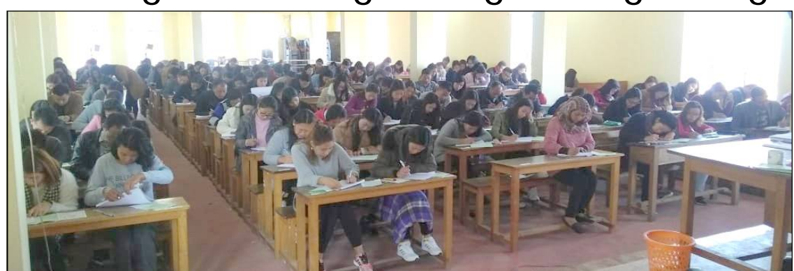
ASLB-i ayongba Ao Arangtet Tatidang centre ka nung agiba mapang tangokba noksa nung angur. Mokokchung, January 23, 2019

Mokokchung, JAN 23 (TYO): January 21 nungi tenzüka anogo asemnü tashi Ao Senden Literature Board (ASLB)-i achayanga agiba Ao Arangtet Tatidang Centre asem - Mokokchung, Kohima aser Dimapur nung takok ngua agiogo.