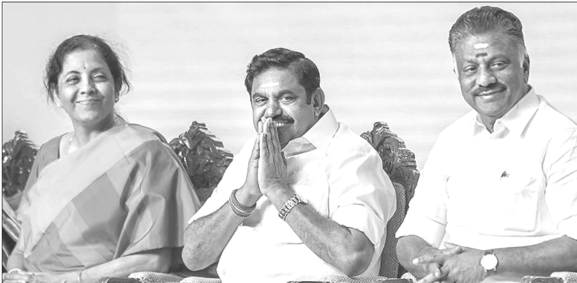
Chennai (Tamil Nadu), January 23, 2019: Tanü Chennai nung aliba Trade Centre nung 2buba Global Investors Meet (GIM) 2019 senden nung Union Defence Minister, Nirmala Sitharaman, Tamil Nadu Chief Minister, Edappadi K Palaniswami aser Deputy Chief Minister O. Panneerselvam nunger adenba noksa nung angur.