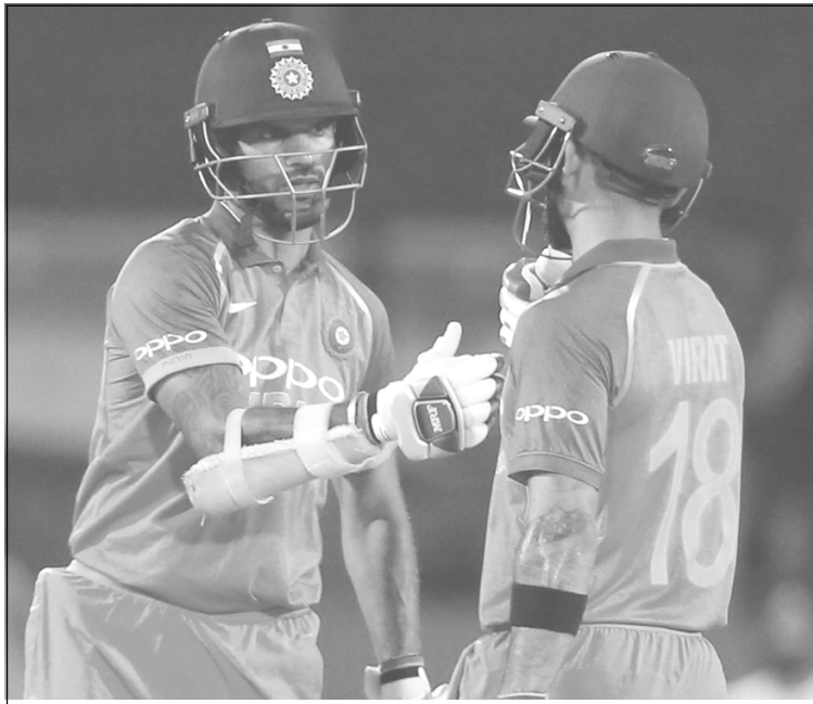
Dhawan run 50 ajungba sülen Kohli-i tenungsang agütsüba noksa nung angur

Napier, Aenjeti/January 23 (Agencies): Bodhbarnü India aser New Zealand na tsünga mezüngbuba ODI asaya India-i kokogo. India nungeri iba asaya wicket 8 agi over 34.5 nung koka liasü.