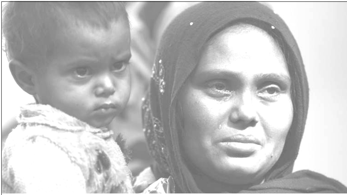
Mongolbarnü Agartala nung police station kima Rohingya tsür ka lar chir ajunger jeba nokdaka aliba noksa nung angur.

Agartala/New Delhi, Aenjeti/ January 23 (Agencies): Mongolbarnü BSF puri Rohingya Muslim nunger parnok 31 Tripura Police nem agütsüogo. Parnok ya India-Bangladesh arrtsü nung taolen makai anogo 4 tashi aliba sülen tang police nem agütsüogo. Kasa mapang nung Assam nunga kasa kin nungi nisung 30 apuba ketdangsertemi metetdaksüogo.