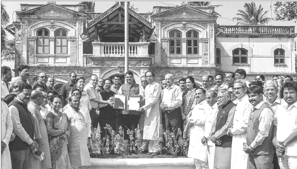
Mumbai, January 23, 2019: Tanü Mumbai yimti kübok Dadar nung Mayor indang bungalow ali Balasaheb Thackeray memorial committee nem bendanga agutsüba sentong nung Maharashtra Chief Minister Devendra Fadnavis, Shiv Sena tongti lenir Uddhav Thackeray, Mumbai Mayor Vishwanath Mahadeshwar, Shiv Sena youth wing tongti, Aditya Thackeray aser tangartem tangokba noksa nung angur.

Space Kidz India-i India nunger kaketshirtem atema art, science aser culture ajungkettsür.