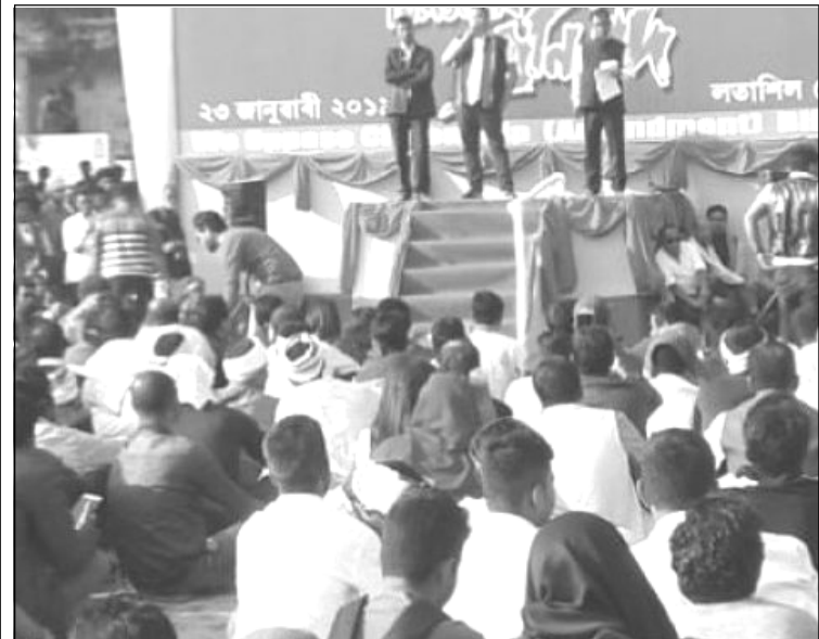
January 23 nü Guwahati nung AASU aser kin 30 lokti tenteti-i Braja Ninad ayongzüka akaba mapang tangokba noksa nung angur. Kin 30 aser All Assam Students' Union (AASU)-i ayongzüka longkak aitba sentong ajanga tang Citizenship (Amendment) Bill 2016 anema longkak aitba sentong tali akangshidaksüogo.

Ajisüka mapang timba ka nung Assam Police-i minister anema ken o benoktsü atidaka bilemba aser momulungba sayuogo.