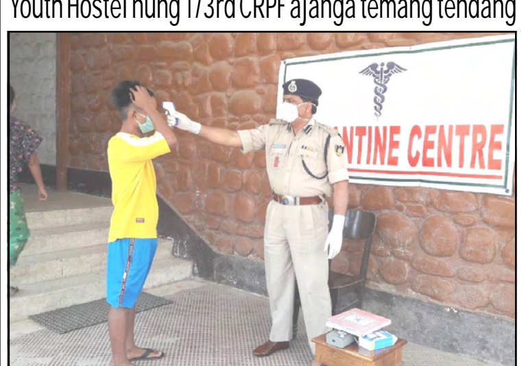
173rd CRPF Battalion Dimapur ajanga Youth Hostel Dimapur nung April 2, 2020 nü medical check up agiba noksa nung angur.

Dimapur, Rongchii/April 02 (TYO): 173rd CRPF Battalion Dimapur nungi medical team kaketshirtem ajak temang tendang aser kar gastric aser tepok moroba dak alaka ajak temang junga dang lir, ta ashi. Parnok nem sanitizer, dettol, hand wash aser sapon tem den mozü angadi agütsü.