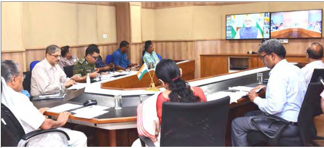
Thiruvananthapuram (Kerala), April 02, 2020: Brihostibarnü Kerala yimtiba, Thiruvananthapuram nung Kerala Chief Minister, Pinarayi Vijayan den ketdangsertemi Ato kilonser, Narendra Modi-i coronavirus dak sendakba nung ayongzükba video conference senden nung adenba noksa nung angur.