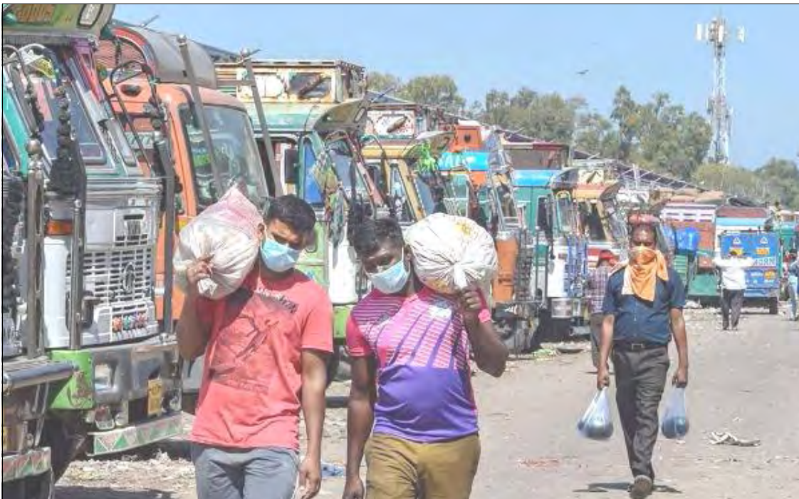
New Delhi, April 02, 2020: Coronavirus anema linük tesem ajak shibanger aliba mapang nung Brihostibarnü New Delhi nung aliba Azadpur bazar nung nisungtemi nungdakba oset/chiyungtsü belenba noksa nung angur.

Jamaat sentong nung adener tajemba agi nisung 400 dak novel coronavirus putetogo, ta metetdaksü. Taoba ita tomlen Delhi nung ayonga agiba Tablighi Jaamat senden nungji Tamil Nadu nungia nisung 1,500 shi dena liasü aser tang tashi nung nisung 1,131 bo state-i meyipa aruogo. Tamil Nadu nungi Tablighi Jamaat senden nung adener rongnung nisung 264 dak iba tashidak putetogo aser ano aika tebushidak lir. Bodhbarnüa Tamil Nadu nung novel coronavirus putetba nisung 110 pronglaji Tablighi Jamaat senden denner Tamil Nadu-i meyipa arurtem liasü. Tang India nung iba tashidak timtiba putetba tanabuba state ji Tamil Nadu kümogo.