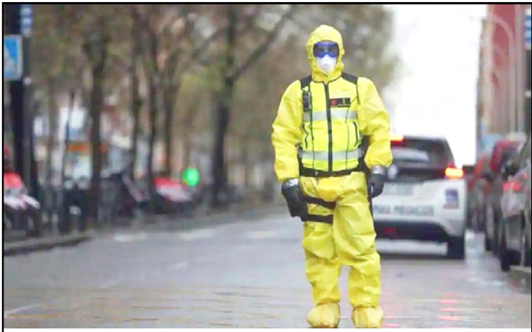
Madrid, Rongchii/April 02: Madrid, Spain nung coronavirus tashidak agi shirangertem IFEMA conference centre nung khen asoshi yanglua aliba mozü kidangi bener oa anepalutsü asoshi Emergency Military Unit züngsem ka COVID-19 agi shiranger bener aliba bus ataba mapang tangokba noksa nung angur.