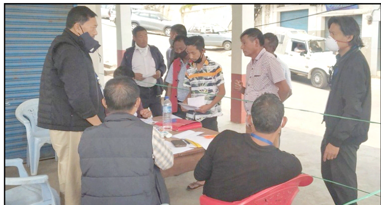
Core Team on Essential Commodities Covid-19 Mokokchung District (CTECCMD) züngsemtem Imlong Place Mokokchung nung mazüngi mapa inyakba mapang tangokba noksa nung angur. Iba telok ajanga Mokokchung town nung nungdakba chiyungtsütem ali mali itemji repringshimer dang tanga district kar densema Mokokchung district kübok town, yimtsüing aser ward balala dangi temelaba agüja bener yoker. Tang ya linük ajak shibangba mapang ka asünung nungdakba chiyungtsütem anüngakong masütsü Mokokchung, April 2, 2020.