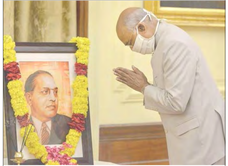
April 14, 2020 : Tir Ram Nath Kovind-i mask semer Rashtrapati Bhavan, New Delhi nung Babasaheb Dr B R Ambedkar nem pa asoba anogo tetushi agütsüba noksa nung angur.

Maoist den sendaktepa lir ta shia apuba, human rights activists pongu rongnung ka lir. Ajisüaka Supreme Court aser Bombay High Court-i pa aputsü nungi tekümzükba agütsü. March 16 nü Supreme Court-i pa dang hopta asem tsüngda bendanga agütsütsü asoshi tuyu, saka pai COVID-19 tashidak pokteter aliba mapang jail-i aobaji tasüi aoer den kasa dang ta shia mapang atsülangtsütsü asoshi mepeshia ken o ka benok. Justice Arun Mishra-i aniba bench kati April 8 nü ashiba agi, aija alirtemi anticipatory bail agintsü asoshi parnoki telemteba agiba akhümtsübuttsü asü aser parnok dang tuyuba ama hopta asem tsüngda bendanga agütsütsü asü. Pai pa anema ken o benokba ka danga magizük.