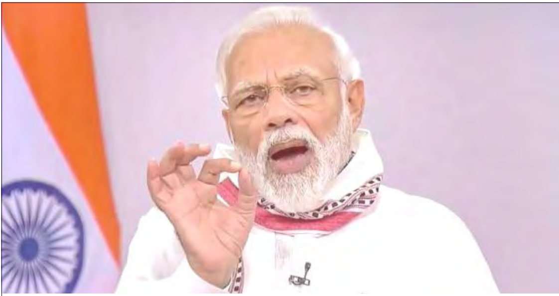
New Delhi, April 14, 2020: Ato Kiloner Narendra Modi-i video link ka ajanga linük nem osang agütsüba noksa nung angur. PM Modi-i linük ajunga maneni May 3 nü tashi mokdanga ayutsü sangdongogo.