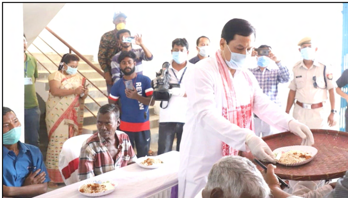
Mongulbarnü Dibrugarh kübok Khanikar nung Assam Chief Minister Sarbananda Sonowal-i temporary destitute shelter ka nung alir nem chiyungtsü lema agütsüba noksa nung angur. (Dibrugarh, April 14)

Shillong, April 14, 2020 (Agencies): Mongolbar anepdang, Shillong kübok Bethany mozüki nung anepalur shiranger ka pa sasa taküm agi, ta osang ajanga metetdaksü. Arishi küm 26 tain shiranger ya taoba hopta iba mozü kidang anepalutsü anioka liasü. Pa amungba ward indang kichiba nungi pongzüker asü, ta hospital kettangsertemi ashi. Shirangsang ya South West Khasi hills district kübok Mawkyrwat tesem nungi liasü aser pa tsükba tesem nungji dang atanga asü, ta kettangsertemisa ashi. Pai pa sasa taküm agiba ya indang kuli kecha mangu lir. Hombarnü, iba mozüki nung inyaker senior doctor ka dak COVID-19 aliba putetba sülen, iba mozüki nungi shiranger kati pa sasa taküm agiba osang angazüker. Tang iba mozüki ya kettangsertemi shibangja lir aser quarantine centre ka kümogo. Iba den külemi, East Khasi Hills district kettangsertemi Mongolbar anepdang nungi tenzüka Shillong aser iba jila meketa aliba tesemtem ghonda 48 atema curfew agüja lir.