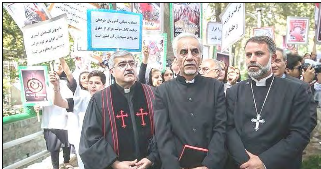
Iran yimtiba, Tehran nung aliba UN office kima Iran nung Khristan aser Muslim nung naprongla longjemer, Iraq nung Khristantem reshikangshiba anema longlak aitiba noksa nung angur. (file photo)

Tehran (Iran) April 14 (Agencies): Iran nung aliba tepoukdak balala nung Coronavirus tashidak proktsü tsübuba agi Iran ketdangsertemi Khristan aika tepoukdak nungi chiokogo.