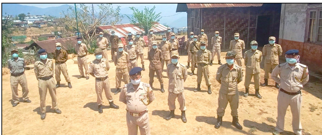
Dimapur, Rongchii/April 14, 2020: Covid-19 wara nokdangtsü asoshi jakyim sür inyakertem nem Village Guards (VGs), Lineman (Power Department) aser PHED tem longjemer maneni teyari agütsüba atema Shamator nung alir nüburtemi pelaba metetdaksüogo. Information Assistant indang office ajanga Shamator jila indang Village Guard (VGs) ajak nem mask peria lema agütsüba yangi noksa ajanga kuli sayur.

Iba ama tensa ka nung nüngdakba mapang teyari agütsütsü asoshi ASHA den volunteer ama training agitsü asoshi tenüngtem agütsütsü mepishiogo, ta kasa sangdong ajanga metetdaksü.