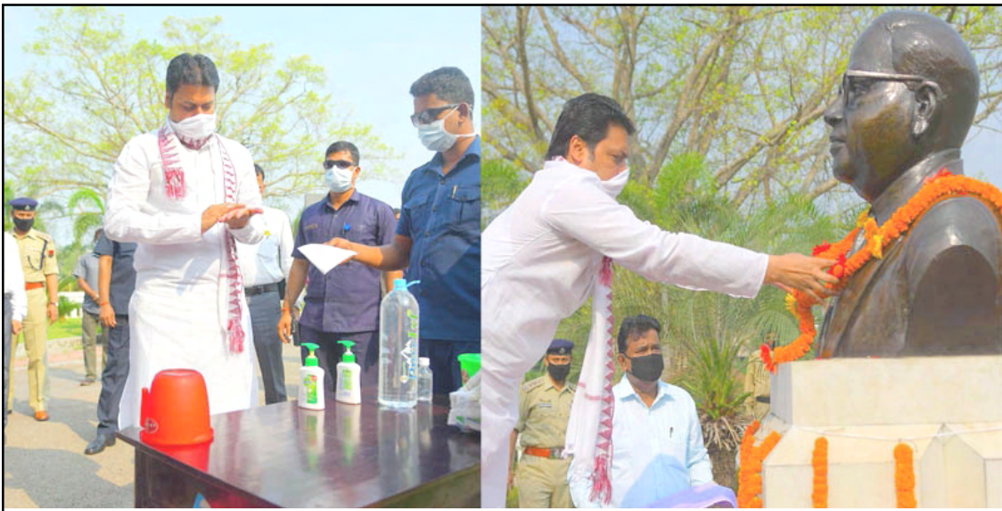
Mongulbarnü Agartala nung Tripura Chief Minister Biplab Kumar Deb-i Dr. B R Ambedkar kürakyanglu nung pa tasoba anogomung tenü nung naro ka yuja akhüm agütsüba sülen sanitizer agi teka merükba noksa nung angur. (Agartala, April 14)