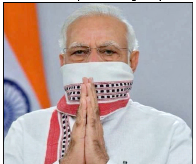
PM Modi-i Lengyan enokba atema Manipuri nungeri pelar.