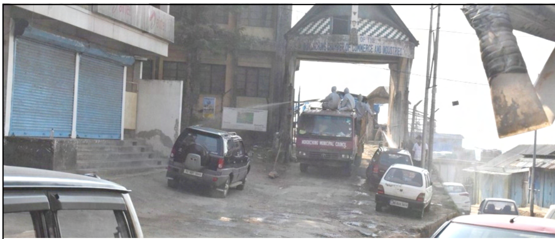
Tanu agi anogo pungu nu Mokokchung Municipal Council (MMC) Sanitation Worker-temi Mokokchung town nung tongtibang lenmang aser tesemtem nung mesen tepsetba mozü roka jajaba mapang tangokba noksa nung angur. Parnoki Mokokchung quarantine centre, shishilembaba tesem, office building, petrol pump, nübur bulua senzusenpongba tesem, town tiyong aser ward balala nung gari lenmangtem nung mozütemji roka jajaogo, ta osang angazüker. MMC sanitation worker-temi ani belem jenti arema nübur kumzuka ayutsü asoshi mapa tajung inyakba ngua senso aikati pelaba lemsatep. Mokokchung, April 14, 2020.