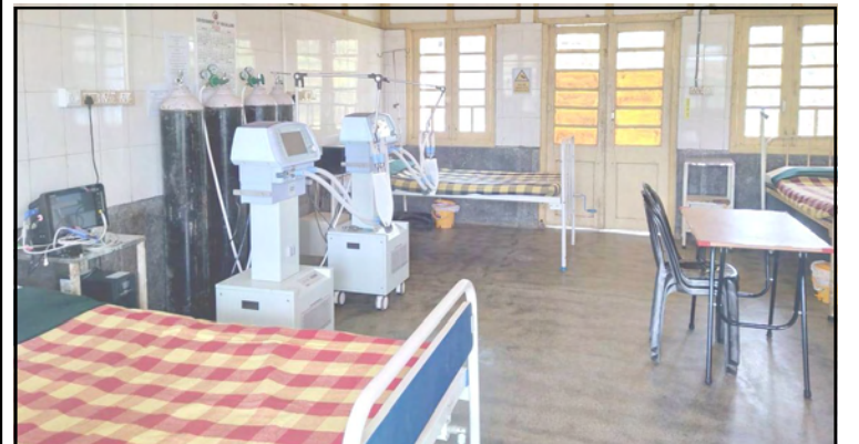
Covid hospital Mokokchung nung shirangertem asoshi yipten ana ya renema lir. (Mkg. April 14, 2020)

MCCI-isa mepishia ashi. Iba dak sentakba nung "Kodang alima tensa tia süngjema kümdir, chiyungtsü talila alidena ayur ket nungi onoki tanaben malizüiktsü, anungji, nüburtemi aji meteta shishidaktsünür", ta parnokisa shisem. "Iba lockdown ajanga Mokokchung nung business inyaker lenmang aisü nung takoksa ajurua arudaki, aji saka, nenok ajaki aremzüka bangdak den amalitepba asoshi talisa business inyaker ajak dang pelar", ta MCCI-isa ashi. Mokokchung Task Force-i anir Covid 19 tongpang nung yakbangsür (frontline workers), mezüng langzürtem (first responders), Core Committee on Essential Commodities COVID-19 Mokokchung aser lokti tentet shirnokisa iba alima wara anema raraba nung shilem agidar, parnok ajak dang MCCI-isa pelaba metetdaksü.