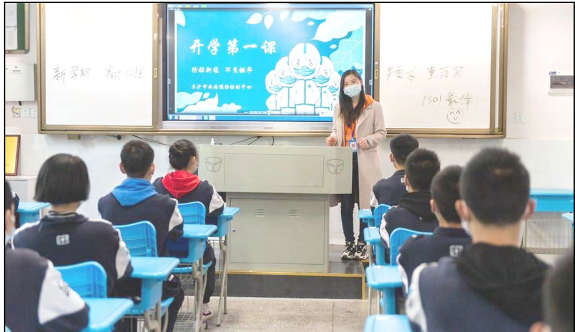
Central China kübok Hunan Province nung Ningxiang yimti nung aliba middle school ka nung mezüung class agiba mapang tesayuri kaketshir dang COVID-19 nungi kümzüka alitsü asoshi yimyatam sayuba noksa nung angur. Ningxiang yimti nung junior aser senior high school nung azünger kaketshirtem Hombarnü nungi school-i tanaben arur.