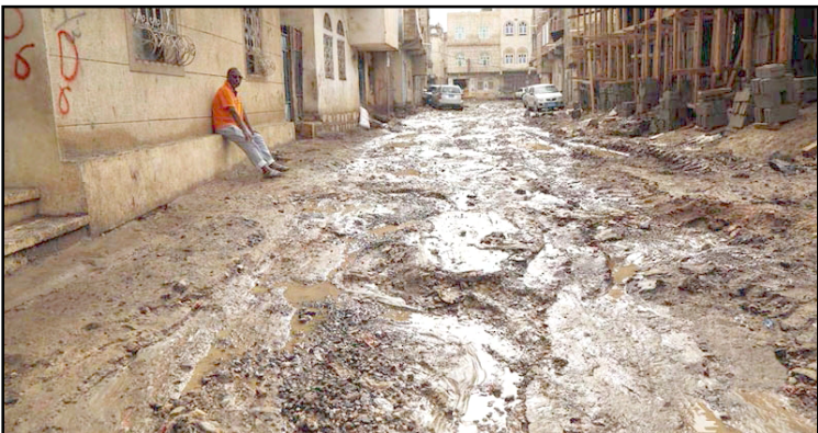
Sanaa, Rongchii/April 14 : Saana, Yemen nung April 14, 2020 nü tzünglu kanga sashia aruba ajanga tzümetsüung adokba sülen nisung ka par kima mena aliba noksa nung angur. Yemen yimtiba, Sanaa nung tzünglu kanga sashia aruba ajanga tzümetsüung adokba agi nisung ana taküm samatsü, ta yangji aliba ketdangsertemi Mongulbarnü ashi. Iba yimti nung tzümetsüung agi ki aika dak kongshi aser lenmang aika shibanga lir.

Arakan Army den yangji aliba telungpur telok anati tashidak wara mechi April ita ceasefire alitsü sangdong. Saka linük balalai mepishiba mitkartemi magizük aser taoba mapang sorkari rara anentsü sangdongba telungpurtemi mangashi, ta ashir.