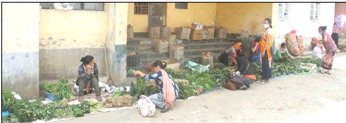
Mokokchung bazaar nung aonsotsü ayokertemi aonsotsü tapu balala ayokba yangi noksa nung angur. Lockdown mapang ka süaka nüburtem timtemba ngua tawa tanü district administration-i achayanga yimtsüng kar nungi aonsotsütem bener arua yokdaksüdar, ta osang angazüker. "Iba mapa ya yakta nungi tenzüksüba liasü, iba ajanga town nung alirtem dang masü saka aluyimertem lenmang aisü nung tajangzük angutsü, anungji, yimtsüng ajaki inyaktsüla", ta iba osangbener den senso kati jembidang lemsatsep. Mokokchung, April 14, 2020

asoshi inyaktsü ajungshir, ta sangdong ajangasa ashi. AKTD ajangasa ashiba agi, iba virus yagi takar-sensaker shinga mebendanger, aser nisung ajak dak iba virus menatsü tensa ka nung aliba mapang sorkari taküm libaliru, wadang mesüra kaa ita aliba mereprangi ajak nem talenba kasa agütsütsüla. Sorkari amenoka aliba quarantine facility tema tia kanga mejungi aliba angazüker. Junga anepalu masüba den nisung meimchir ayutsüba takdang tem nung koya senzüba osangtema angazüker. Anungji iba atema ketdangsertemi telangzüba agütsütsüla aser item tesemtem mürekmejutsüba ya teinyaktsü tongtibangtiba asütsüla, kechiaser item tesemtem ya ozüng nung aibeleneritem anidena ayuba tesem ka masü, ta AKTD ajanga ashi. Item kulitem ajanga asen sorkar tamendak dak tia chichiba sayur. Mapang meindoki yimten yimsüsür aser sorkar lenirtemi tali teyakyakba nung mera agitsüla, aji mesüra COVID-19 anema raraba kodanga makoktsü, ta AKTD sangdong ajangasa ashi.