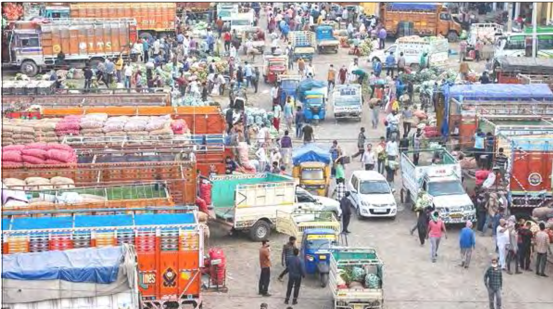
April 14, 2020 : Linük ajunga mokdang aliba mapang Jammu kübok Narwal tesem nung anosotsü shishilembadak tesem ka tangokba noksa nung angur.

belenshitsu asoshi gari agütsütsü mepeshi. Iba dak alia tzüyim nung anguba chiyongtsütema belener arua Janata Bazaar tem nung alitettsü ta, pai ashi. Jagan Mohan Reddy-i, ketdangsertem dang bazaar amenoktsü asoshi tesem jangjashitsü tuyuogo, ajita asünungdang kibong kar nembo tenüngdakba osettem agütsütettsü, ta ashi. Paisa, aluyimertem nem teyari agütsütsü asoshi oset jenjangtem Minimum Support Price (MSP) dak ajemdaker yanglutsü, ta metetdaksü. YSR Janata Bazaar project achaayangtsü asoshi IAS officer tejen ka shimtsü.