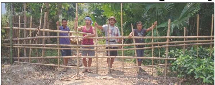
Anaki C nungi Ladigarth leni aluba lenmang nung Anaki C yimteni tangar marudaktsütsü asoshi lenmang lendi atsübanganga yur mitba noksa nung angur. Iba amai yimtsung shia Covid19 tashidak wara nokdangba mapa inyakdagi. (April 14, 2020)

Mkg. April 16 (TYO) : Tanü tamajung Covid19 tashidak alima ajaklen ayimsünga aoba wara nokdangtsü atema renema