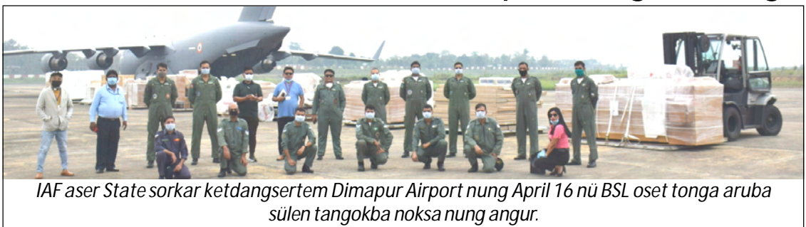
IAF aser State sorkar ketdangsertem Dimapur Airport nung April 16 nu BSL oset tonga aruba sülen tangokba noksa nung angur.

Dimapur, Rongchii/April 16 (TYO): BSL lab amenoktsü atema osettem IAF C -17 globemaster tayimtsü nung Dimapur tonga aruogo. Nagaland Angh RN Ravi aser India Defence Minister Rajnath Singh nati teyari aguja, NHAK, Kohima nung BSL -3 amenoktsü asoshi kanga nungdaka aliba sophisticated equipment tem densema oset ton 18 Mumbai nungi bener aruogo. Oset den külemi iba lab amenoktsü asoshi technical team ka dena aruogo. Tayimtsü koba April 15 nu tonga arutsü liasü iba tayimtsü ya Assam nung tsüngsang majungba ajanga marutet. Naga nungertem atema iba lab kanga nungdaka angateta IAF-i diplomatic channel balala ajanga Bangladesh Air space amshitsu merangdang, saka yipur anüdokleni nonger aoba ajanga