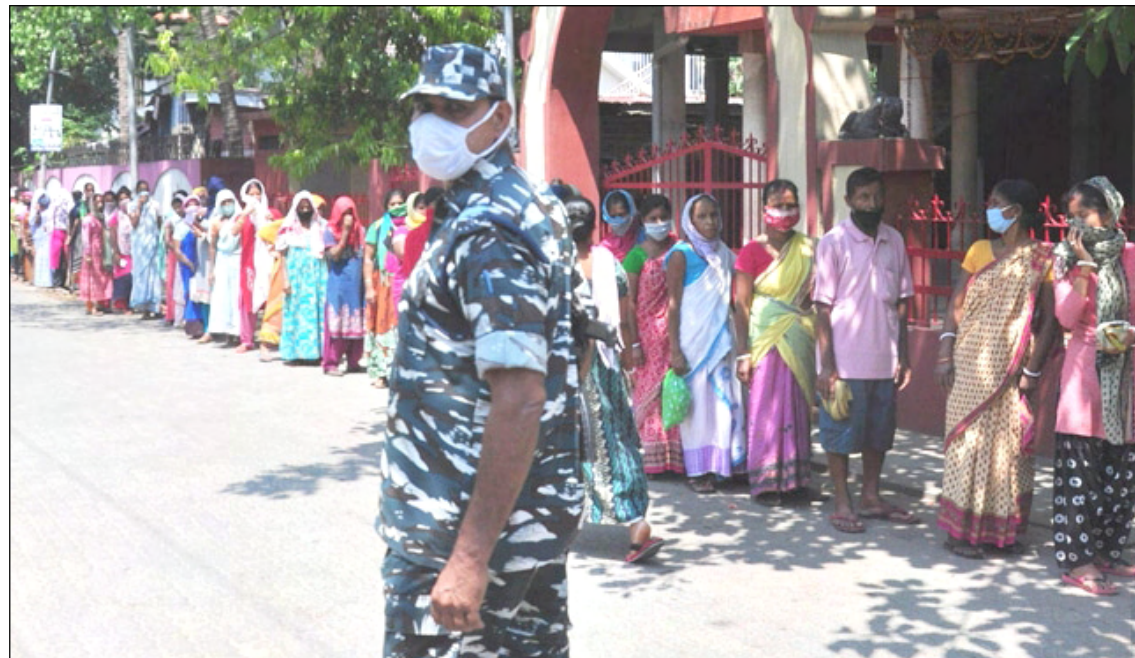
Guwahati, Rongchii/April 16, 2020: Alima ajunga asüingba wara ajanga India nunga lockdown anogo atsülangtsür aliba mapang ka nung, Brehostibarnü Guwahati yimti kübok Beltola, Bhagaduttapur tesem nung sensaker aser nüngdabapur tem nem NGO telok, Rising India Foundation ajanga jang-o-tzü lema agütsüba yangi noksa nung angur.

Item tesem nung nübur nem jang-o-tzü aser nündakba osettsüsettem lema agütsüba mapang lockdown ozüing agi melaba ama nisung tem kari ka dak khenyongi mekongshii aser menungtepdaksüi tetsüingda ita pilar nokdaksüo.