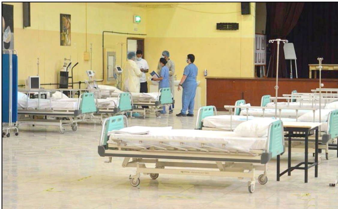
April 16, 2020 nü agiba noksa ka nung Farwaniya Governorate, Kuwait nung aliba mozüki tasen ka angur. Novel coronavirus prokshiba azüoktsü merangba maparen nung shilem ka ama Kuwaiti Ministry of Defense ajanga Bresthostibarnü iba Farwaniya Governorate nung aliba mozüki ya renem. Tang iba mozüki nung COVID-19 agi shiranger anepalutetsü.

Bresthostibarnü linük nung nisung tasen 22 dak coronavirus tasenba putet, ta Korea Centers for Disease Control and Prevention ajanga ashi, aser tang linük nung iba tashidak agi mener alir ajak senteper nisung 10,613 lir.