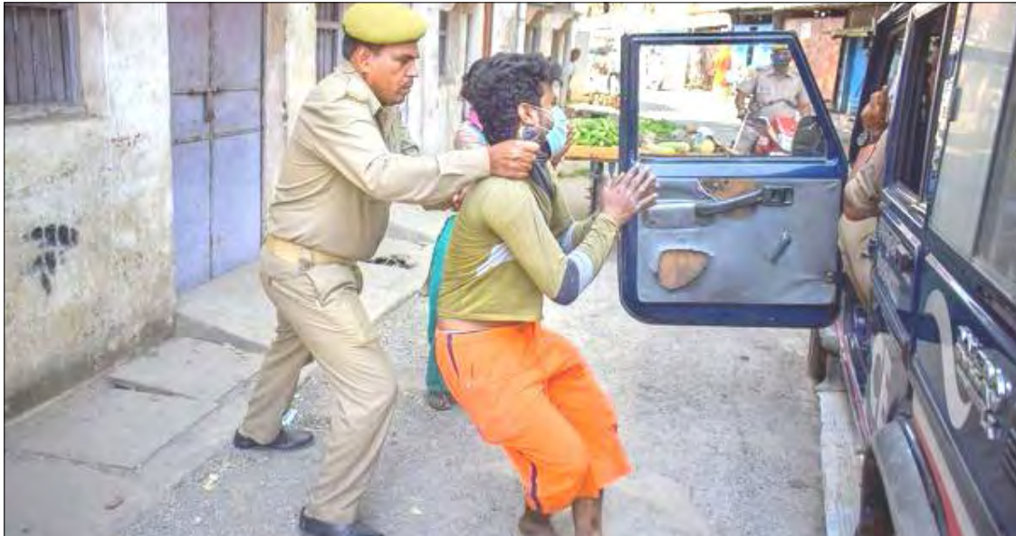
Prayagraj, April 16, 2020: Brihostibarnü Uttar Pradesh kübok Prayagraj nung ketdangsertem tetuyuba alema inyaker nisung ka police-i apuba noksa nung angur.

Coronavirus anema raratsü atema India-i Germany, US, UK, Malaysia, Japan aser France linüktem dang nungia medical osettem alizüktsü, ta ketdangsertemisa metetdaksü.