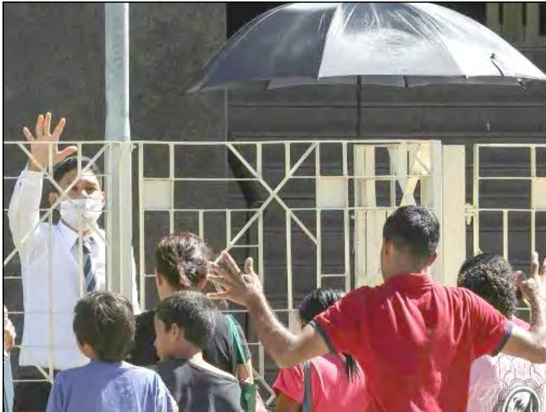
Pastor kati Khristianpurtem atema sarasademtsüba yangi noksa nung angur.

April 12, 2020: Tang coronavirus tashidak agi alima tesem ajaklen nisungtem timtemdar, ajisüaka iba tashidak agi tamajungtiba kongshirtemji Africa nung reshikangshi tia nung aliba Khristantem asütsü, ta osang ka ajanga metetdaksü.