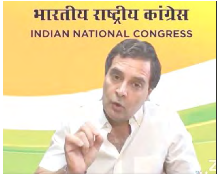
New Delhi, April 16, 2020: Brihostibarnü New Delhi nung Congress lenir, Rahul Gandhi-i video link ka ajanga COVID-19 dak sendakba nung osangbenertem den jembiba noksa nung angur. Rahul Gandhi-i linük tesem ajaklen coronavirus tashidak tendangtsüla, ta jembia liasü.

Indian Council of Medical Research-i, tanü tashi nung nisung 2,90,401 dak nungi samples agizüka coronavirus tashidak tendangogo aser iba nungji yashi samples 30,043 tendangba densema lir, ta metetdaksü.